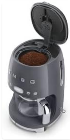
Figure 3: Top lid open, showing the filter basket for coffee grounds.