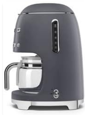
Figure 2: Side view showing the water level indicator.