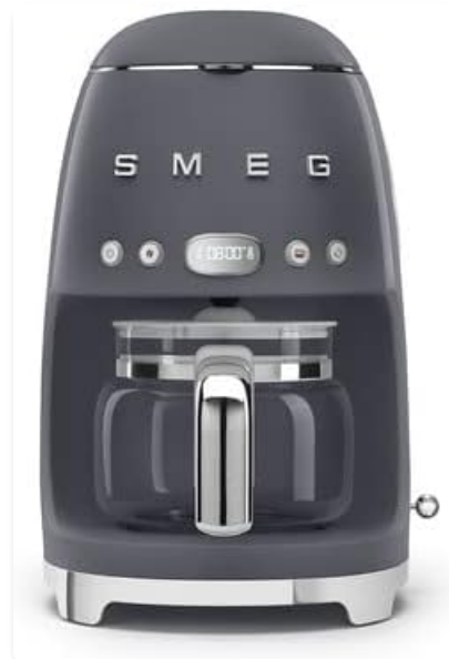
Figure 1: Front view of the Smeg Drip Coffee Machine.