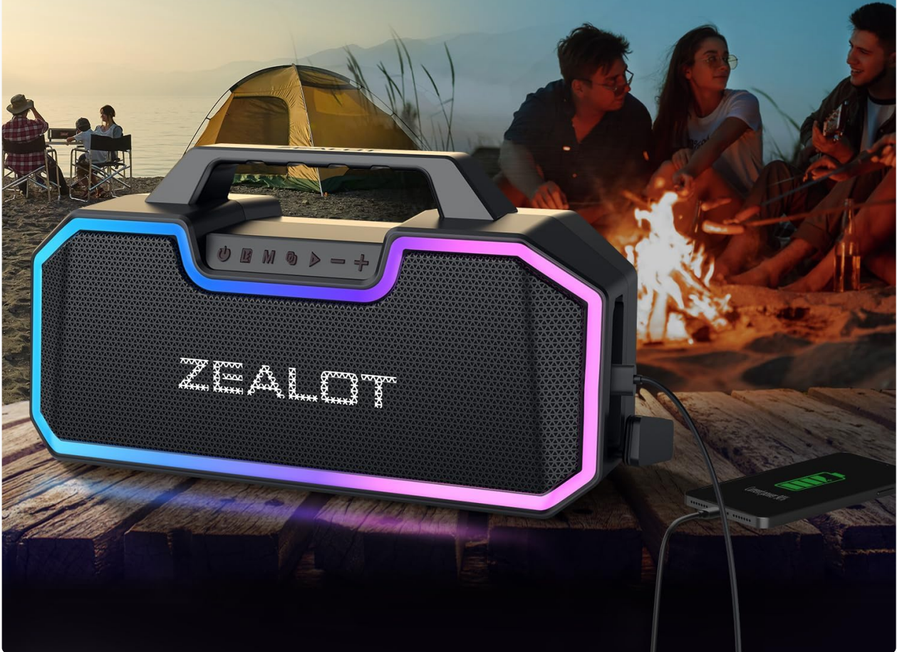
Image: The ZEALOT S57 speaker connected via Bluetooth to a smartphone, illustrating the wireless connection.