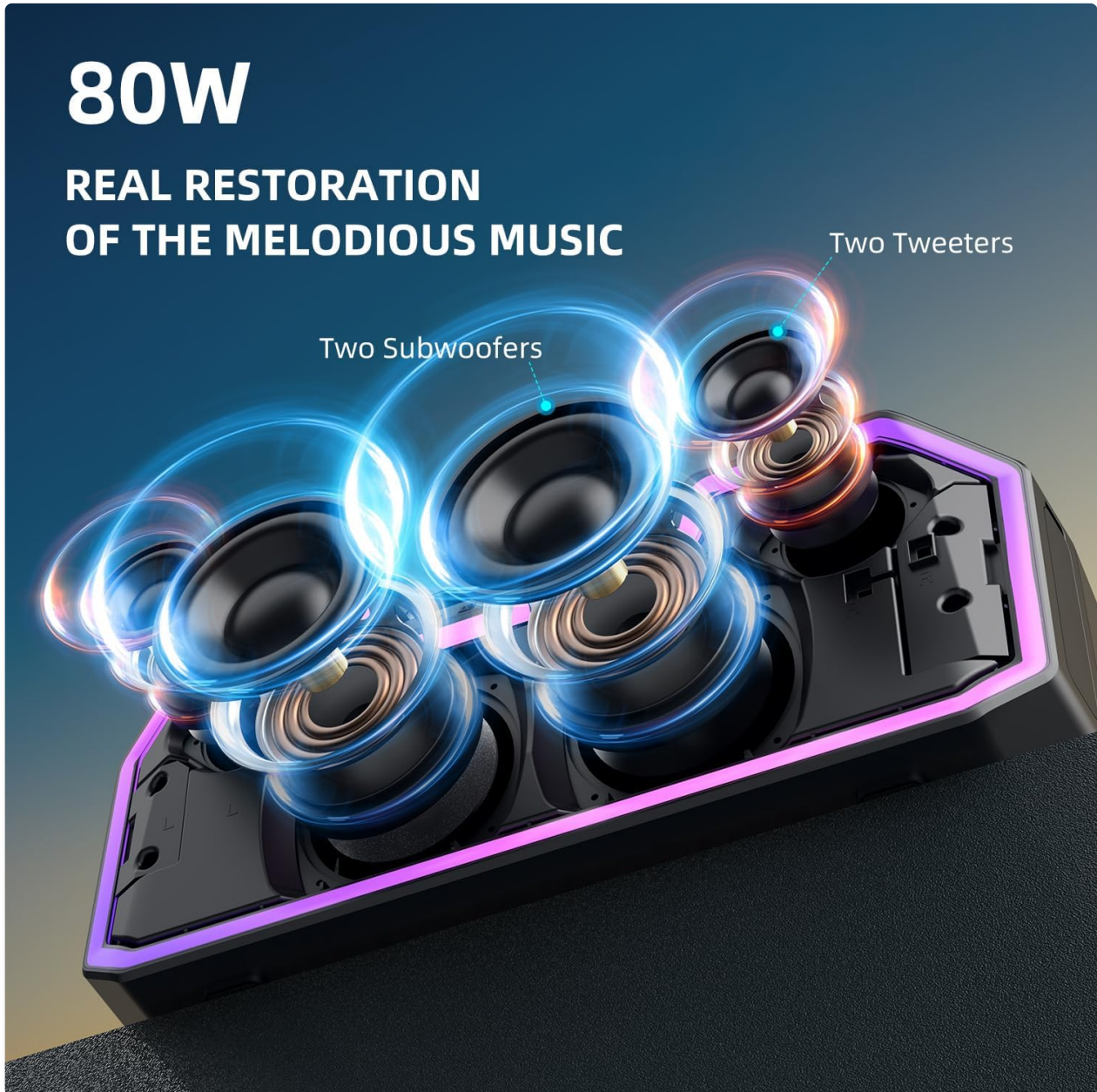
Image: The ZEALOT S57 speaker displaying its colorful RGB lighting effects.