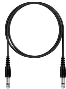
Línea de Sonido

Image: ZEALOT S57 Package Contents. Shows the speaker, user manual, Type-C charging cable, and 3.5mm AUX cable.