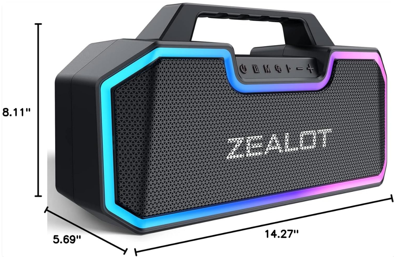
Image: Diagram showing the dimensions of the ZEALOT S57 speaker: 8.11" height, 14.27" width, and 5.69" depth.