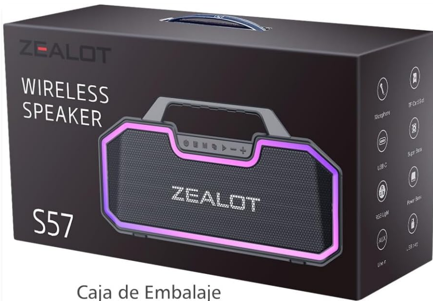
Caja de Embalaje