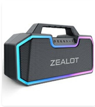
Image: Close-up of the ZEALOT S57 speaker's control panel, showing the power, light, mode, dual pairing, play/pause, and volume buttons.