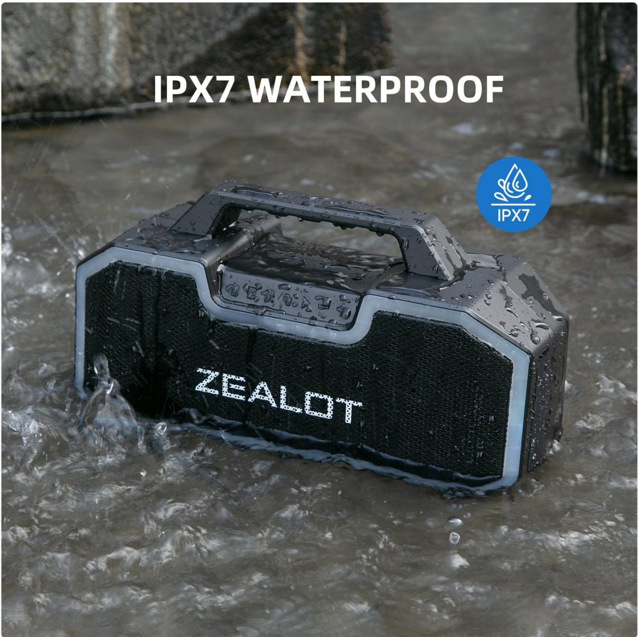
Image: The ZEALOT S57 speaker partially submerged in water, demonstrating its IPX7 waterproof rating.