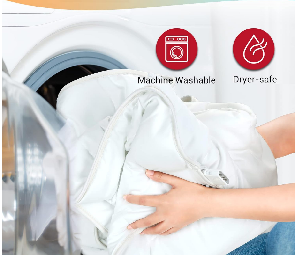
Image: A person placing the heated mattress pad into a washing machine, illustrating its machine washable feature for easy cleaning.