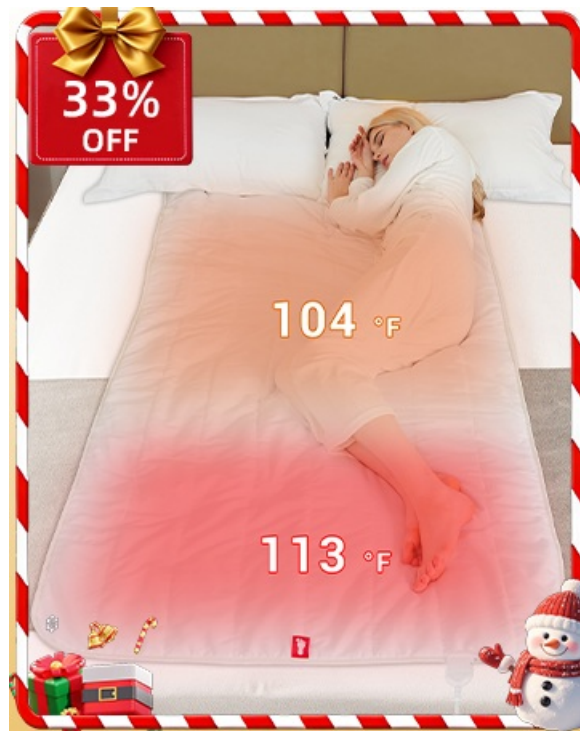
Image: A woman sleeping peacefully on the heated mattress pad, emphasizing the smooth surface and ultimate comfort provided by its design.