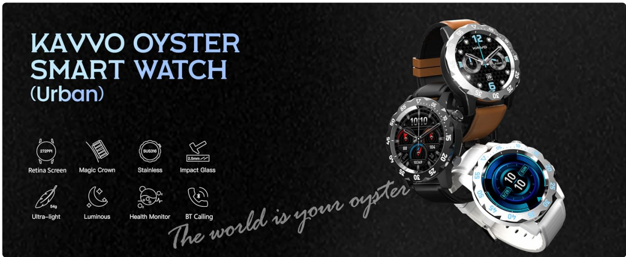
Image 5.1: Health monitoring features including heart rate, sleep, and SpO2.

Monitor your daily steps, distance, and calories burned. Set activity goals within the app to stay motivated.