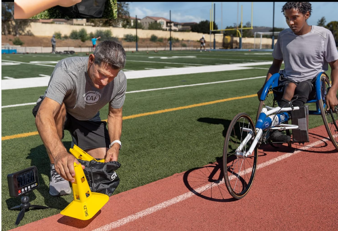
Image: Detailed view of the SKLZ Speed Gates timer, highlighting its digital display and user interface buttons for operation.