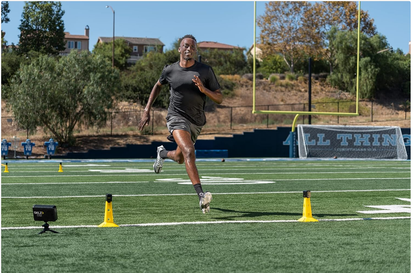
Image: A user setting up one of the SKLZ Speed Gates on a green field, demonstrating the placement of a sensor cone.