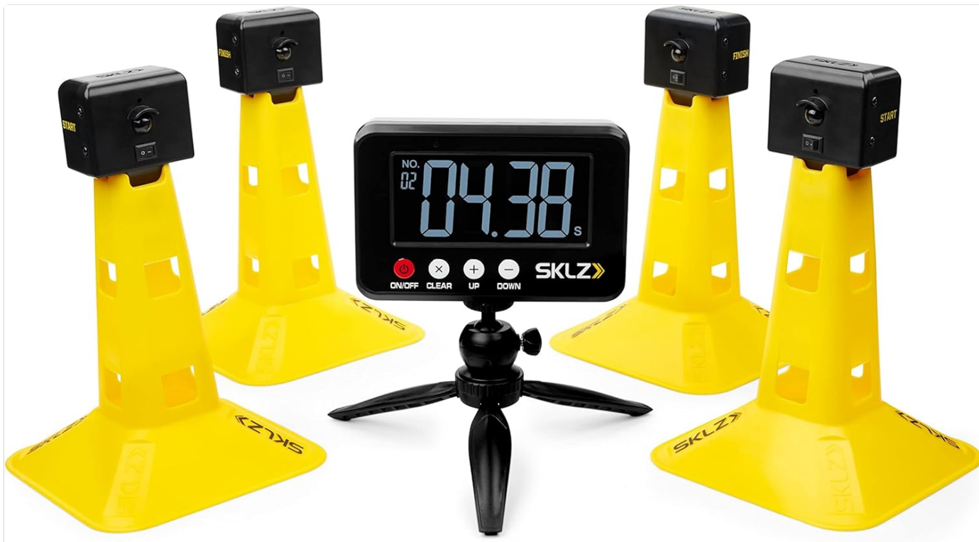
Image: Overview of the SKLZ Speed Gates system, showing the four yellow cones with integrated sensors and the central digital timer unit mounted on a small tripod.

The SKLZ Speed Gates system is designed to accurately track and record athletic speeds up to 50 yards. It is ideal for various sports training scenarios, allowing users to monitor progress and compare performance. The system includes four cones, four sensors, a timer, and a carry bag for portability.