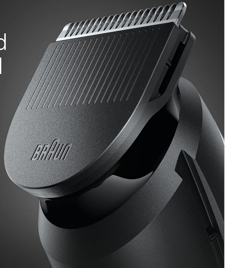
Image: A close-up view of the ultra-sharp blades of the Braun trimmer, highlighting their precision design for effective cutting.