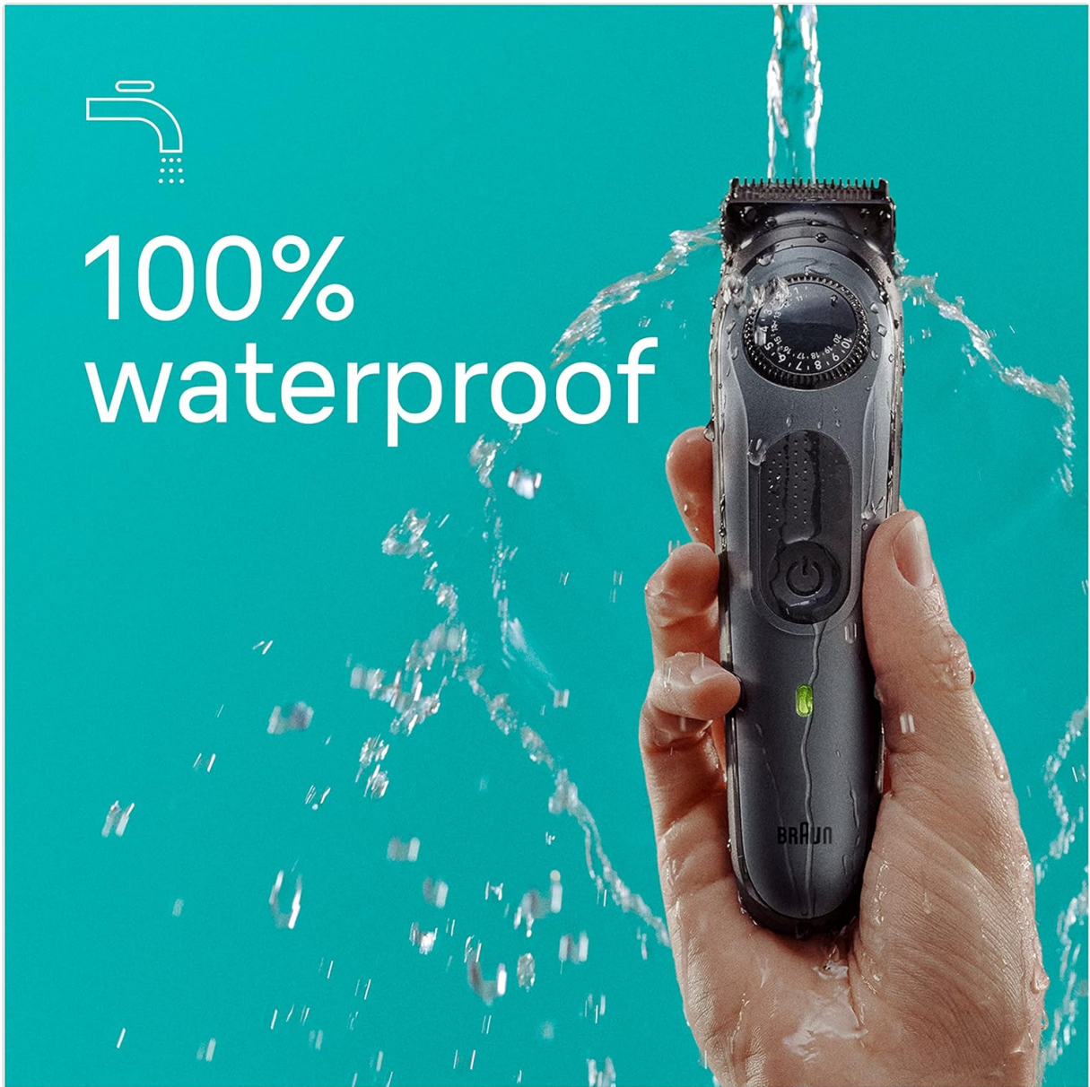
Image: The Braun All-in-One Style Kit Series 5 5471 being held under running water, illustrating its 100% waterproof design for easy cleaning.