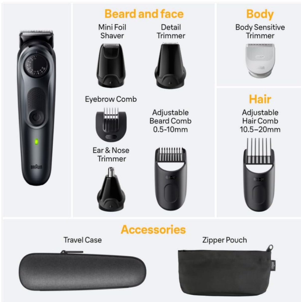
Image: All components of the Braun All-in-One Style Kit Series 5 5471, including the main trimmer unit, various combs, specialized heads (body groomer, ear & nose trimmer, detail trimmer, mini foil shaver), cleaning brush, and storage pouches.