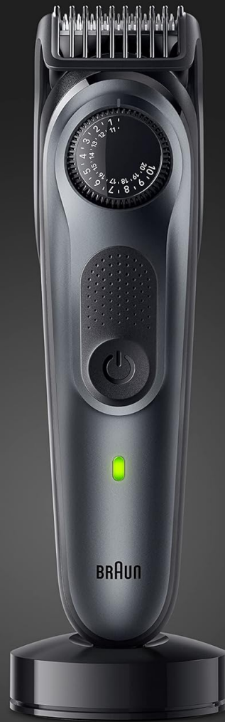
Image: The Braun All-in-One Style Kit Series 5 5471 trimmer standing upright, indicating its 80-minute cordless runtime and charging status with a green light.