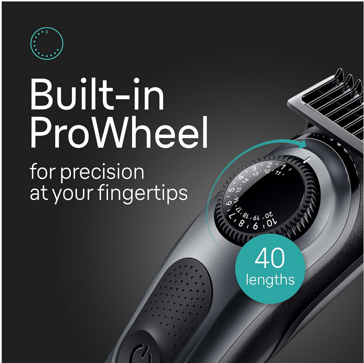
Image: A detailed view of the Precision Wheel on the Braun trimmer, illustrating its 40 distinct length settings for precise grooming.