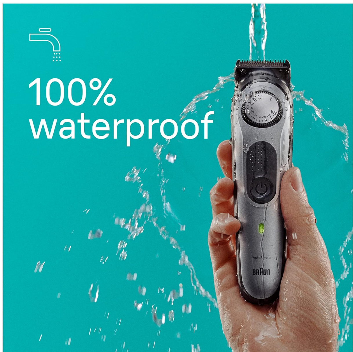
Image 6.1: The trimmer being held under running water, demonstrating its 100% waterproof design for easy cleaning.

The Braun Series 7 7420 is 100% waterproof, allowing for easy cleaning under running water.