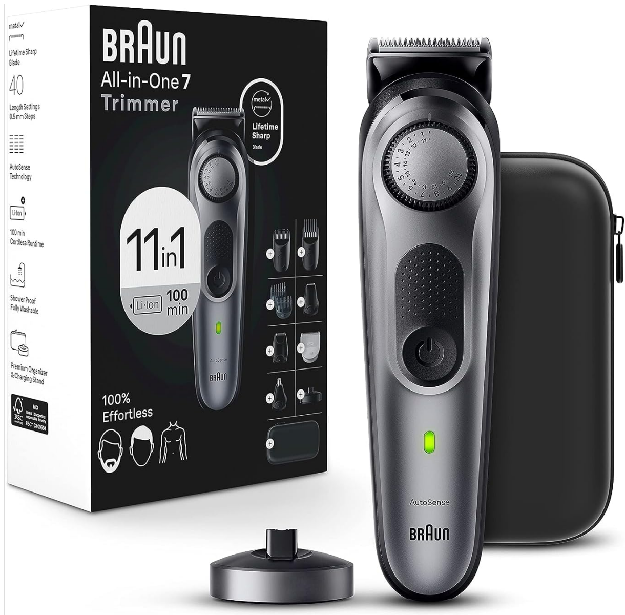
Image 1.1: Braun Series 7 7420 All-in-One Trimmer, showcasing the device, its packaging, charging stand, and travel case.