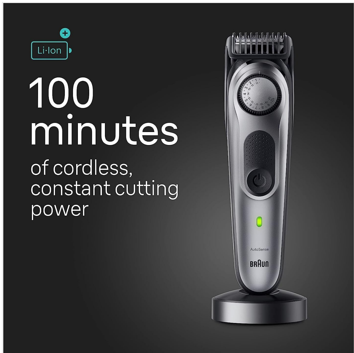
Image 4.1: The trimmer positioned on its charging stand, illustrating the device's 100-minute cordless operation capability.