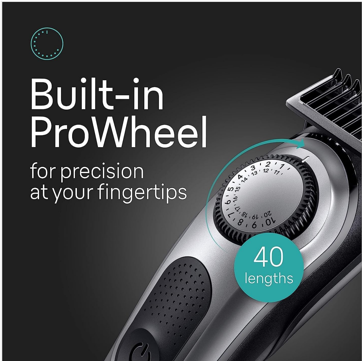
Image 5.2: A detailed view of the trimmer's Precision Wheel, indicating the 40 available length settings for precise grooming.