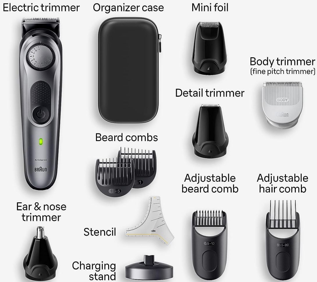
Image 3.1: A visual representation of all 11-in-1 components included in the kit, such as the electric trimmer, various combs, specialized heads, charging stand, and organizer case.