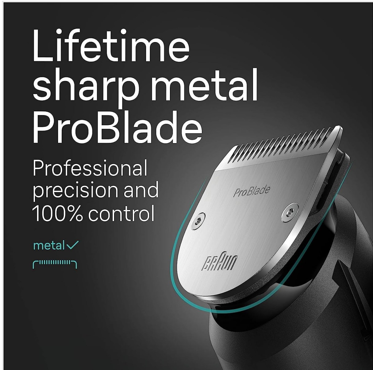
Image 6.2: A detailed shot of the ProBlade, emphasizing its durable metal construction and sharp cutting edge.

The ProBlade is designed for lifetime sharpness. For optimal performance, ensure blades are kept clean and free of debris. Oiling is generally not required for these self-sharpening blades, but refer to specific instructions if included with your device for any additional recommendations.