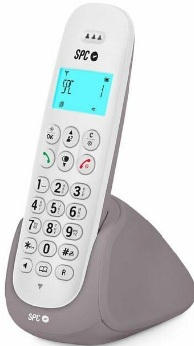
Image: The SPC KEOPS 7310BS cordless phone in white, showing the handset and base station. This image represents the product for which batteries are being installed.