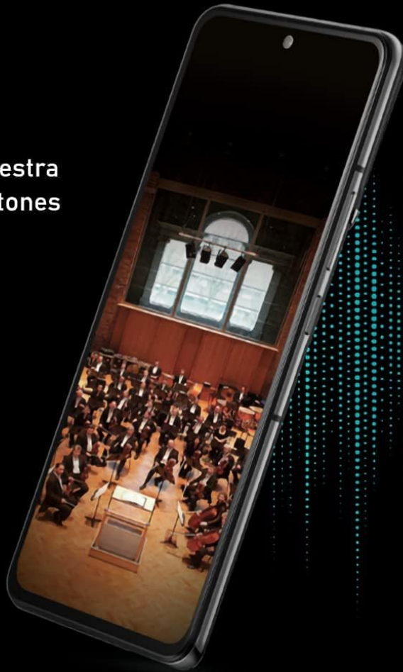
Image: The VERTU iVERTU-81 smartphone displaying an image of an orchestra, accompanied by text highlighting 'Master Sound Quality', '3D audio technology', 'HiFi sound quality', and 'London Symphony Orchestra compiled exclusive ringtones'.