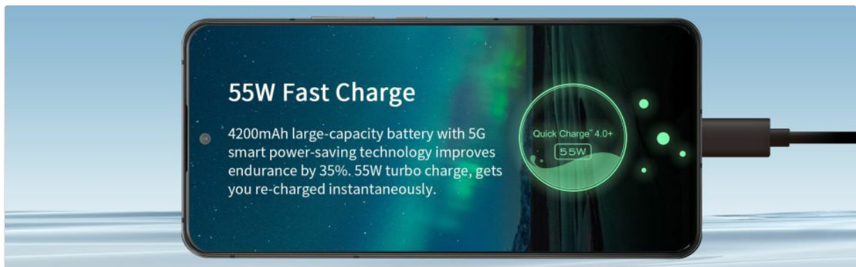
Image: The VERTU iVERTU-81 smartphone connected to a charger, displaying a '55W Fast Charge' notification on its screen, indicating rapid battery replenishment.