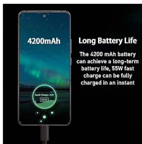
Image: The VERTU iVERTU-81 smartphone connected to a charger, displaying '4200mAh Long Battery Life' and '55W fast charge' text, emphasizing its battery capacity and quick charging capability.