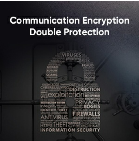
Image: A visual representation of a safe door, overlaid with various security-related terms such as 'encryption', 'firewalls', 'privacy', and 'information security', illustrating the concept of 'Communication Encryption Double Protection'.