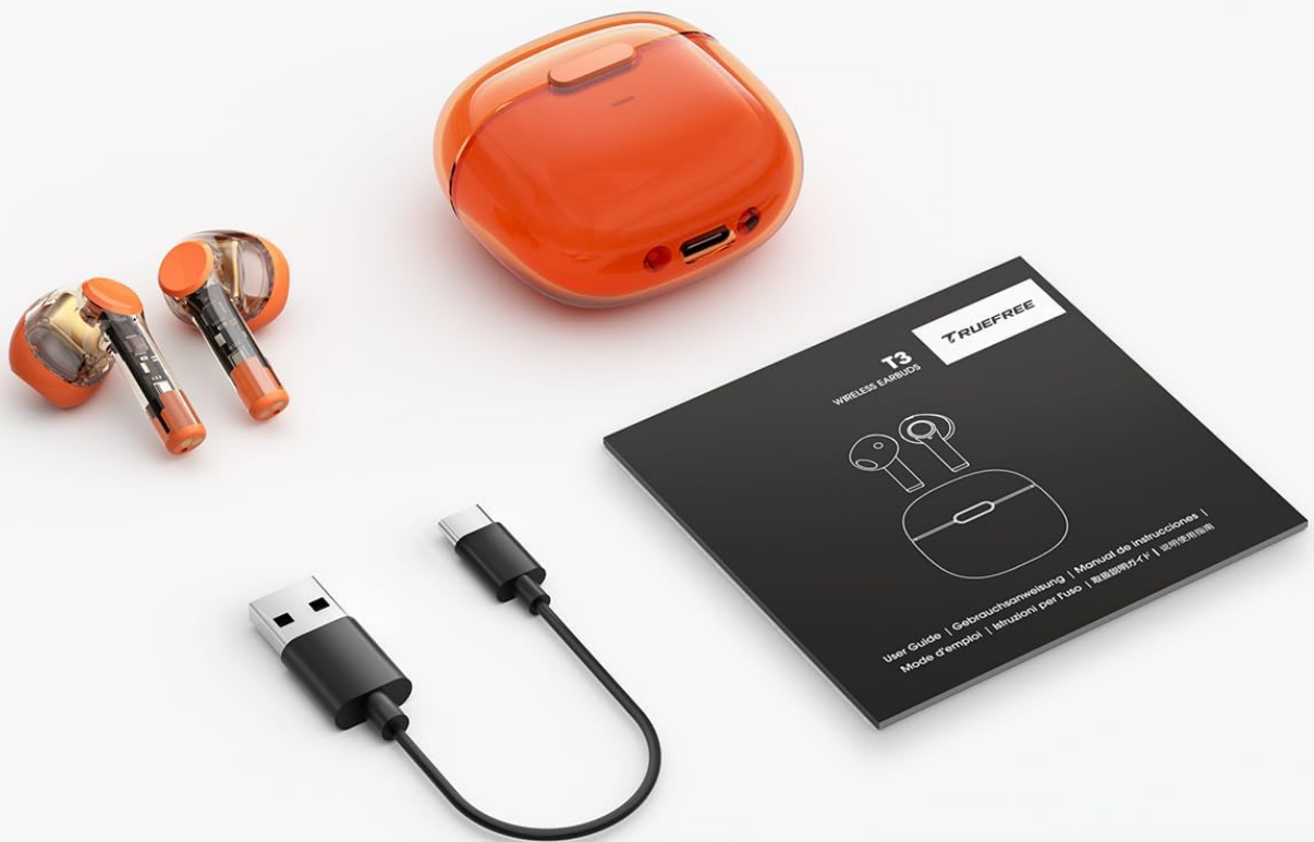
Image: Representation of Bluetooth 5.3 technology.