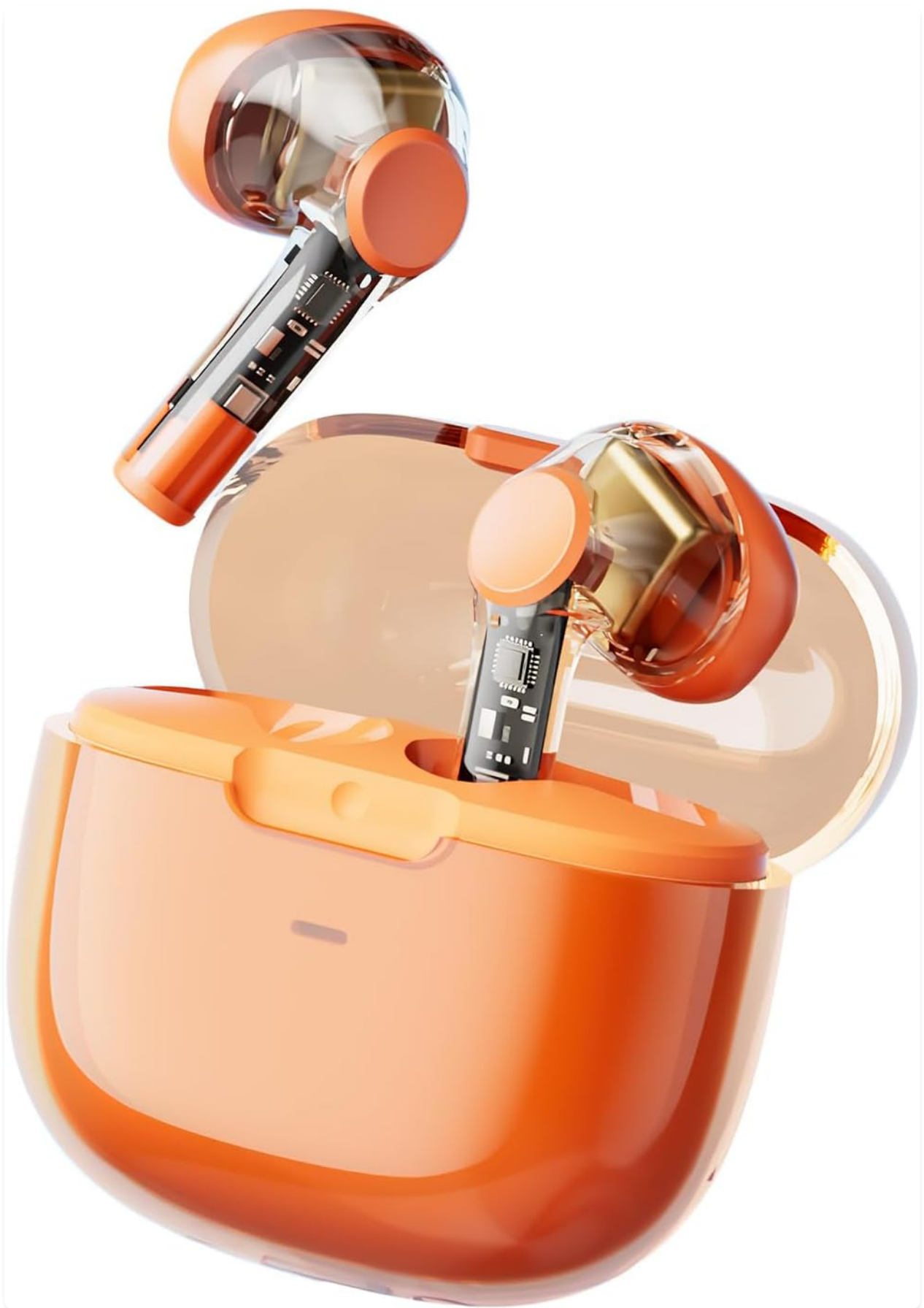
Image: truefree T3 Earbuds and Charging Case.