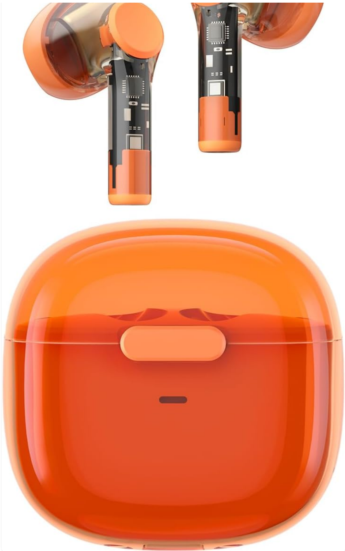
Image: Top view of the earbuds and case, highlighting the transparent design.