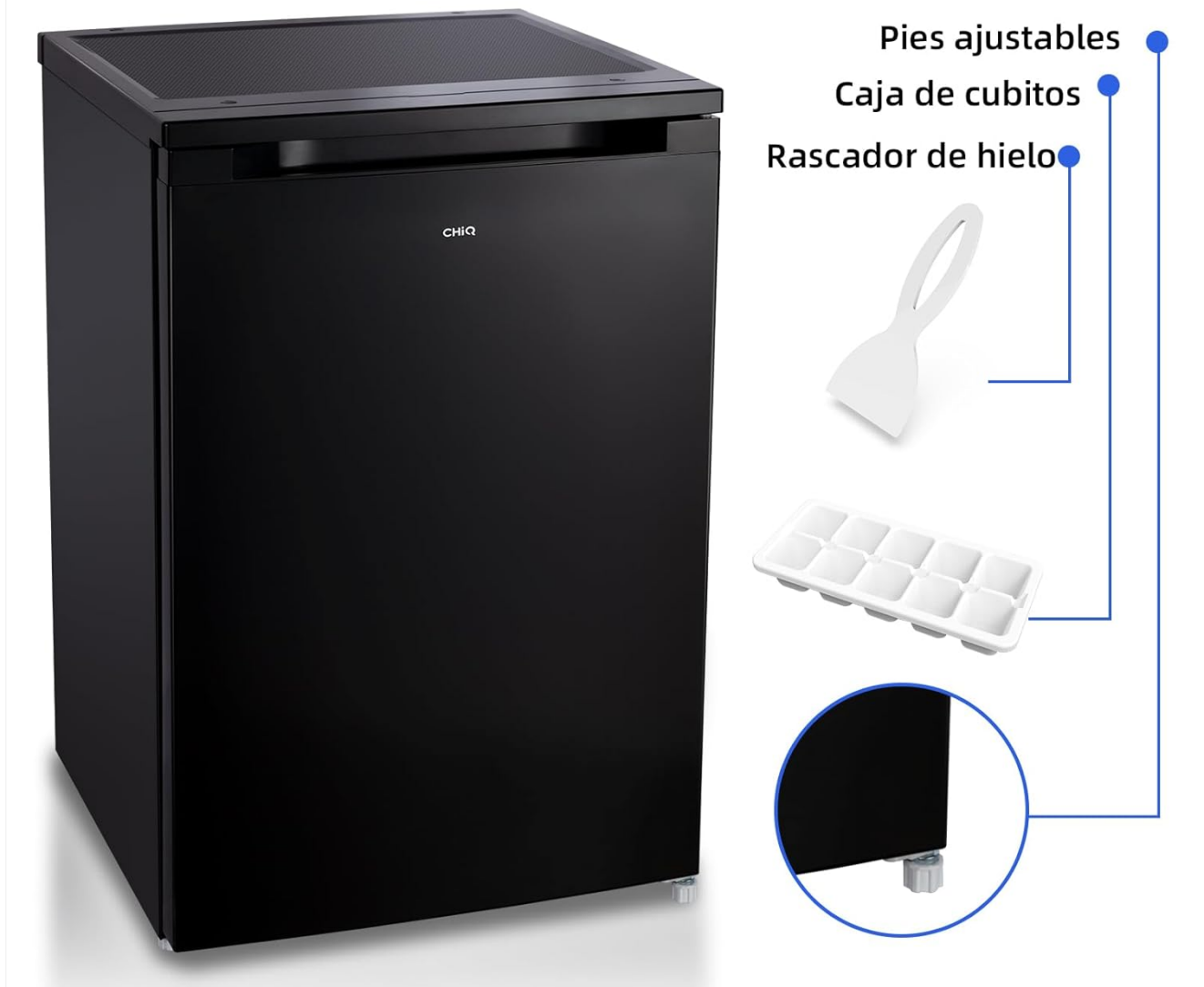
Image: The CHI Q CSD90D4D vertical freezer shown with its adjustable feet, an ice cube tray, and an ice scraper, highlighting its compact design suitable for under-counter placement.