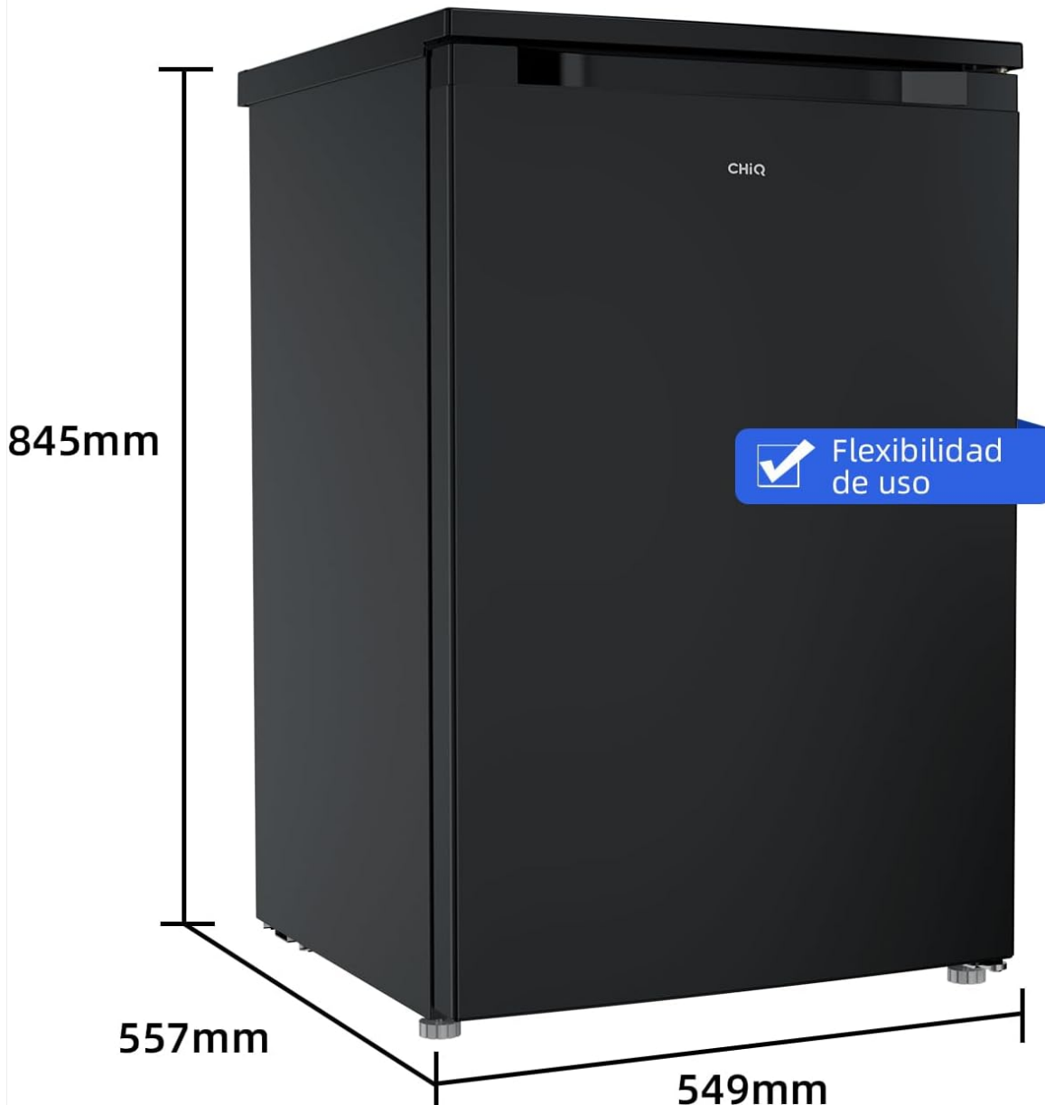
Image: A diagram illustrating the exterior dimensions of the CHI Q CSD90D4D vertical freezer, showing its width (549mm), depth (557mm), and height (845mm).