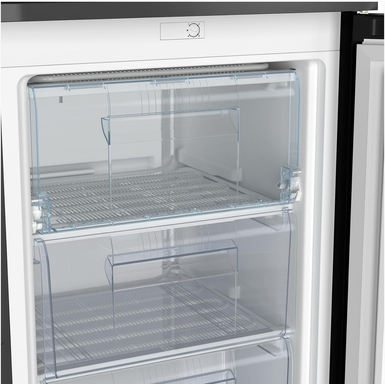
Image: A detailed view of the CHI Q CSD90D4D freezer's interior, highlighting the transparent drawers and shelves, which can be removed for cleaning.