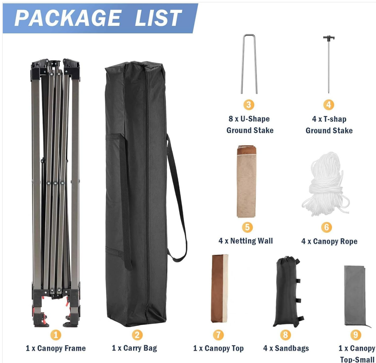
Image: Illustration demonstrating the use of ground stakes and sandbags to enhance the gazebo's stability.