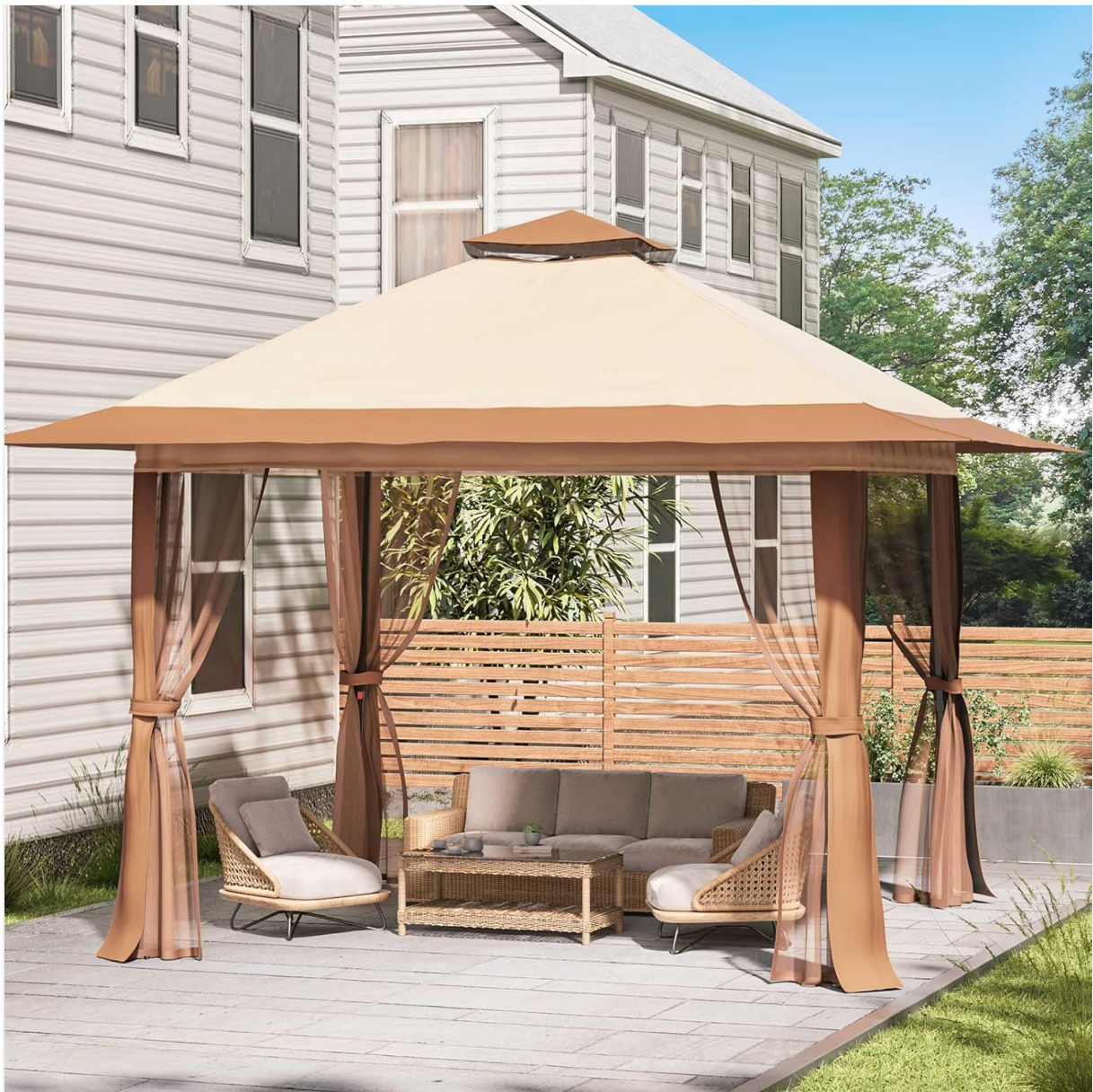
Image: The UDPATIO 13'x13' Pop up Gazebo Canopy Tent, fully assembled, providing shade and shelter in an outdoor patio area.