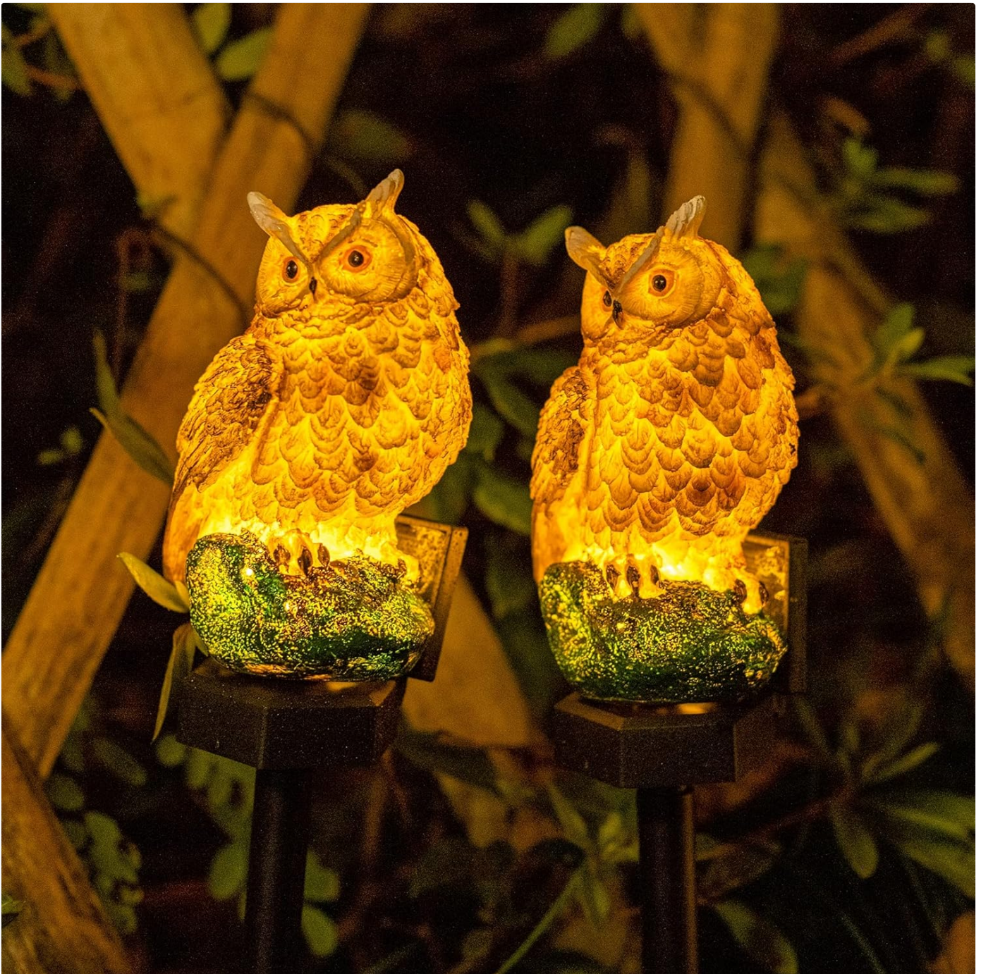
Image: Two Dazzle Bright owl solar lights illuminated at night, providing a warm glow to the surrounding foliage.