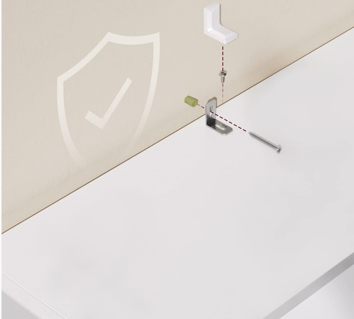
Image: A visual guide demonstrating the proper installation of the anti-tip kit to secure the bookshelf to a wall, ensuring stability and safety.