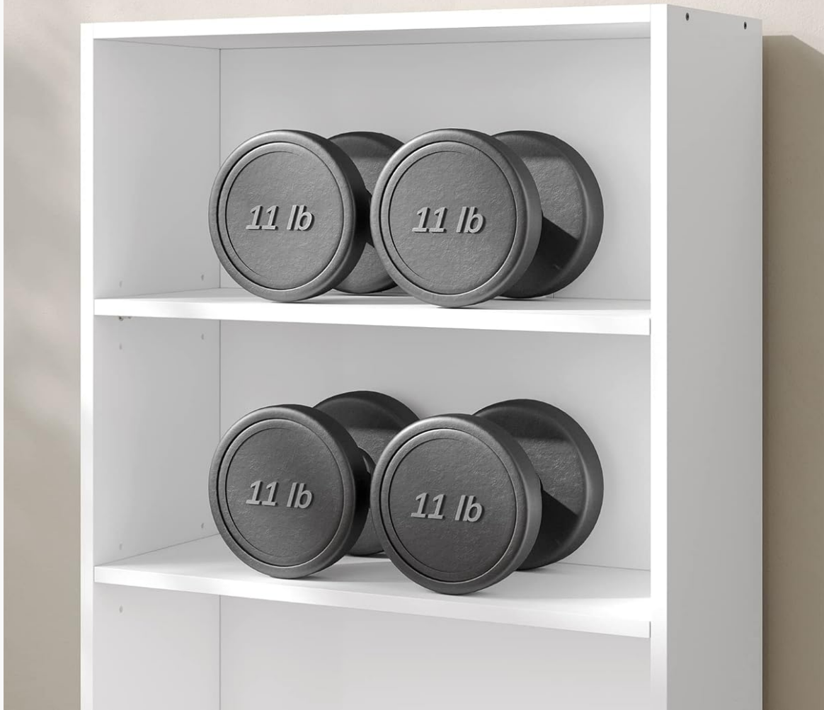
Image: The bookshelf shelves supporting heavy dumbbells, visually demonstrating its high load capacity of up to 22 lb per shelf and 88 lb total.