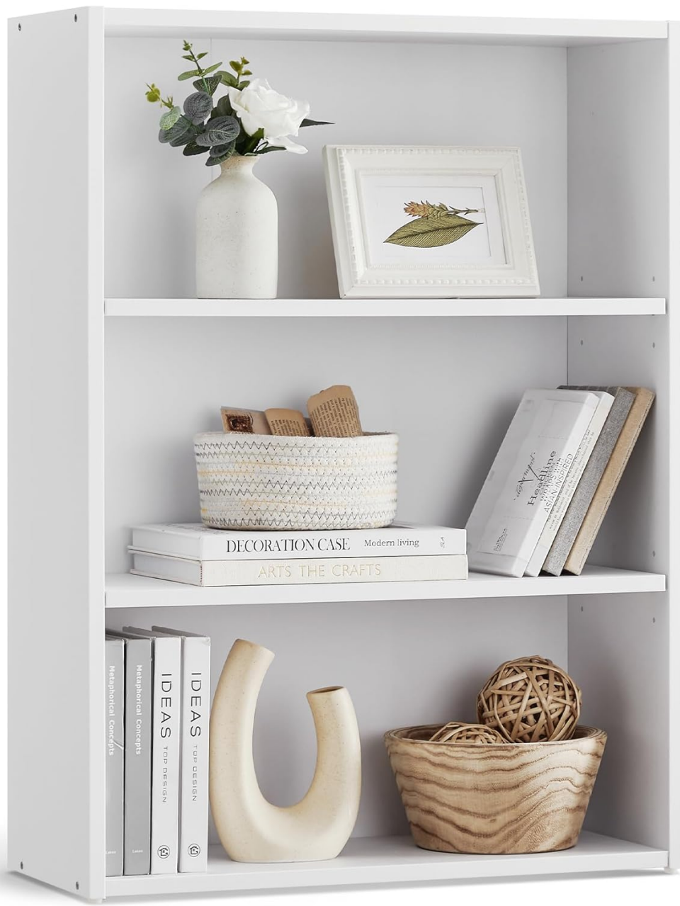
Image: The VASAGLE CUSTOS Collection 3-Tier Bookshelf in Cloud White, showcasing its open design and capacity for books and decor.