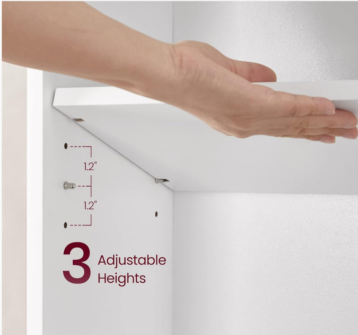
Image: A close-up view highlighting the adjustable shelf feature, showing the peg holes that allow for three different height settings, each adjustable by 1.2 inches.