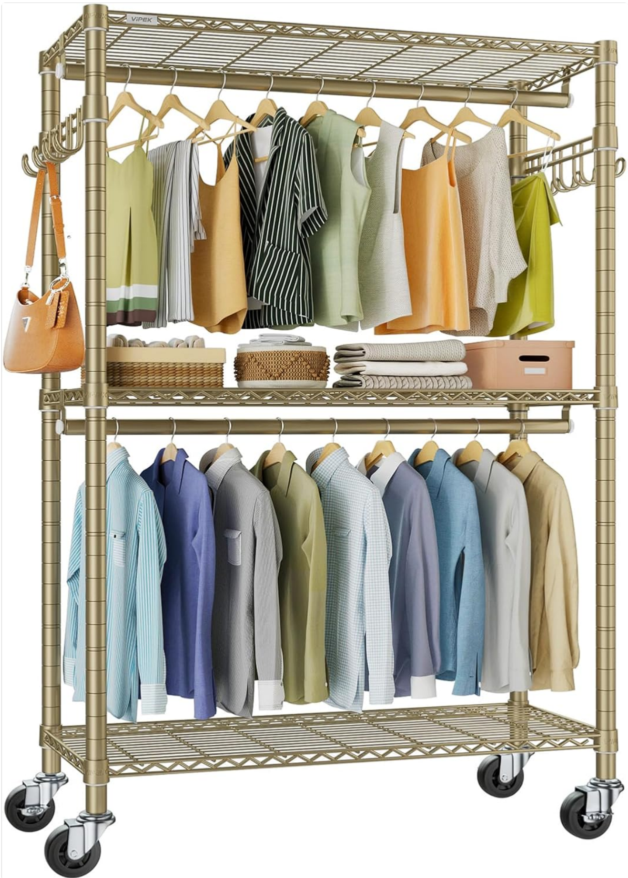
Figure 2.1: Fully assembled VIPEK R2 Plus Rolling Clothes Rack, showcasing its three tiers, double hanging rods, and side hooks.