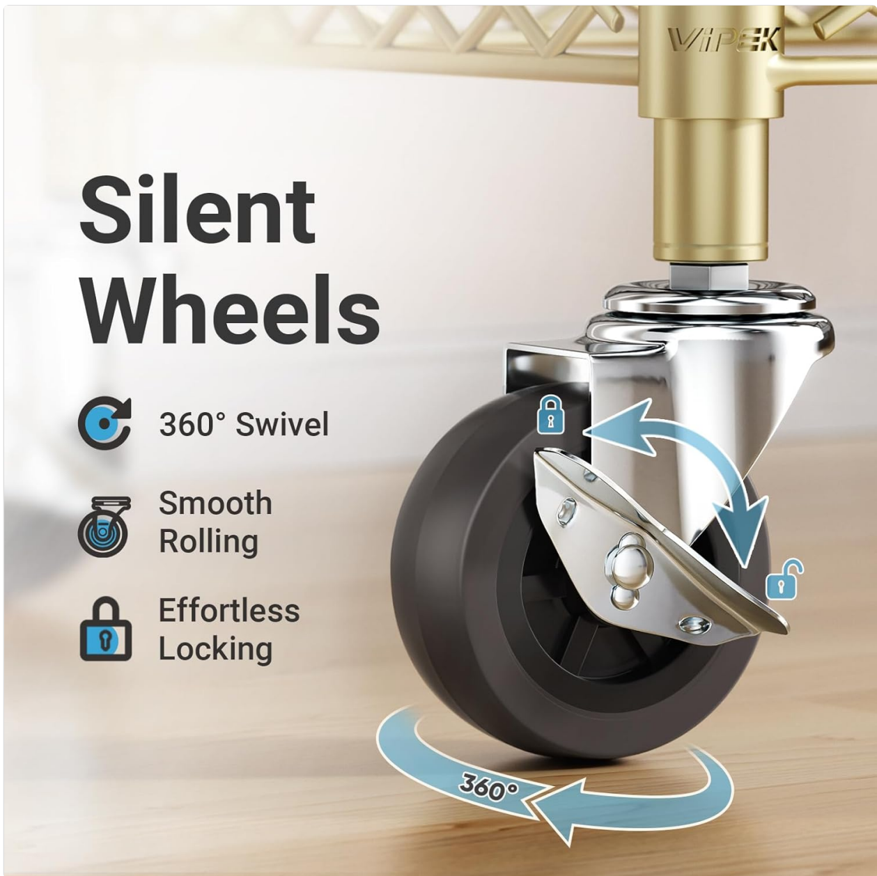
Figure 4.1: Detail of the 360° swivel wheel with its locking mechanism, illustrating its smooth rolling and effortless locking features.