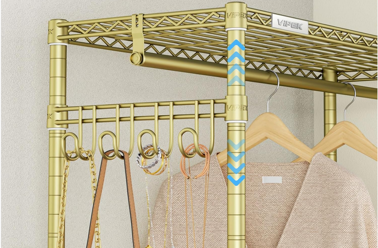
Figure 4.2: Close-up view of the durable side hooks, demonstrating their capacity for hanging various accessories.