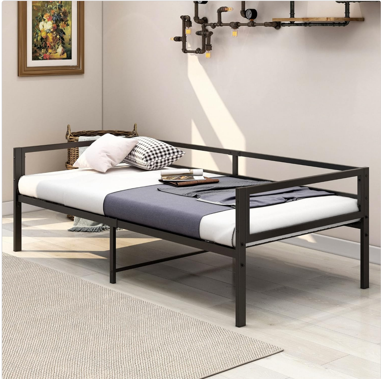
Image: The DUMEE Twin Day Bed Frame with a white mattress and a grey blanket, demonstrating its function as a bed.

Place a standard twin-sized mattress directly onto the metal slat foundation. No box spring is required. The sturdy metal construction provides reliable support for your mattress.