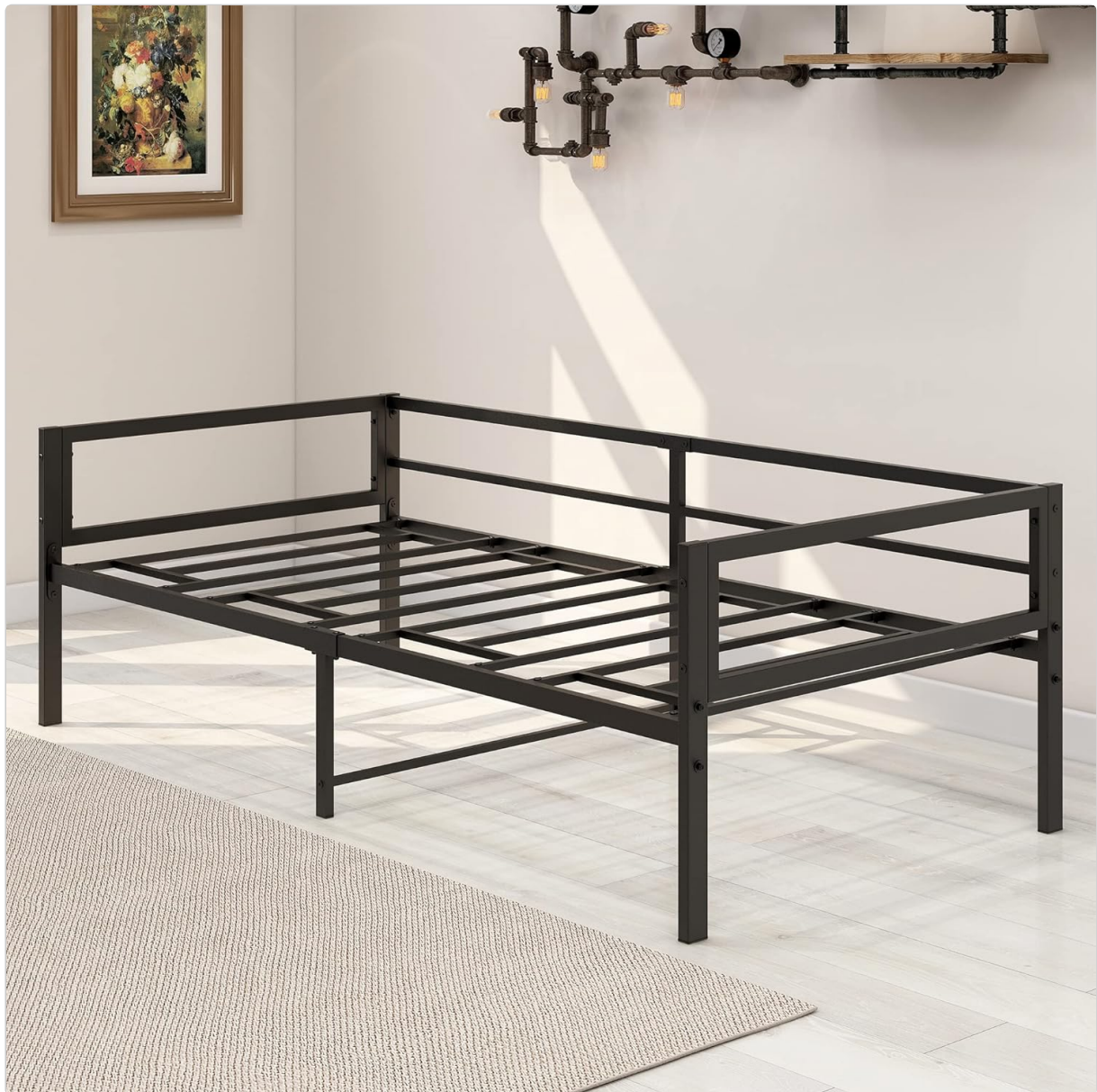
Image: The DUMEE Twin Day Bed Frame shown fully assembled but without a mattress, highlighting its metal construction and slat support system.