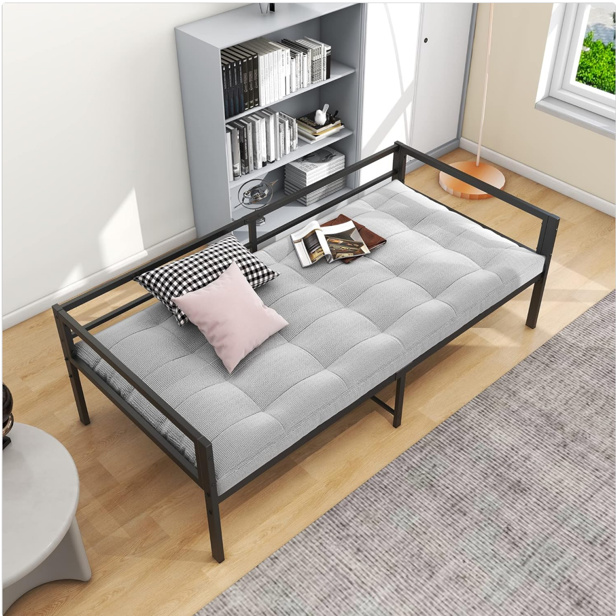
Image: The DUMEE Twin Day Bed Frame, shown with a mattress and decorative pillows, positioned in a room with a rug and shelving unit, illustrating its use as a versatile seating and sleeping solution.