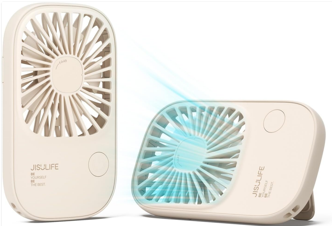
Image 1.1: The JISULIFE Handheld Mini Lash Fan (Model FA49) in beige, demonstrating its compact form factor

Thank you for choosing the JISULIFE Handheld Mini Lash Fan. This compact and portable fan is designed to provide personal cooling with its ultra-slim design, three-speed settings, and rechargeable battery. Please read this manual carefully before use to ensure proper operation and maintenance.