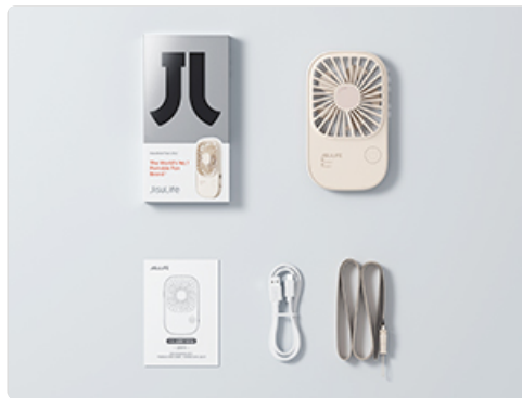
Image 2.1: Illustration of the items included in the product package.