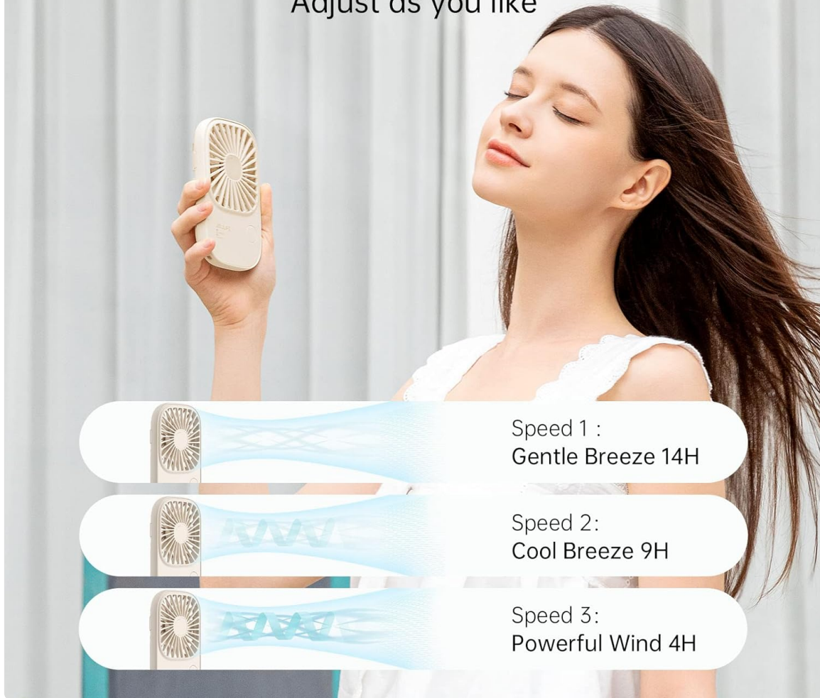
Image 5.1: The fan offers three adjustable wind speeds with varying battery life.