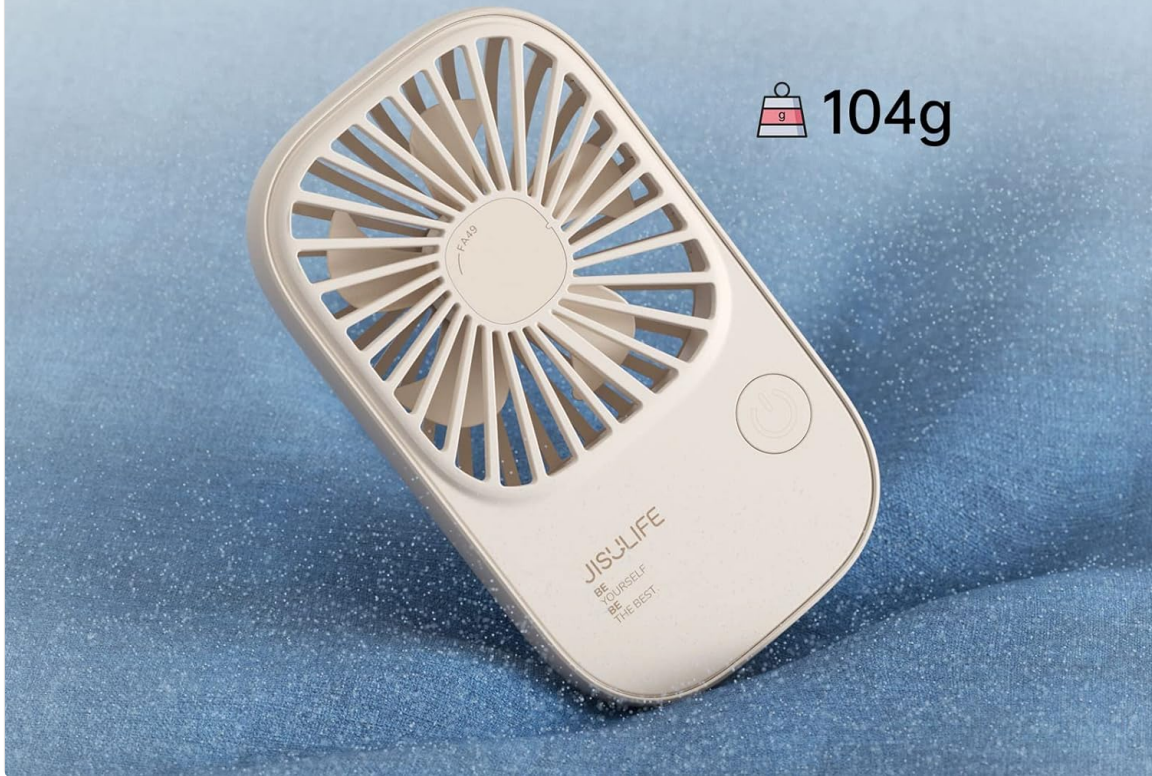
Image 3.2: The fan's ultra-slim and lightweight construction, weighing approximately 104 grams.

The body is made of PC, wear-resistant and durable without odor