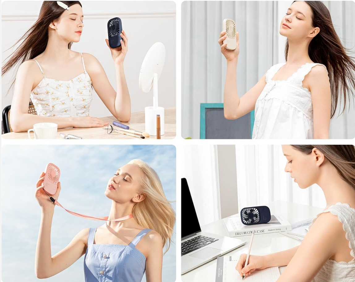
Image 5.3: The fan can be used handheld, on a desktop, or worn around the neck for convenience.