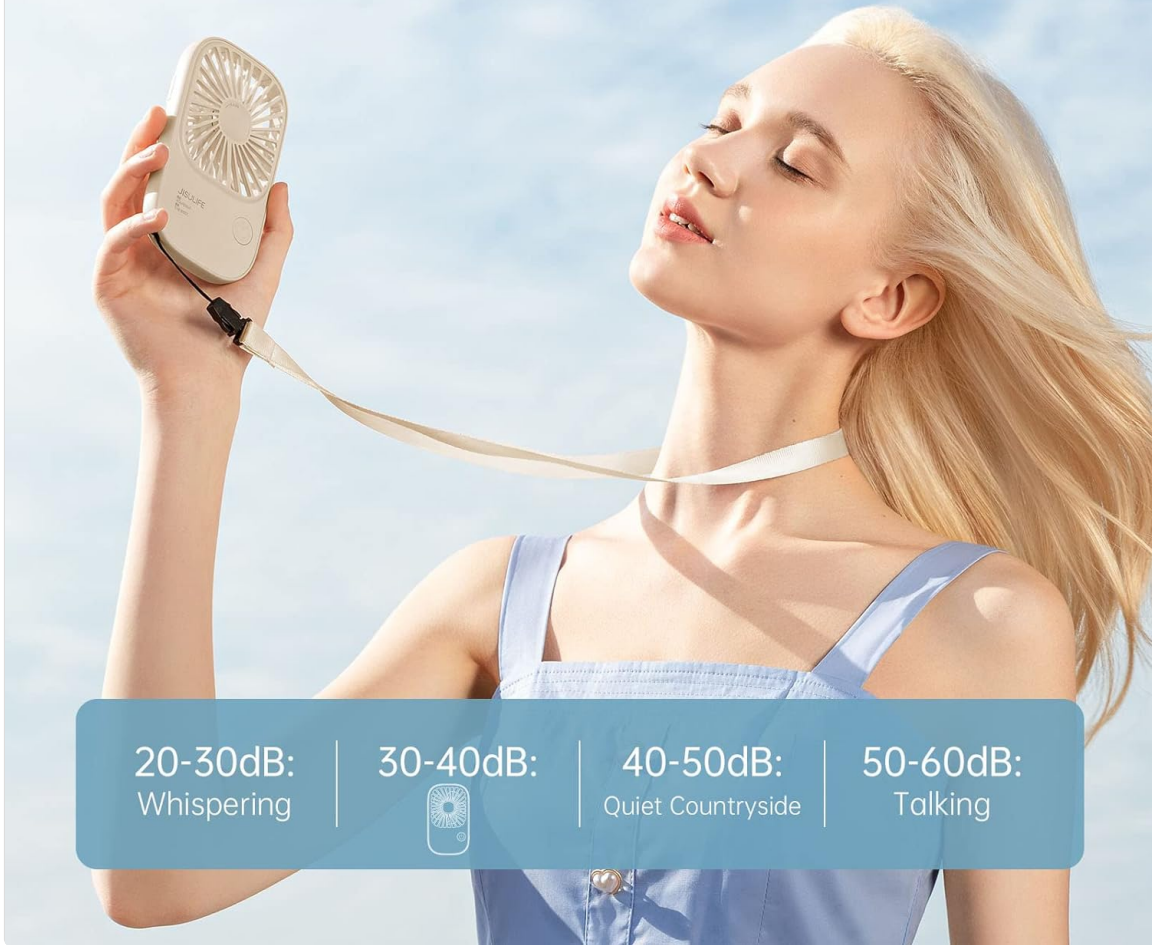
Image 3.3: The fan operates with low noise, comparable to whispering at its lowest setting.