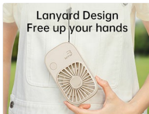
Image 3.4: The lanyard design allows for hands-free use, making it convenient for various activities.