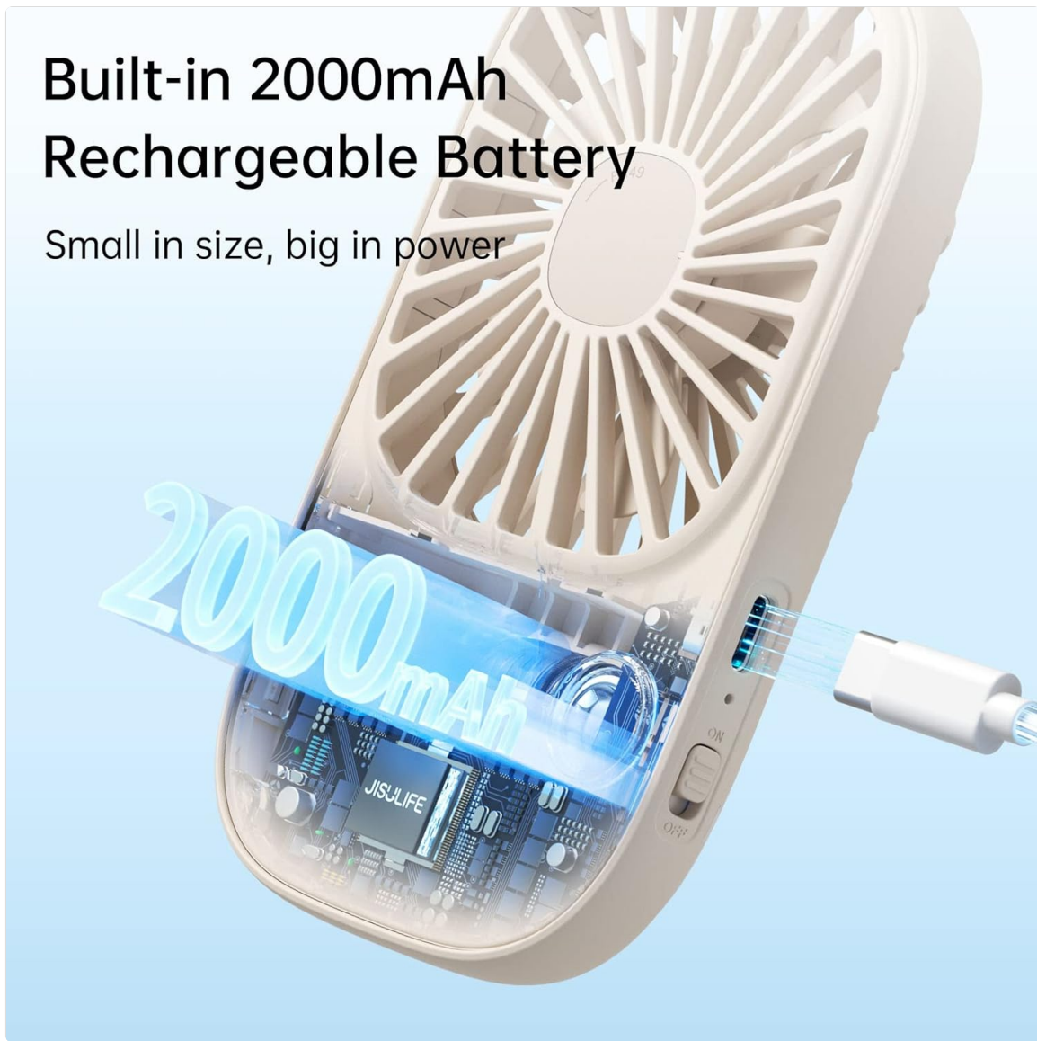
Image 6.1: The fan features a built-in 2000mAh rechargeable battery, charged via Type-C port.