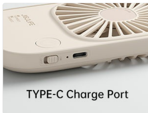
Image 6.2: The Type-C charge port is located on the side of the fan for convenient charging.