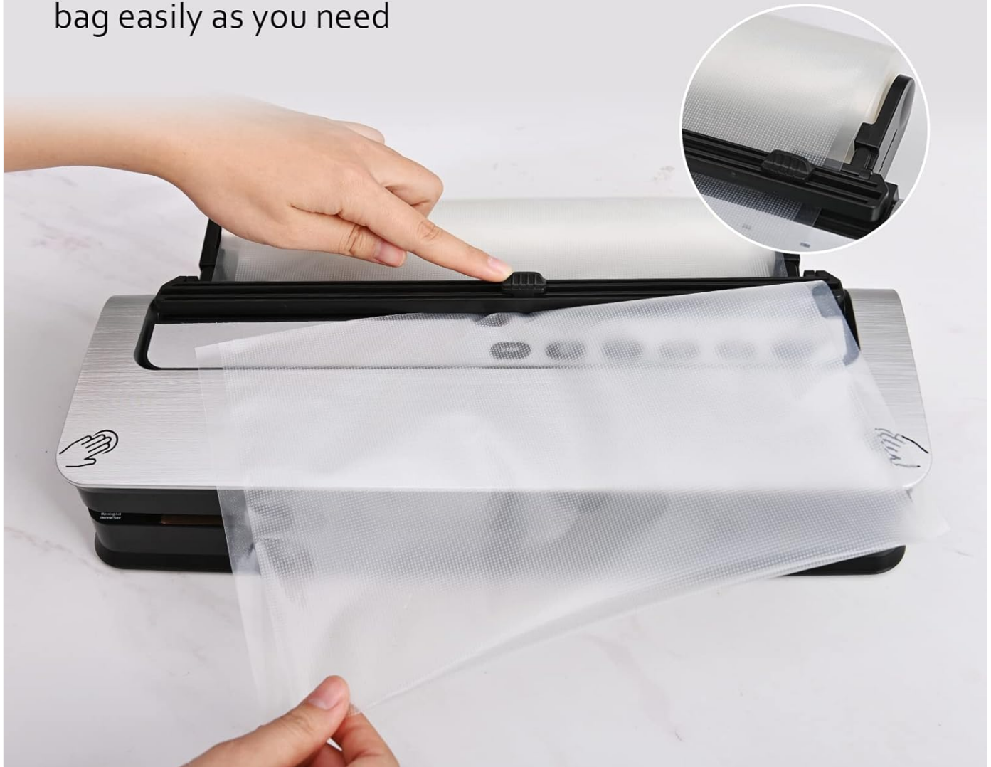
Image: Demonstrates the use of the integrated bag roll rack and sliding cutter for preparing custom-sized vacuum bags.

Storage bag roll and cut a customized bag easily as you need