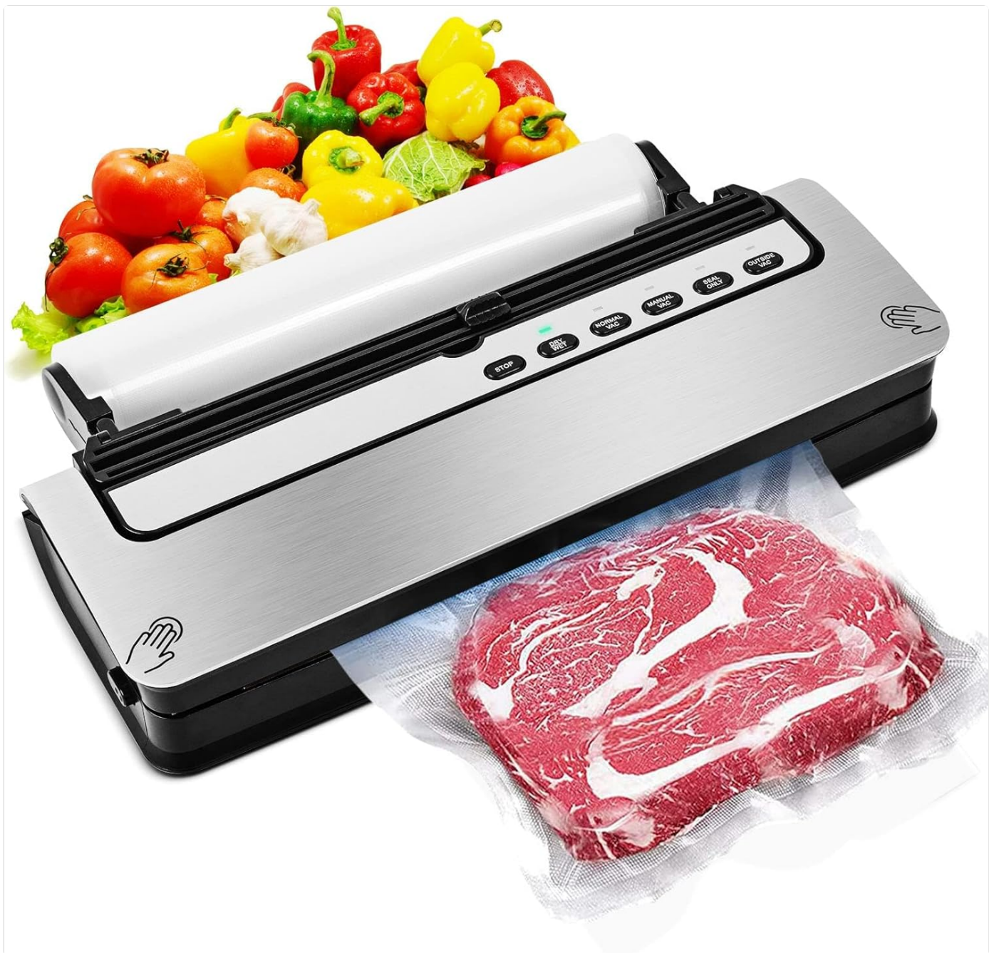
Image: The Danicub Automatic Vacuum Sealer shown with a vacuum-sealed steak and various fresh produce, illustrating its primary function.