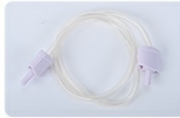
air suction hose