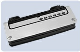
vacuum sealer x1