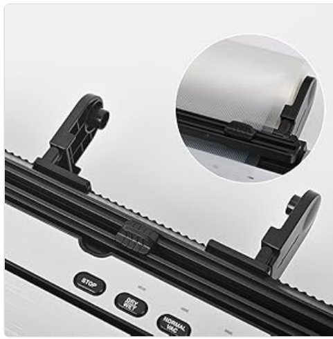
Image: A close-up view of the removable vacuum chamber, highlighting its ease of cleaning.