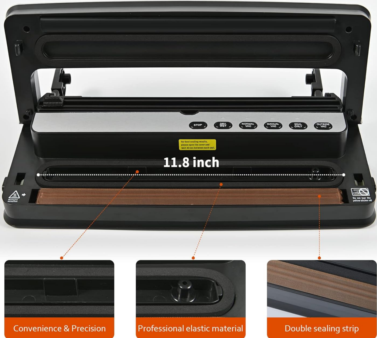
Image: An internal view of the vacuum sealer, emphasizing the 11.8-inch sealing area and the double sealing strip.