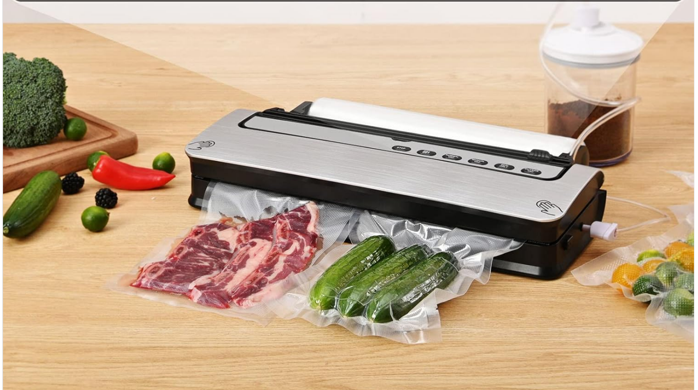
Image: An overview of the six distinct sealing modes available on the Danicub vacuum sealer.