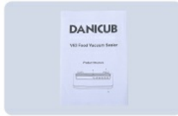
user manual x1