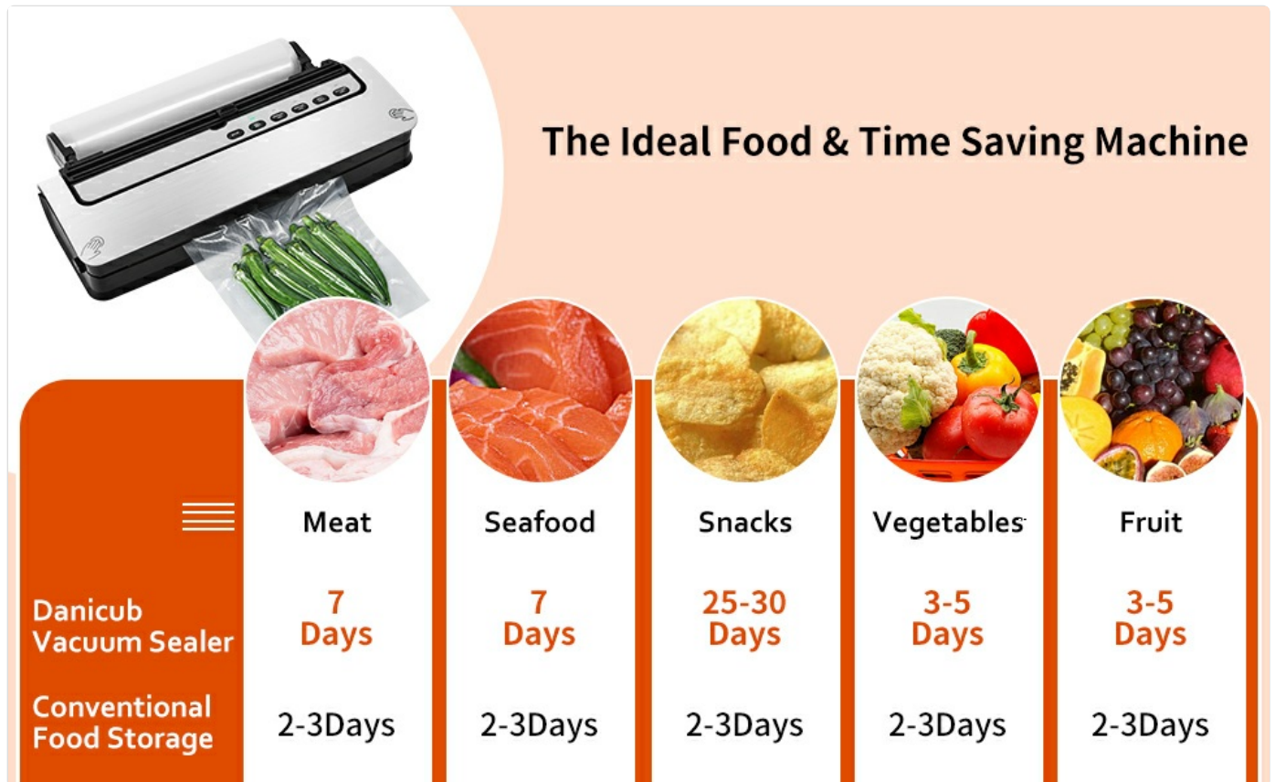
Image: An annotated diagram highlighting the key features and components of the vacuum sealer.