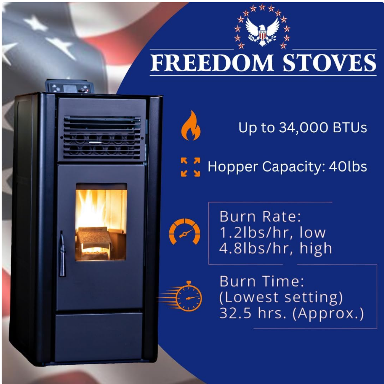
Image 4.1: View of the pellet hopper on top of the Freedom Stove PS21, showing the opening where pellets are loaded.