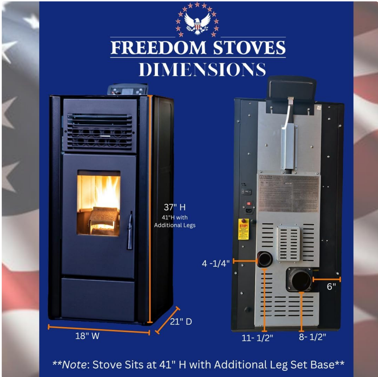
Image 3.2: Diagram illustrating the dimensions of the Freedom Stove PS21, including height, width, and depth, with and without optional legs.