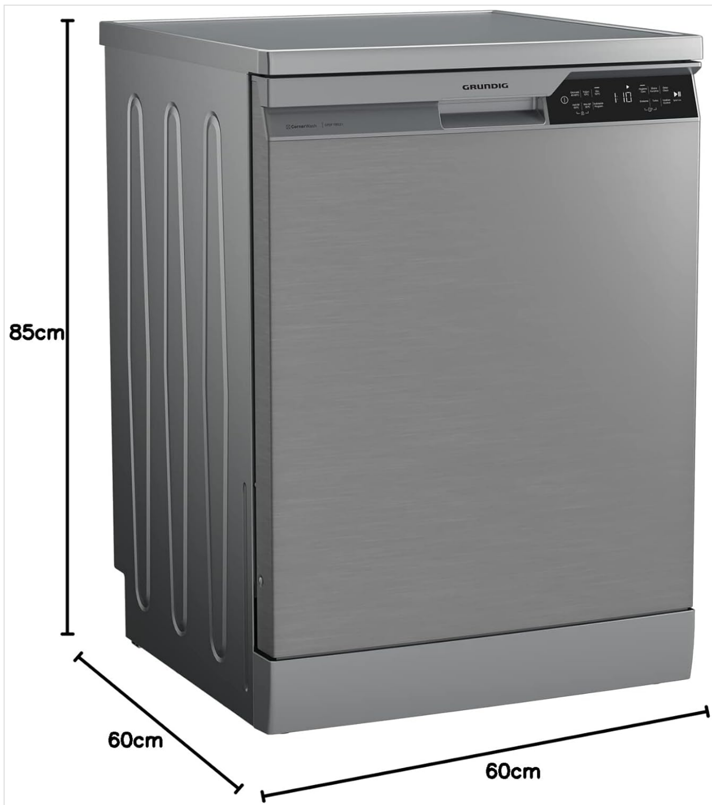
Figure 3.2.1: Dishwasher dimensions. The appliance measures approximately 60 cm in width, 60 cm in depth, and 85 cm in height.