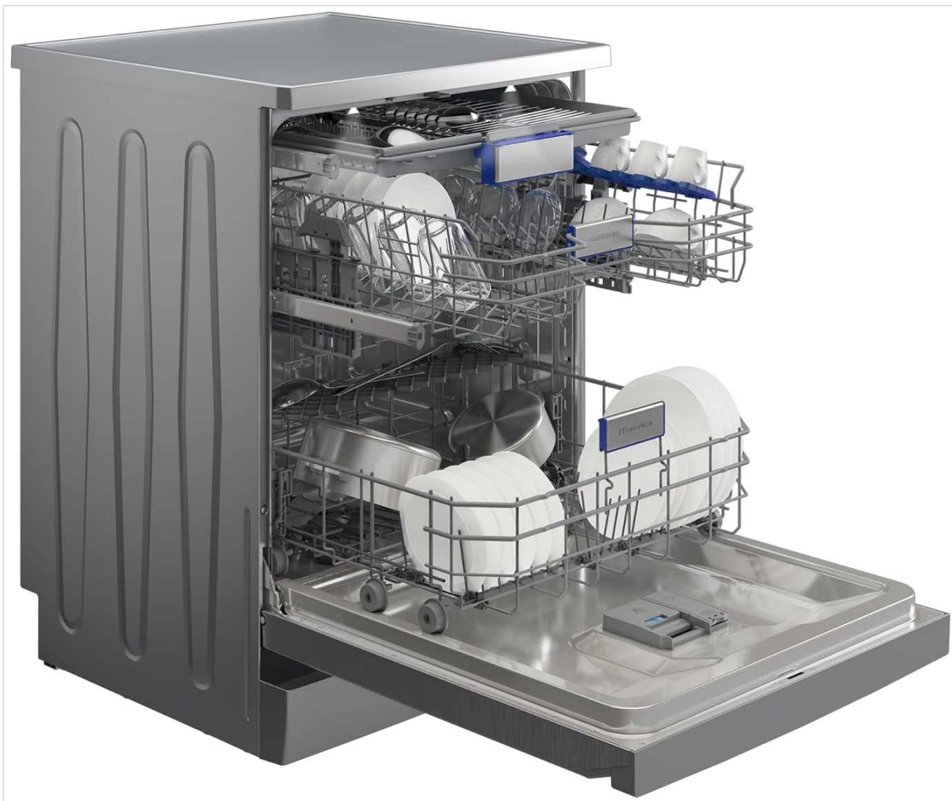
Figure 4.1.2: Side view showing the loaded upper and lower baskets, illustrating how items are arranged for washing.