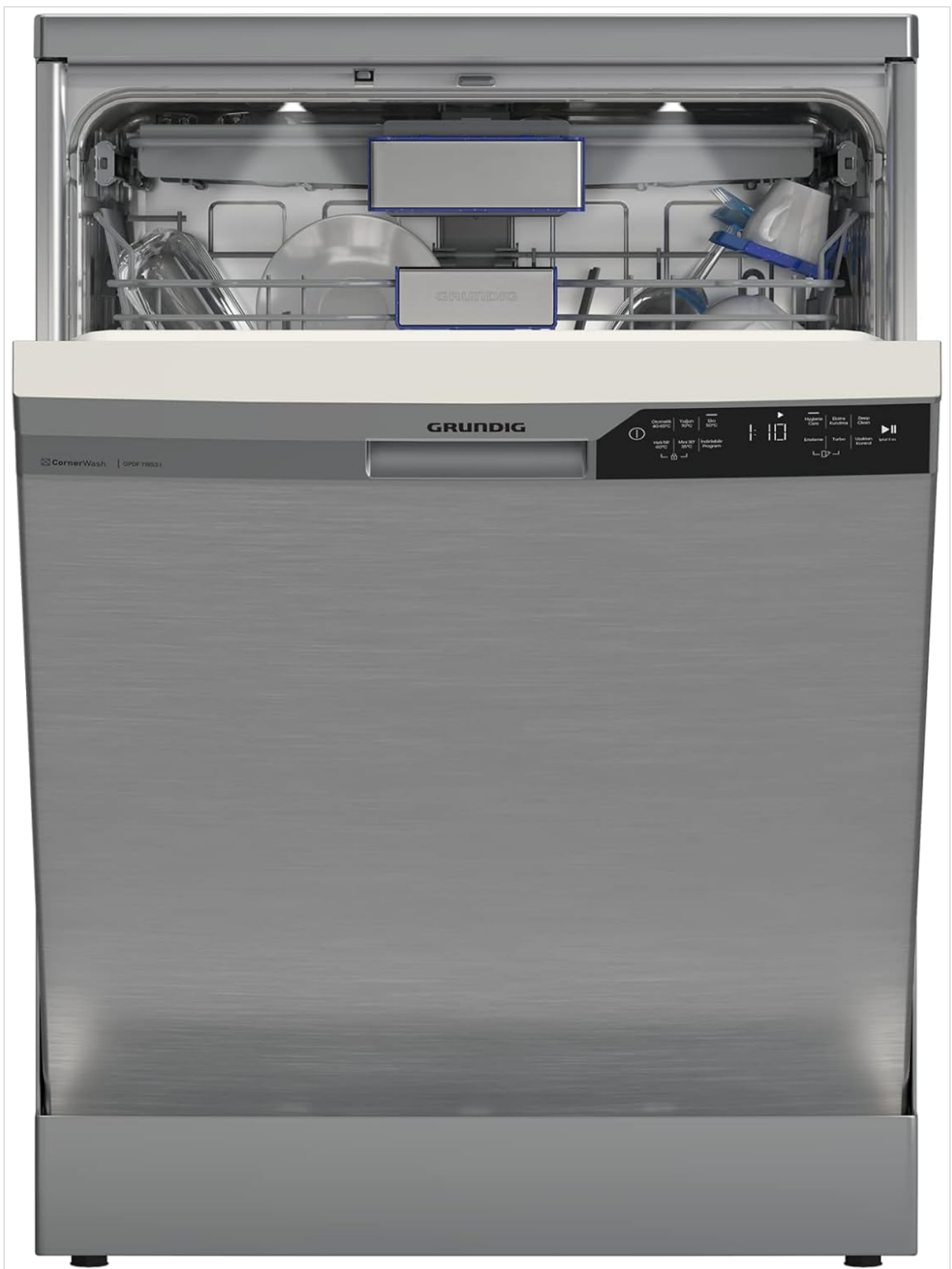
Figure 4.3.1: Front view of the dishwasher, highlighting the control panel with digital display and program selection buttons.