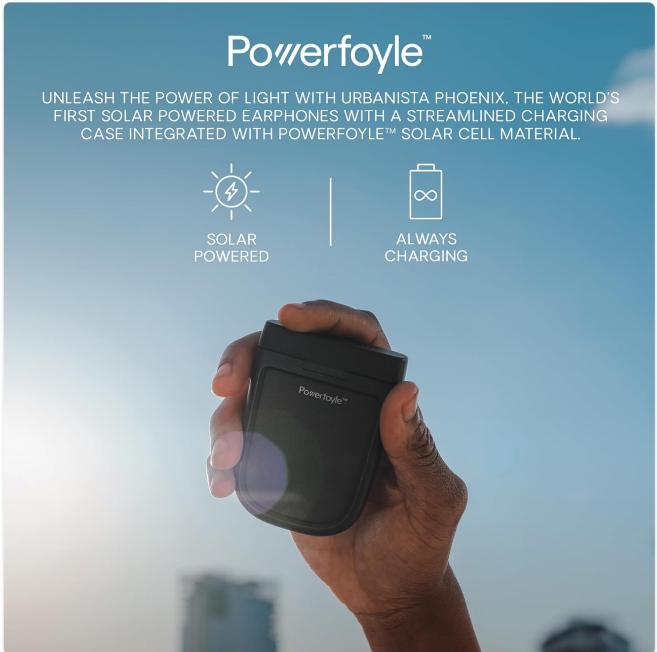
Image: The Urbanista Phoenix charging case highlighting the Powerfoyle solar panel for continuous charging.

The Phoenix charging case features integrated Powerfoyle™ solar cell technology, allowing it to continuously recharge when exposed to any light source, whether natural or artificial. This innovative feature provides an almost endless playtime, ensuring your earbuds are always ready when you are.