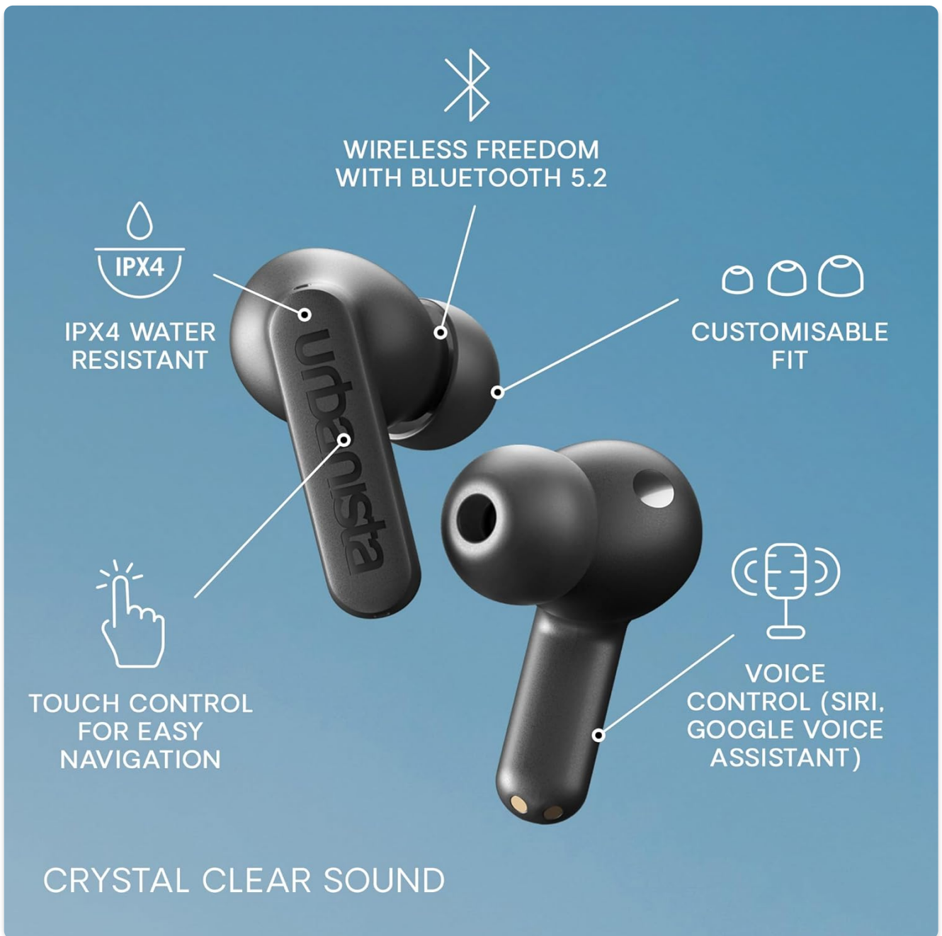
Image: Detailed view of the earbuds pointing out features like Bluetooth 5.2, IPX4 water resistance, touch controls, voice control, and customizable fit.