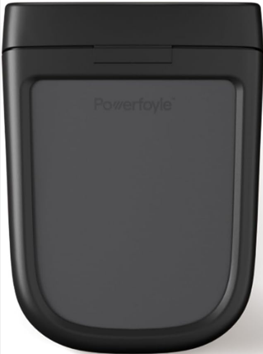
Image: Urbanista Phoenix Earbuds and Charging Case in Midnight Black.