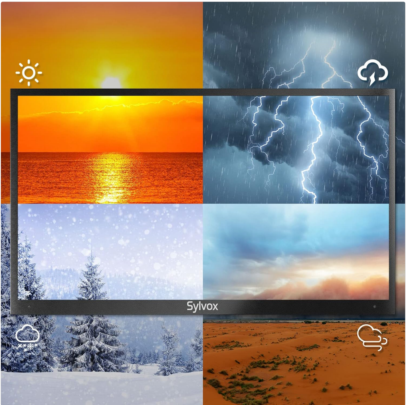
Figure 6.1: TV designed to withstand various weather conditions.

Your browser does not support the video tag. This video demonstrates the waterproof performance of the SYLVOX outdoor TV, showing it functioning normally under simulated heavy rain. It highlights the IP55 rating and the TV's ability to cope with harsh outdoor weather without damage.