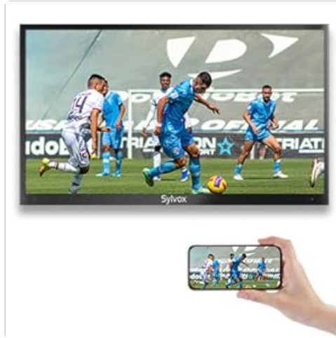
Figure 5.2: Screen casting from a mobile device to the TV.