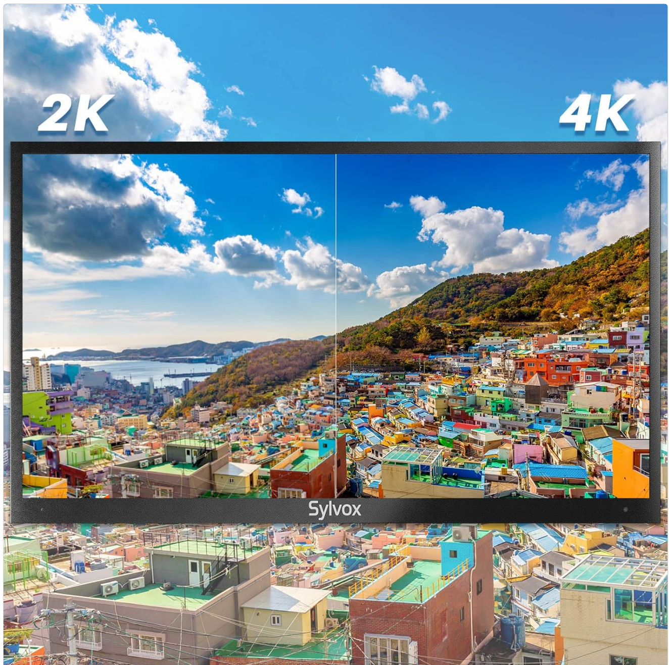
Figure 1.1: SYLVOX 55-inch PoolPro Series Outdoor Smart TV.