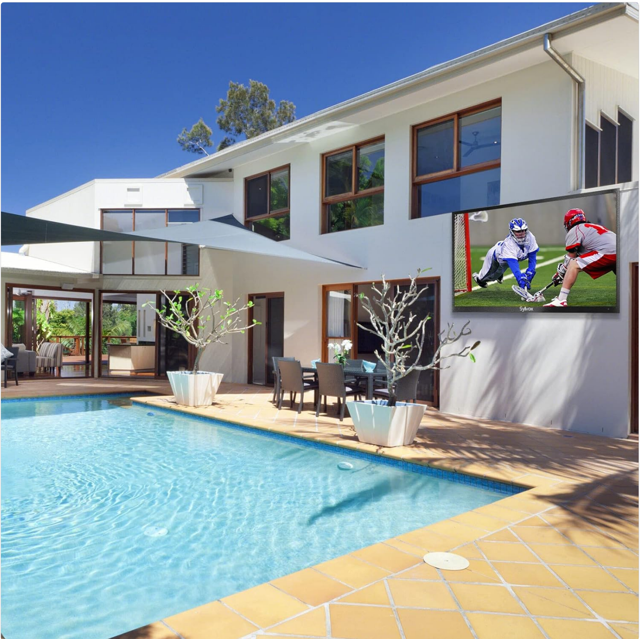
Figure 4.1: Example of outdoor TV installation, ensuring proper clearance.