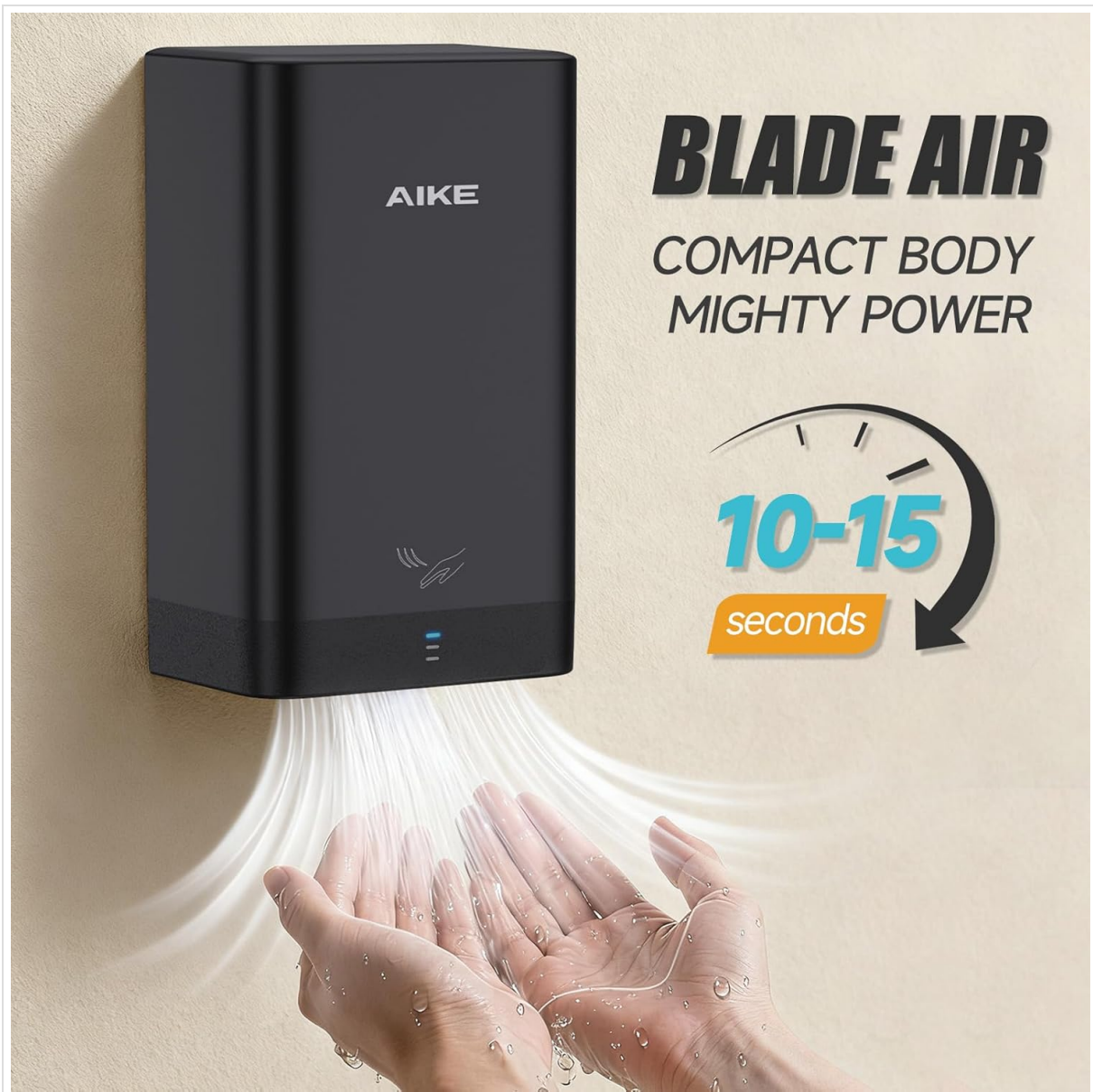
Image: A user demonstrating the proper use of the AIKE AK2822 Hand Dryer in a bathroom environment.