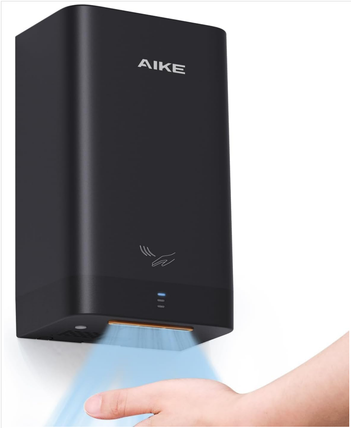
Image: The AIKE AK2822 Hand Dryer actively drying hands with a powerful air stream, indicating a typical drying time of 10-15 seconds.

The AIKE AK2822 hand dryer operates automatically using infrared sensors.