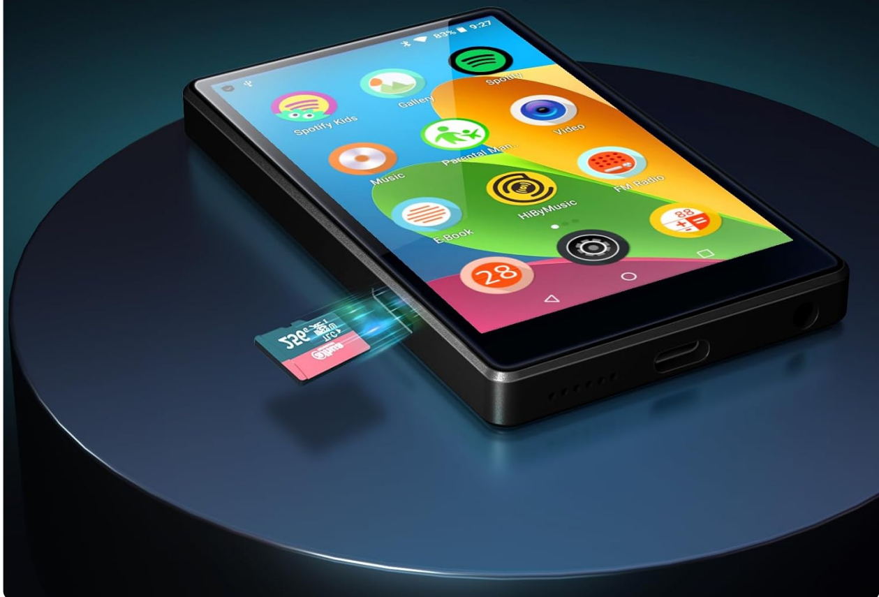
Image: The MP3 player with a Micro SD card being inserted into its dedicated slot.