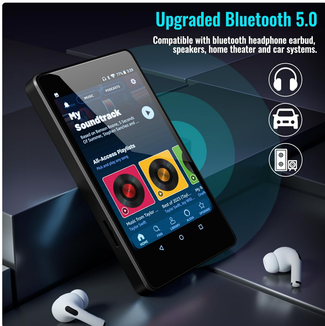
Image: The MP3 player displaying various music playback options and supported formats.

The device supports various music formats including MP3, WAV, FLAC, APE, OGG, M4A, AAC, WMA, MP2. You can organize and play music by Title, Folder, Artist, Album, etc. Use the pre-installed music apps like Spotify, Amazon Music, or HiBy Music.