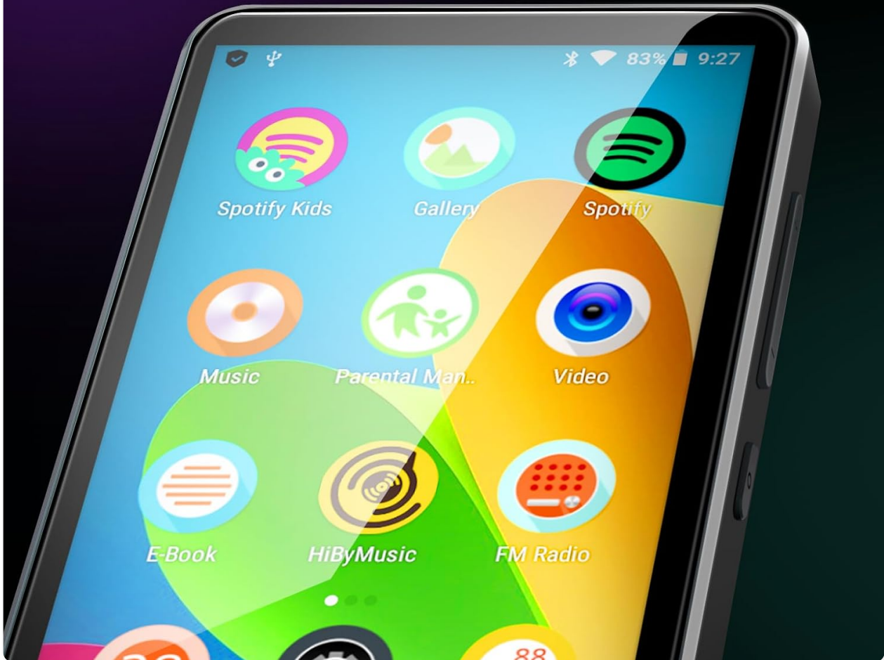
Image: Side view of the MP3 player, highlighting the power and volume buttons.

Block & unblock apps, installation control, set auto ON/OFF timer