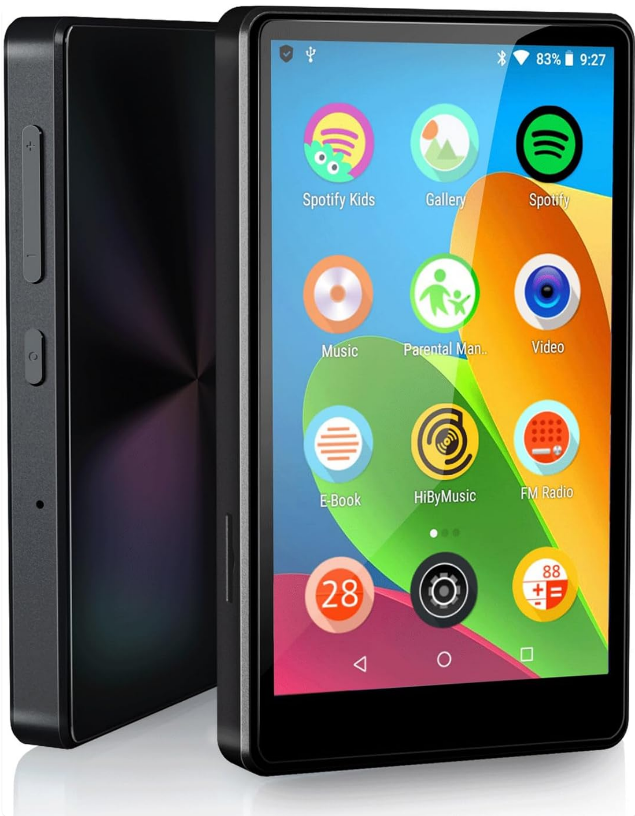
Image: Luoran M4B MP3 Player with included accessories.