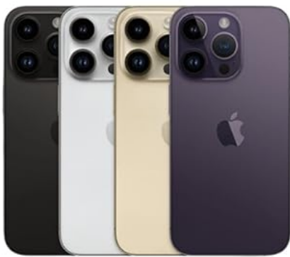
Image: An infographic detailing the iPhone 14 Pro's features, including its 6.1-inch Super Retina XDR display, 48MP Pro Camera System, and 4K video recording capabilities.