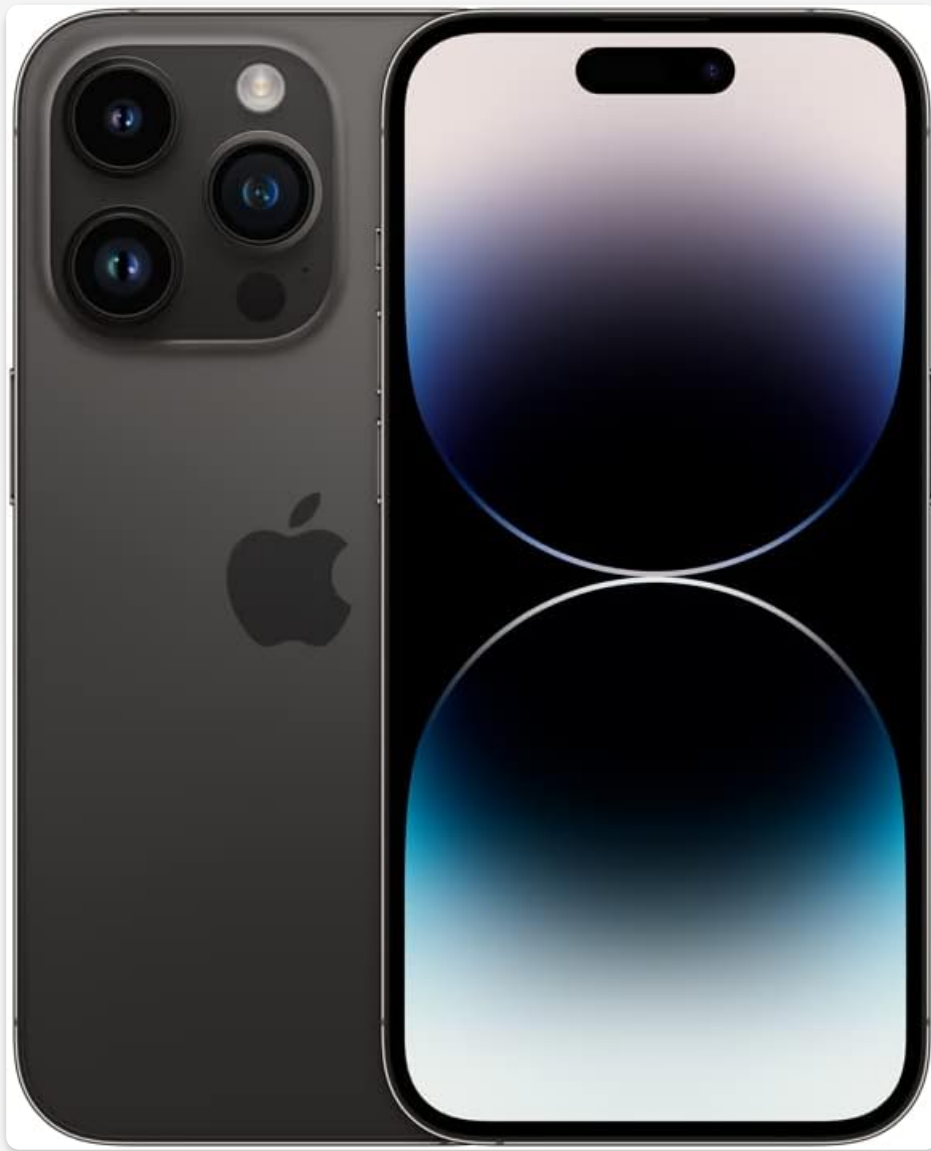
Image: Front and back view of the Apple iPhone 14 Pro in Space Black. The front displays a vibrant screen with the Dynamic Island, while the back showcases the triple camera system and Apple logo.