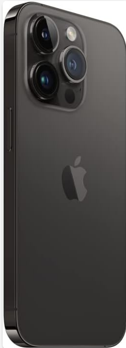
Image: Side view of the Apple iPhone 14 Pro, highlighting the physical buttons (volume up/down, mute switch) and the location of the SIM card tray.

The iPhone 14 Pro supports both physical nano-SIM cards and eSIM. Consult your carrier for activation instructions. If using a physical SIM, insert it into the SIM tray located on the left side of the device using the provided SIM ejector tool (if available, otherwise a paperclip).