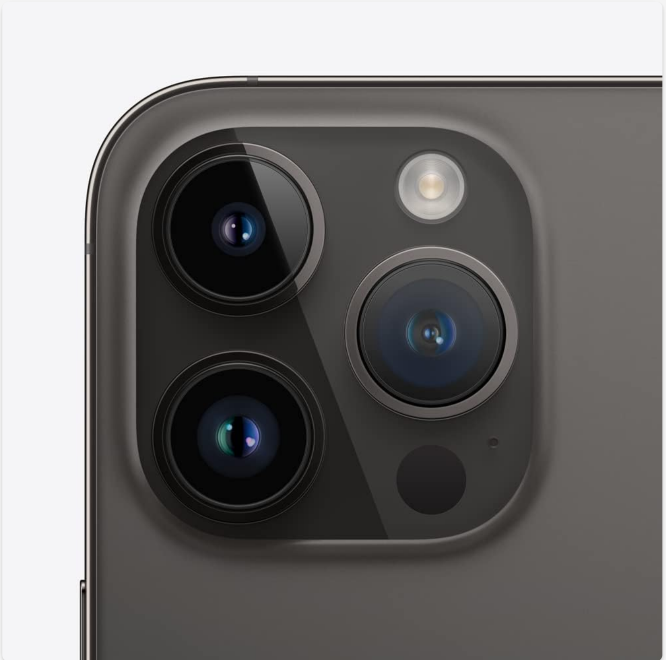
Image: A detailed close-up of the iPhone 14 Pro's advanced triple camera system, featuring three distinct lenses and a flash module.

The iPhone 14 Pro features a versatile Pro camera system. Open the Camera app to access various modes like Photo, Portrait, Cinematic, and Video. Tap the shutter button to capture images or start/stop video recording. Use pinch-to-zoom or the on-screen controls to adjust optical and digital zoom.