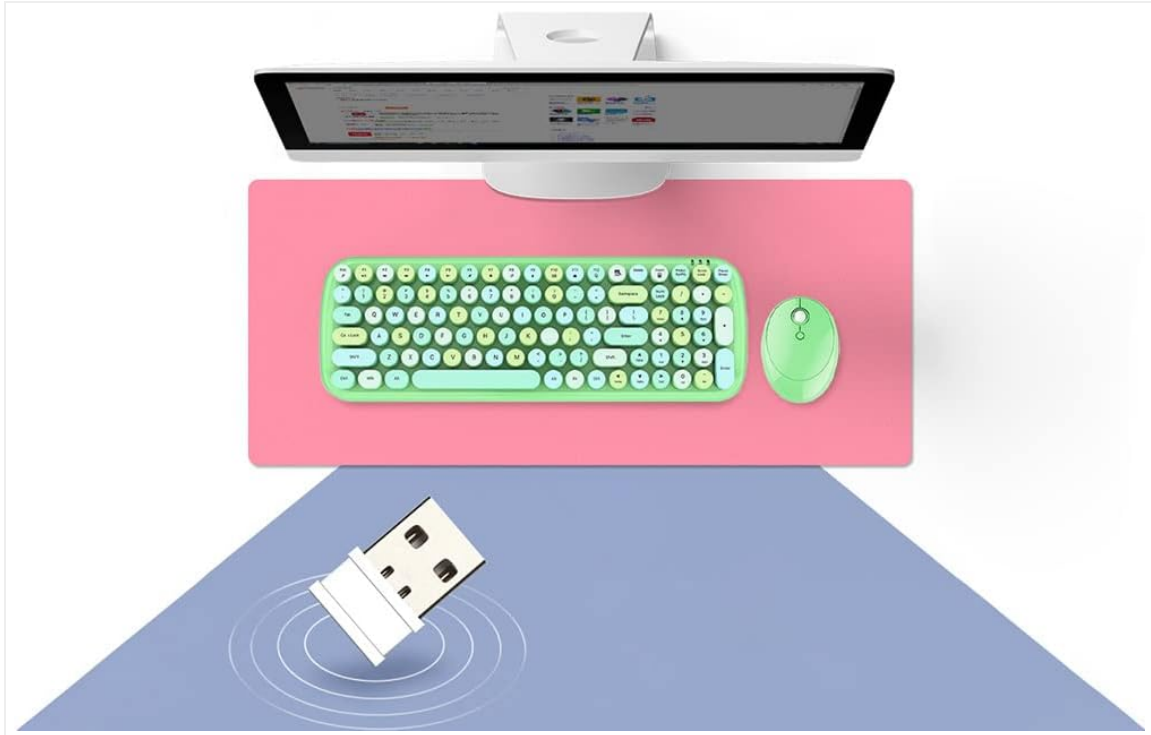
Image: The USB 2.4G receiver, which connects the wireless keyboard and mouse to a computer, shown near a monitor and the green keyboard and mouse set.

Locate the USB 2.4G receiver (often stored in the mouse's battery compartment for transport). Plug the receiver into an available USB port on your computer. Your operating system should automatically detect and install the necessary drivers.