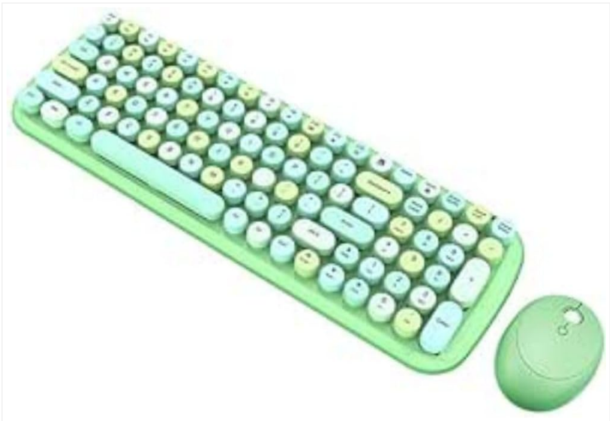
Image: The MOFII Wireless Keyboard and Mouse Set in a vibrant green color, showcasing the round keycaps and compact mouse design.