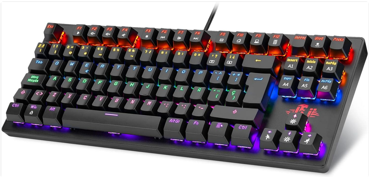
Figure 2.1: Overview of the Rii RK908 Mechanical Gaming Keyboard.