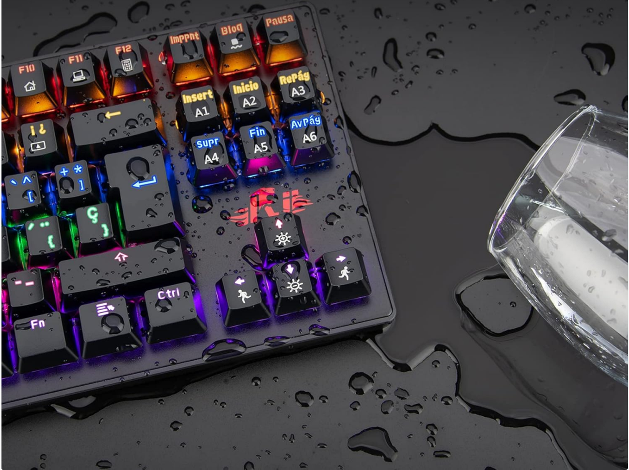
Figure 2.5: The keyboard demonstrating its spill-resistant design with integrated drain holes.

Fearless of accidental spilled water with drain holes