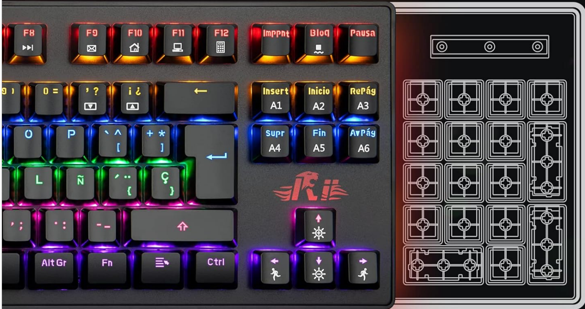
Figure 2.3: Illustration of the compact 88-key tenkeyless design, optimizing desk space.

Compact 87 key space-saving without sacrificing performance, frees up workspace on your desk