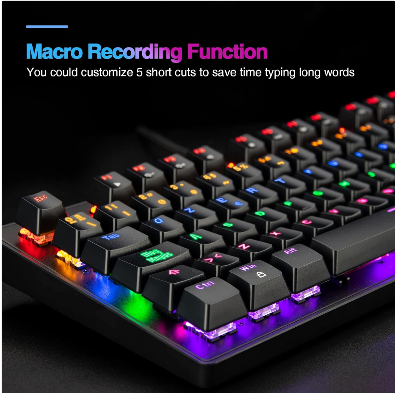
Figure 4.2: Keys involved in the macro recording function, allowing for custom shortcuts.

Note: Macros are stored in the keyboard's memory and will persist even after disconnecting the keyboard.