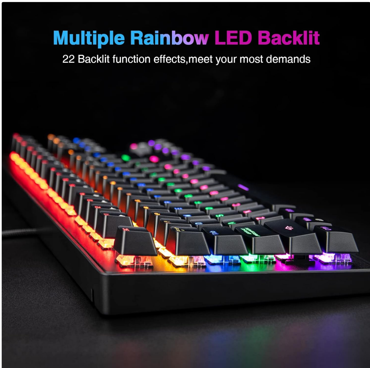
Figure 4.1: The keyboard displaying multiple rainbow LED backlight effects.