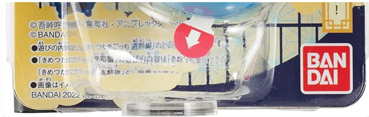
Image: The Tamagotchi Nano x Demon Slayer - Breath of Water Color device shown in its original packaging.