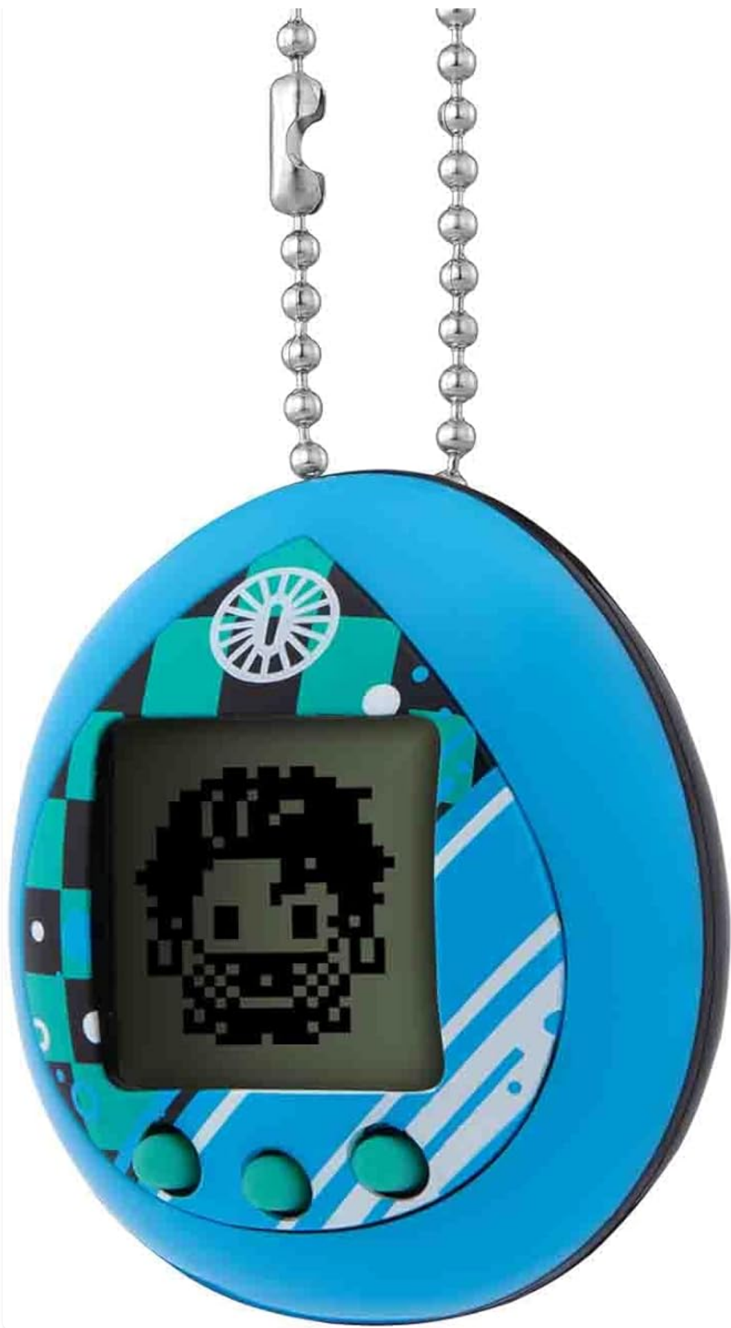
Image: A close-up view of the Tamagotchi Nano device, displaying a pixelated character on its screen.