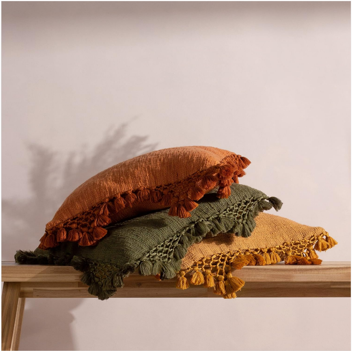
Figure 2.4: Three Yard Anko Tassel Macramé Throw Pillow Covers in Pecan, Olive, and Mustard colors, stacked on a wooden bench, demonstrating size and color variations.