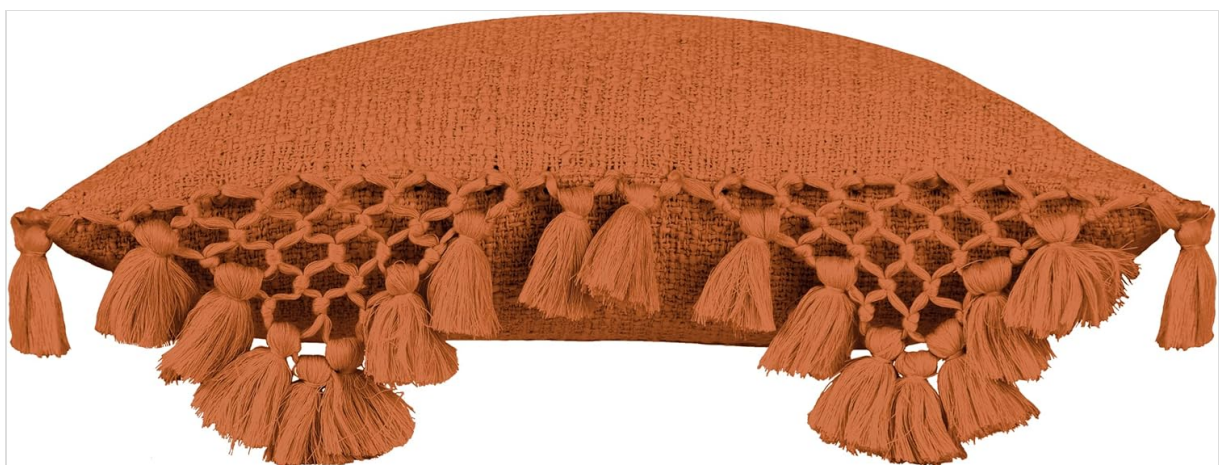
Figure 2.2: Side view of the Pecan colored Yard Anko Tassel Macramé Throw Pillow Cover, highlighting the texture of the fabric and the detailed macramé and tassel fringe.