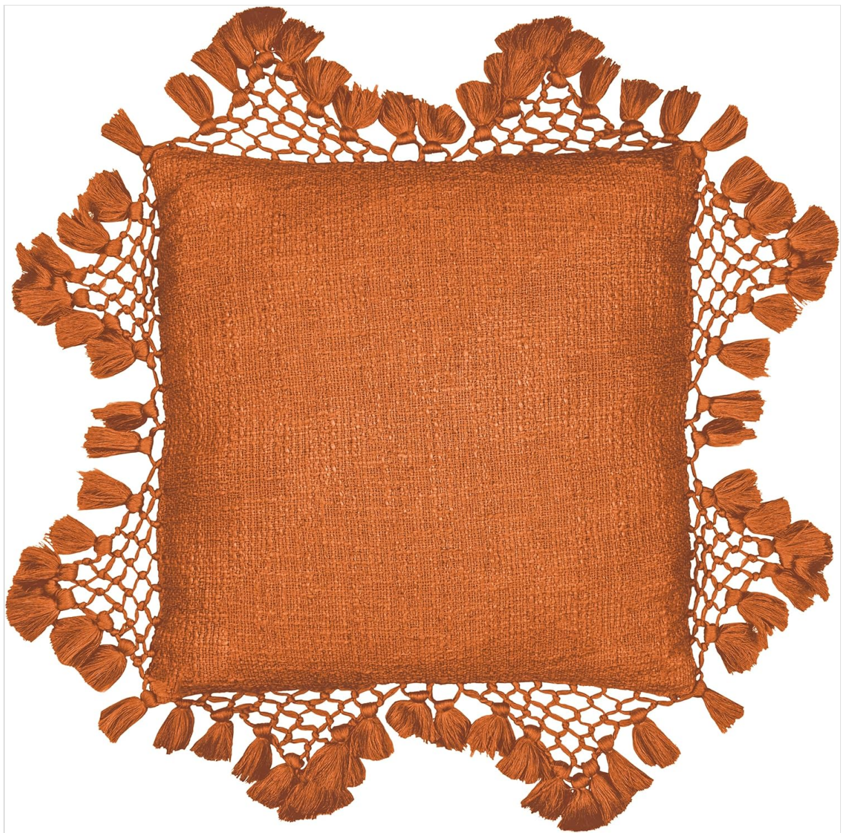
Figure 2.1: Top-down view of the Pecan colored Yard Anko Tassel Macramé Throw Pillow Cover, showcasing its square shape and intricate tassel border.