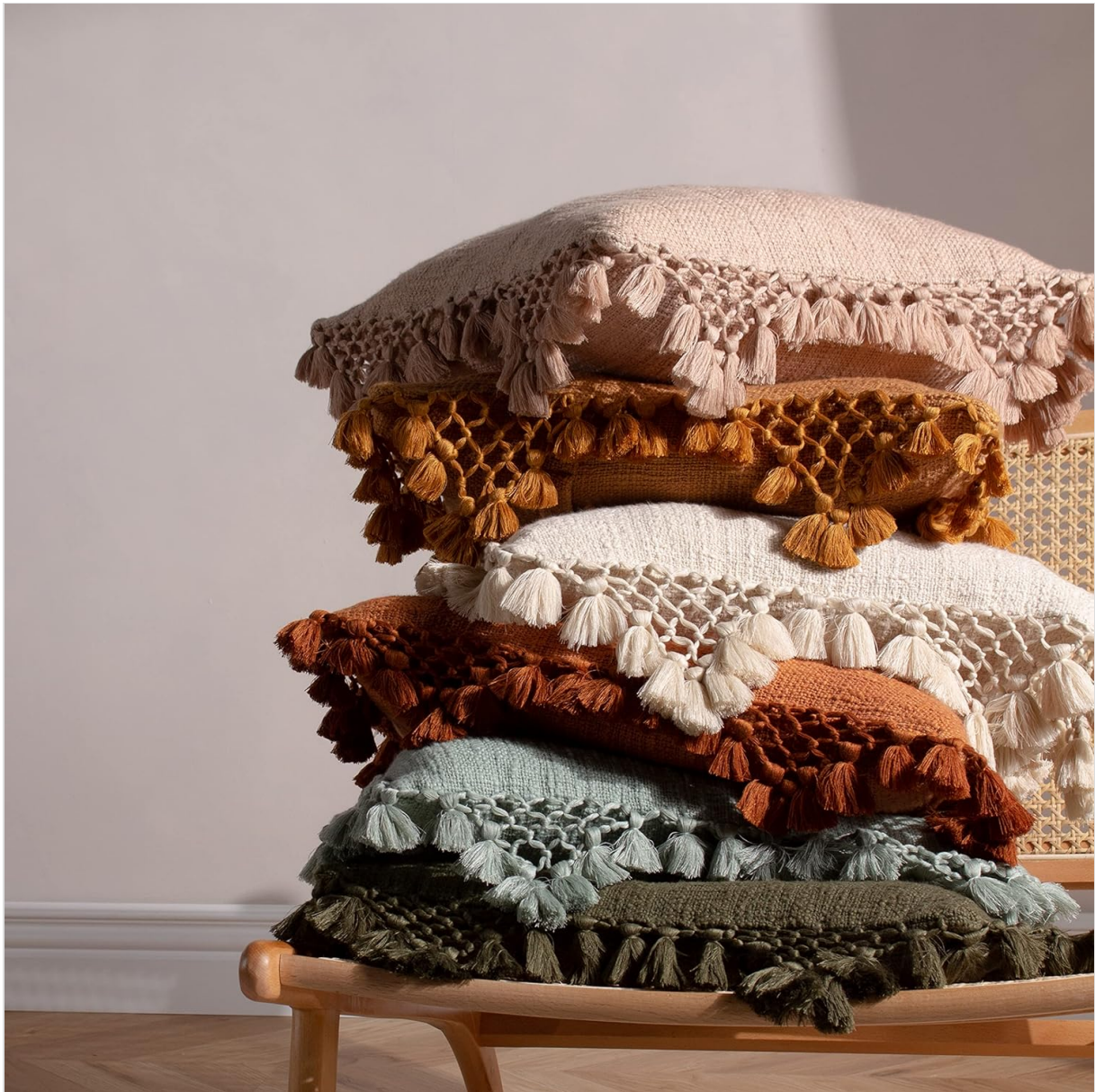
Figure 2.5: A stack of various Yard Anko Tassel Macramé Throw Pillow Covers in different colors and textures, showcasing the range of available designs.