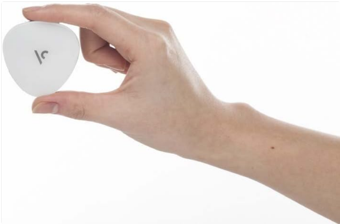
Figure 2.3.2: The Voice Caddy VC300 held in a hand, illustrating its small and ergonomic size for easy portability.