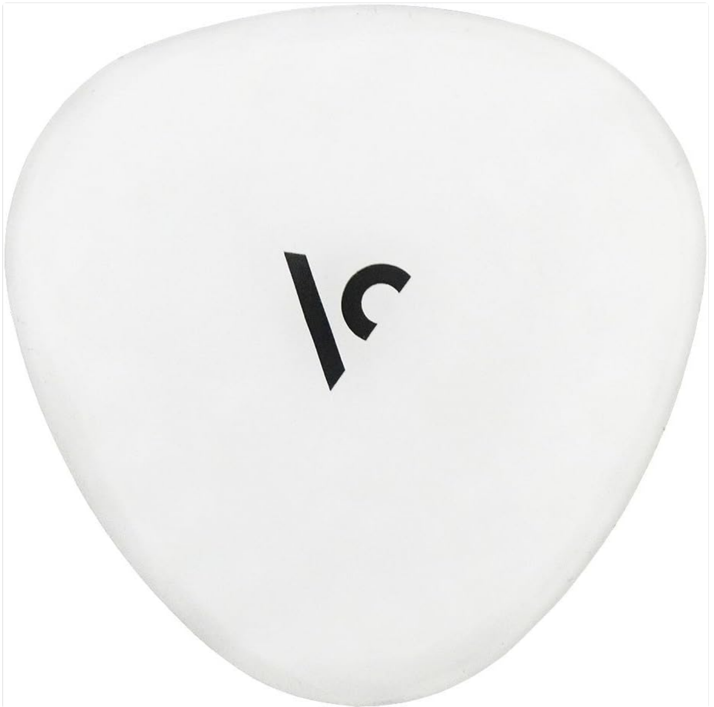
Figure 2.3.1: Front view of the Voice Caddie VC300, showcasing its compact, white, heart-shaped design with the Voice Caddie logo.