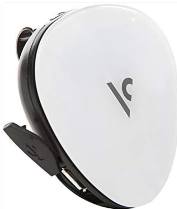
Figure 2.3.4: Side view of the Voice Caddie VC300, highlighting the USB charging port for convenient power replenishment.