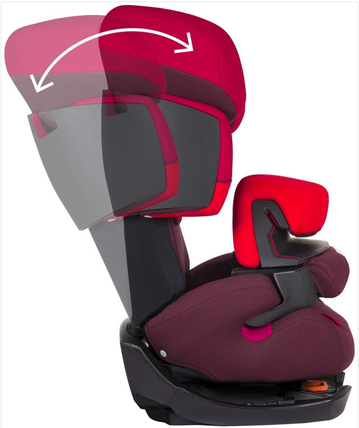
Image: Illustration of the 11-position height-adjustable headrest, indicating the upward and downward movement for proper fit.