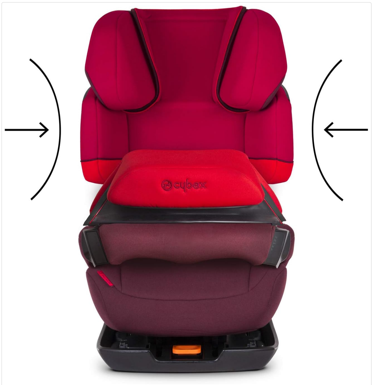
Image: The car seat with arrows indicating the extension of the Linear Side-Impact Protection (L.S.P.) system on both sides.