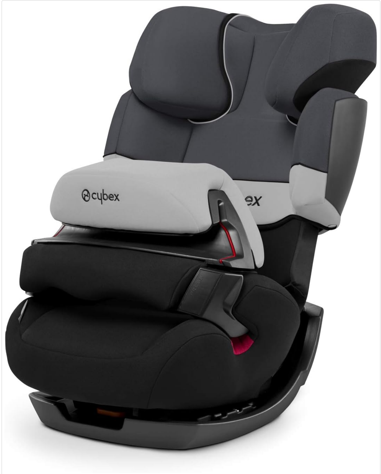
Image: The CYBEX Silver Pallas 2-in-1 Car Seat, showcasing its design and components, including the adjustable impact shield and headrest.

The CYBEX Silver Pallas is a versatile 2-in-1 car seat designed to grow with your child. It features an adjustable safety cushion for Group 1 (9-18 kg) and converts into a high-back booster seat (Solution X) for Group 2/3 (15-36 kg).