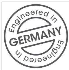
Image: The "Engineered in Germany" logo, signifying the product's origin and quality standards.

© 2024 Cybex. All rights reserved. Information in this manual is subject to change without notice.