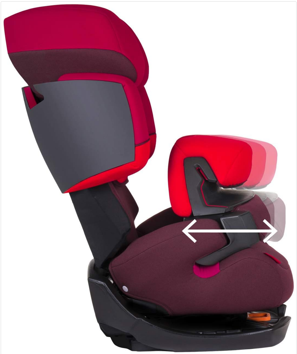
Image: This image illustrates the adjustable depth of the impact shield, showing how it can be moved to fit the child's size.