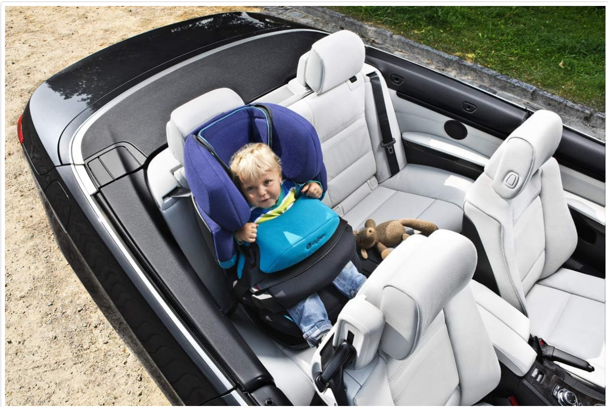
Image: A child seated in the CYBEX Pallas car seat, demonstrating the use of the impact shield for Group 1 children.