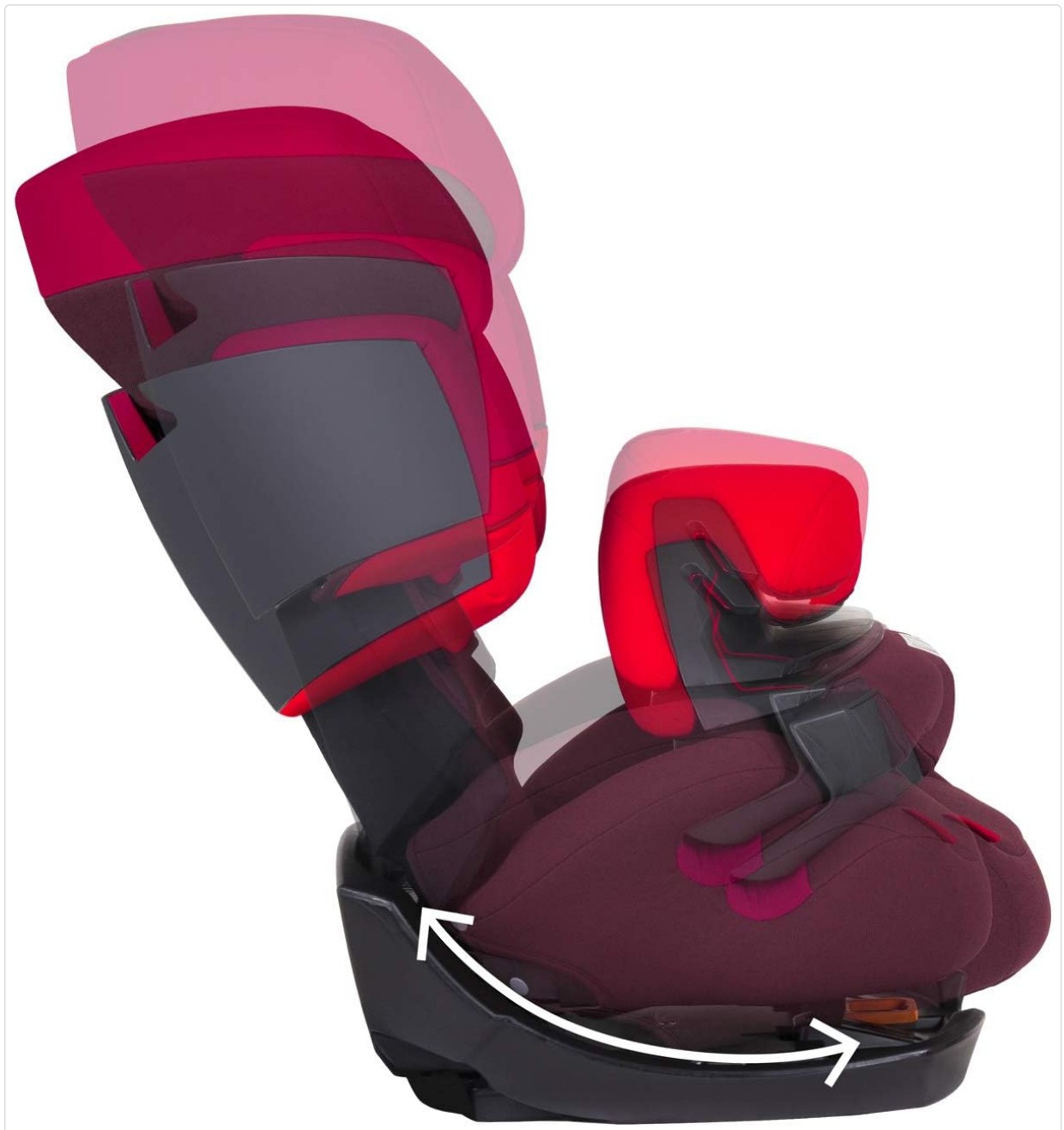
Image: The car seat demonstrating its recline function, showing the seat tilting backward for a more comfortable resting position.