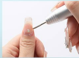
Needle Bit Polish the nail edges