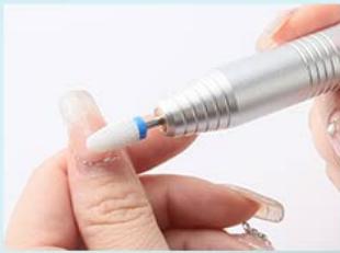
Ceramic Drill Bit Remove nail polish and acrylic nails