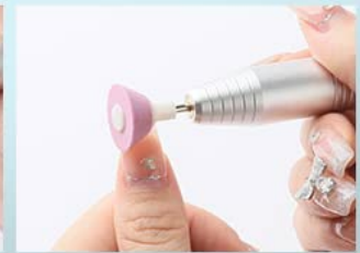
Coarse Disc Bit Grind nails and exfoliate