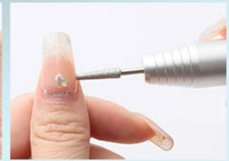
Tapered Bit Polish the nail head to be smooth and flat