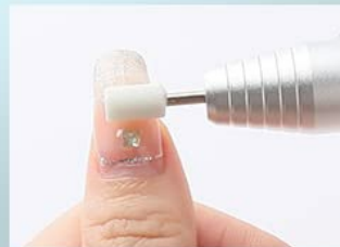
Barrel Bit Smooth and polish surface