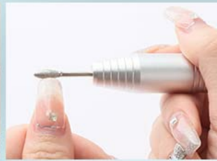
Bullet Bit Nail surface carving and edge grinding