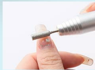
Big Cylinder Bit Grinding surface to make it smoother