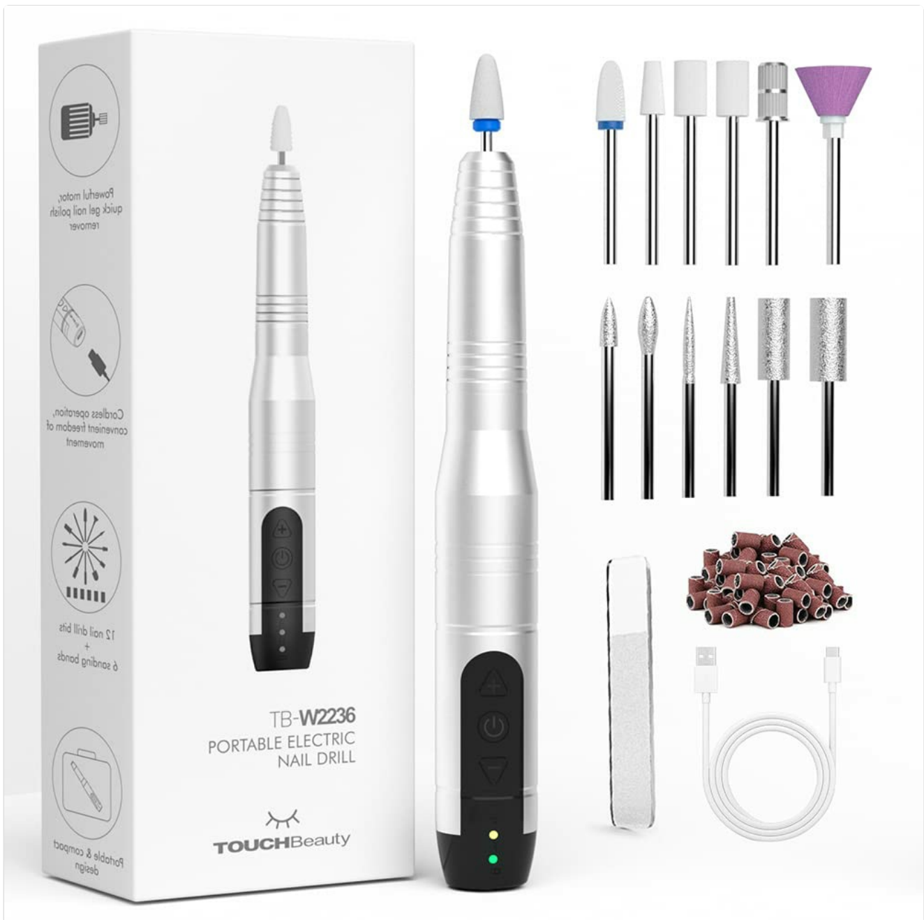
Figure 1: TOUCHBeauty Electric Nail Drill with included accessories.