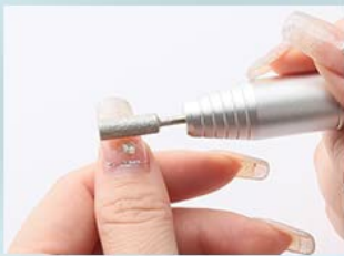
Small Cylinder Bit Grinding surface to remove callus