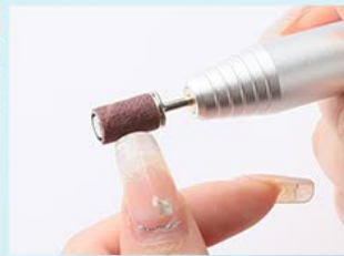
Sandpaper Bit Use with sanding bands to polish hard and rough nails