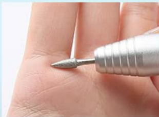
Cone Bit Remove cuticles