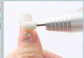
Felted Wool Bit Polish and clean nail surface debris