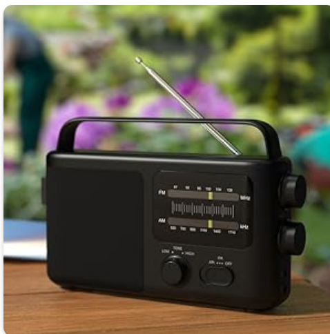
Image: The i-box Tone radio positioned outdoors with its telescopic antenna fully extended.