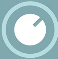
Analogue Dial with Rotary Tuner