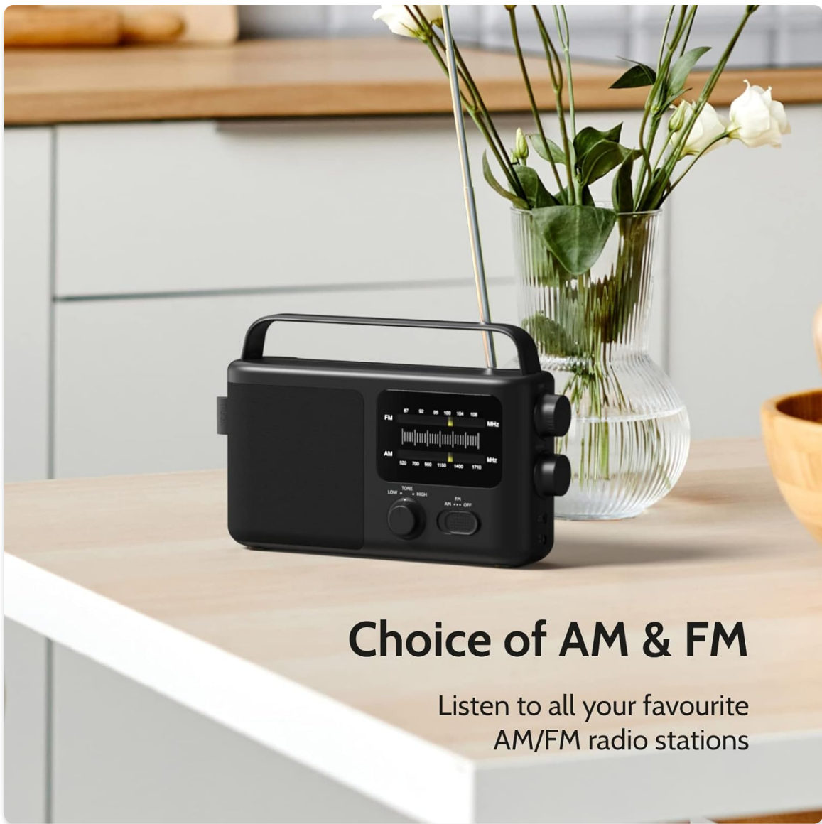
Image: The i-box Tone radio on a kitchen counter, highlighting its AM and FM tuning capabilities.