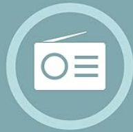
AM & FM Radio Tuner