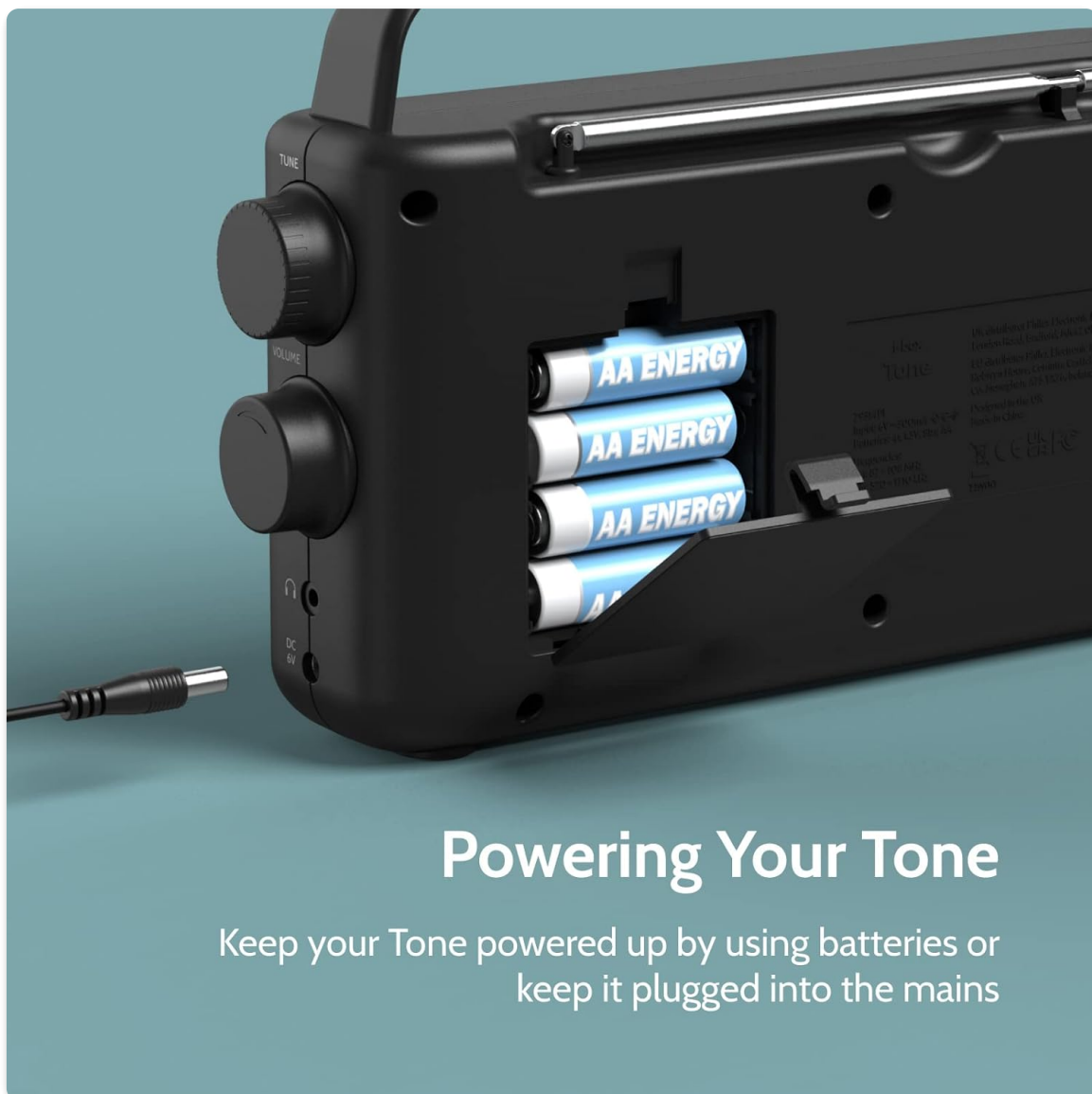
Image: Rear view of the i-box Tone radio with the battery compartment open, showing four AA batteries inserted.