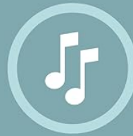
Low/High Tone Switch