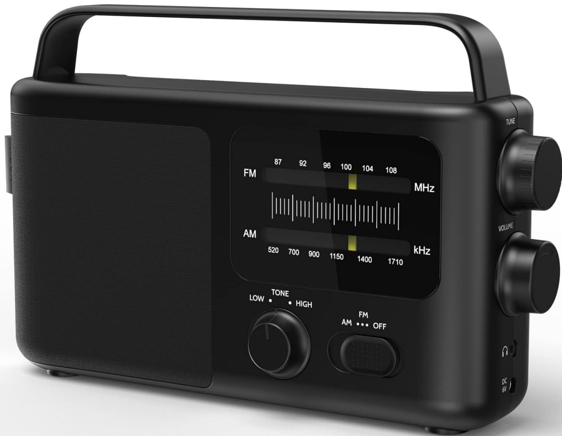
Image: Front view of the i-box Tone Portable AM/FM Radio, showcasing its black finish, analogue tuning dial, and controls.