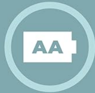
Battery Powered for Portability