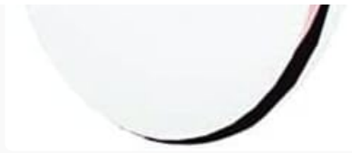
Image 1: Front view of the Beautify BLooky PRO Sonic Eye Massager, showing the massage head, display, and control buttons.

The BLooky PRO features an ergonomic design for comfortable handling and precise application. Key components include: