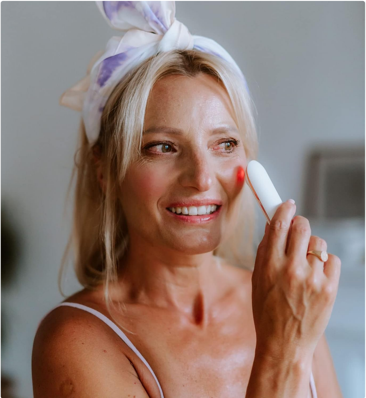
Image 3: A user applying the BLooky PRO to the cheek area, demonstrating broader application.

For optimal results, apply a thin layer of eye cream or serum to the desired treatment area before use. Gently glide the massage head over the skin around your eyes, moving in small, circular motions or upward strokes. Avoid direct contact with the eyeball. Recommended usage is 5-10 minutes per session, 2-3 times per week.