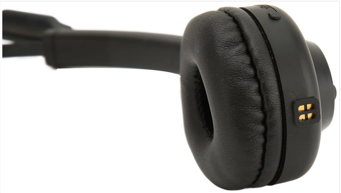
Image: A detailed view of the headset's padded ear cushion and the charging contacts.