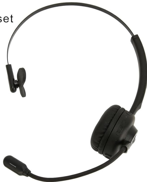
Image: The headset illustrating its rotatable microphone, comfortable design, and Bluetooth 5.0 capabilities for stable transmission.

Faster, more efficient and more stable transmission