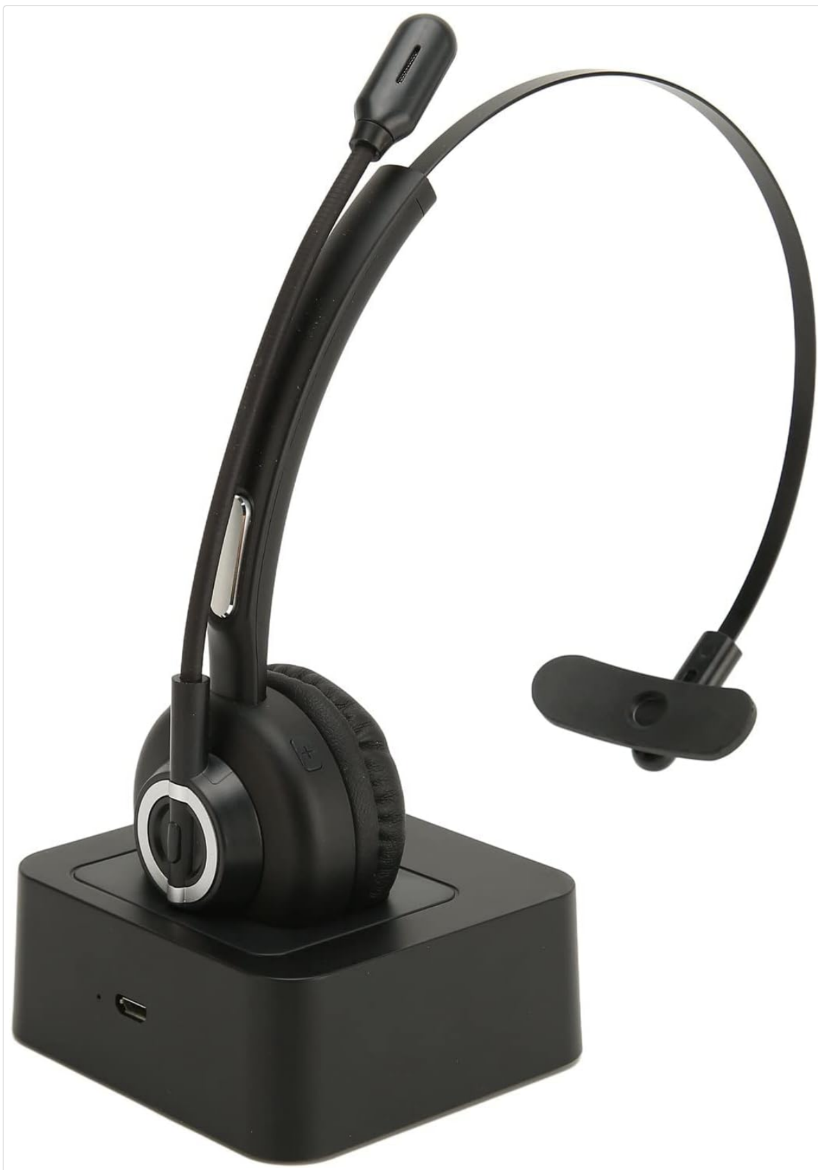
Image: The Jectse BH M97 headset securely placed on its charging base.