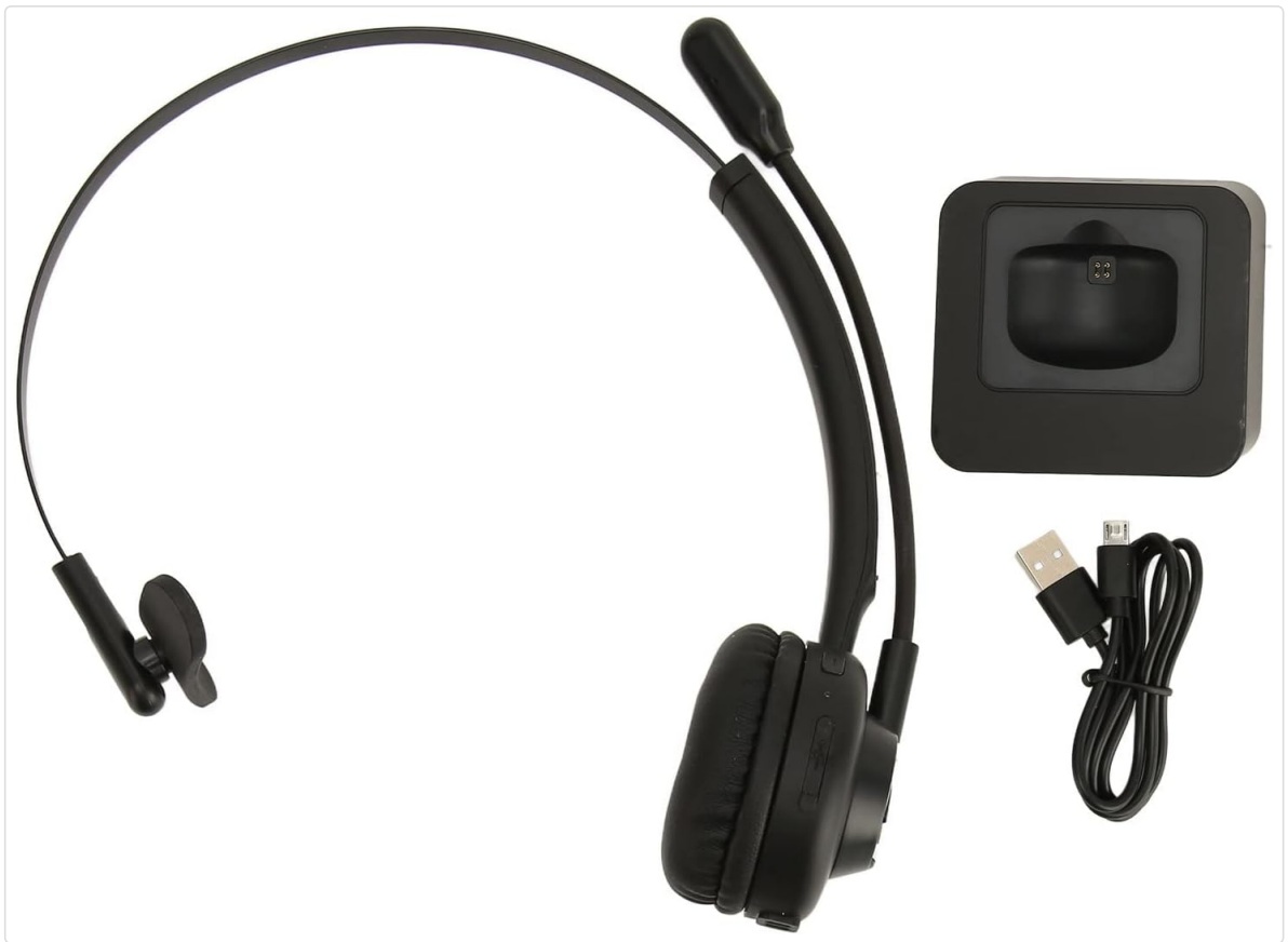
Image: The Jectse BH M97 headset, its dedicated charging base, and the USB charging cable.