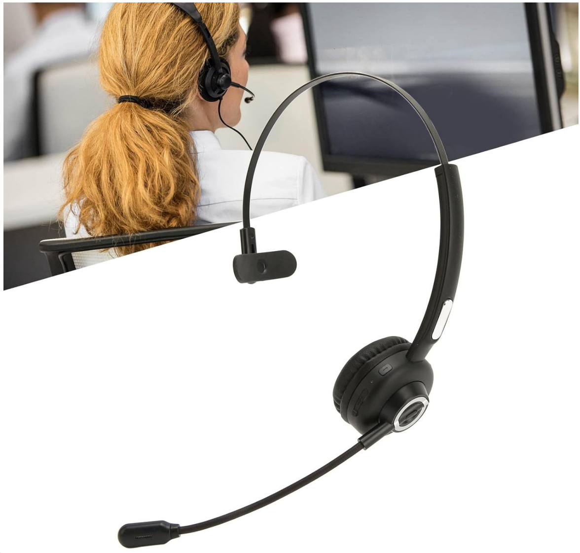
Image: A user wearing the Jectse BH M97 headset, demonstrating its practical application in a professional environment.