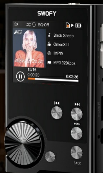
Figure 6: Supported File Formats for SWOFY M8.

M8 supports playback of a large number of HD native file formats, including MP3, WMA, AAC, OGG, WAV, APE, FLAC, AIFF, DSD and so on. Gapless playback of popular formats is fully supported. Simply insert the complimentary microSD card.