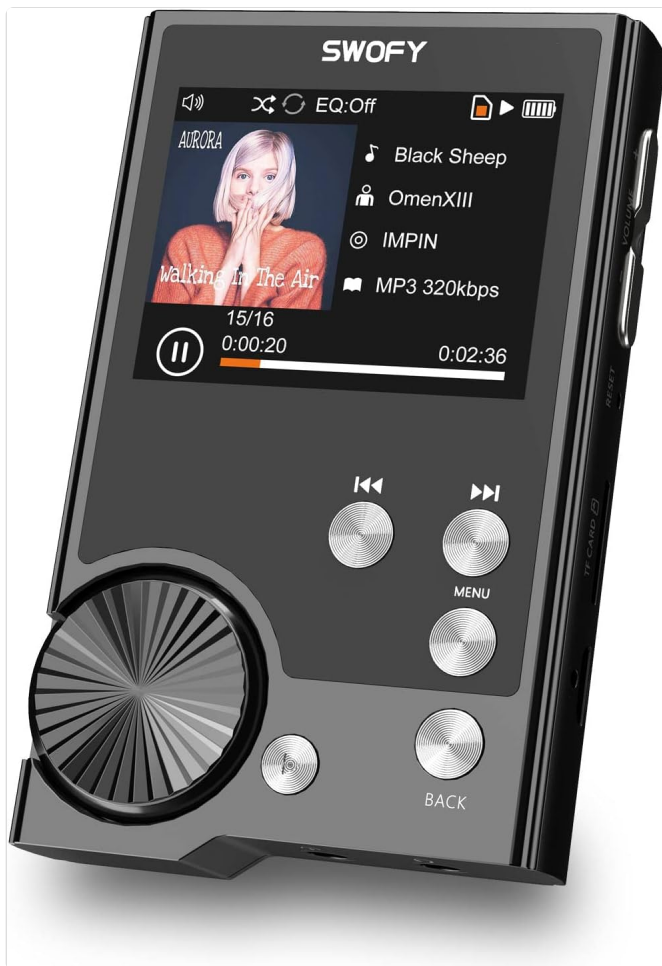
Figure 1: Front View of SWOFY M8 MP3 Player. Features a central screen, a large mechanical scroll wheel on the left, and control buttons (play/pause, next/previous, menu, back) on the right.