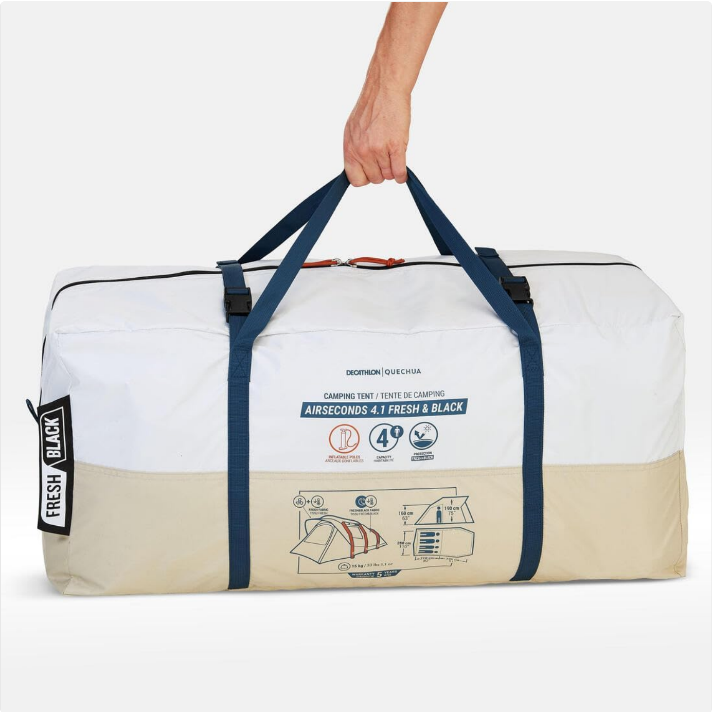
Image: The tent neatly packed into its carry bag, highlighting its portability.