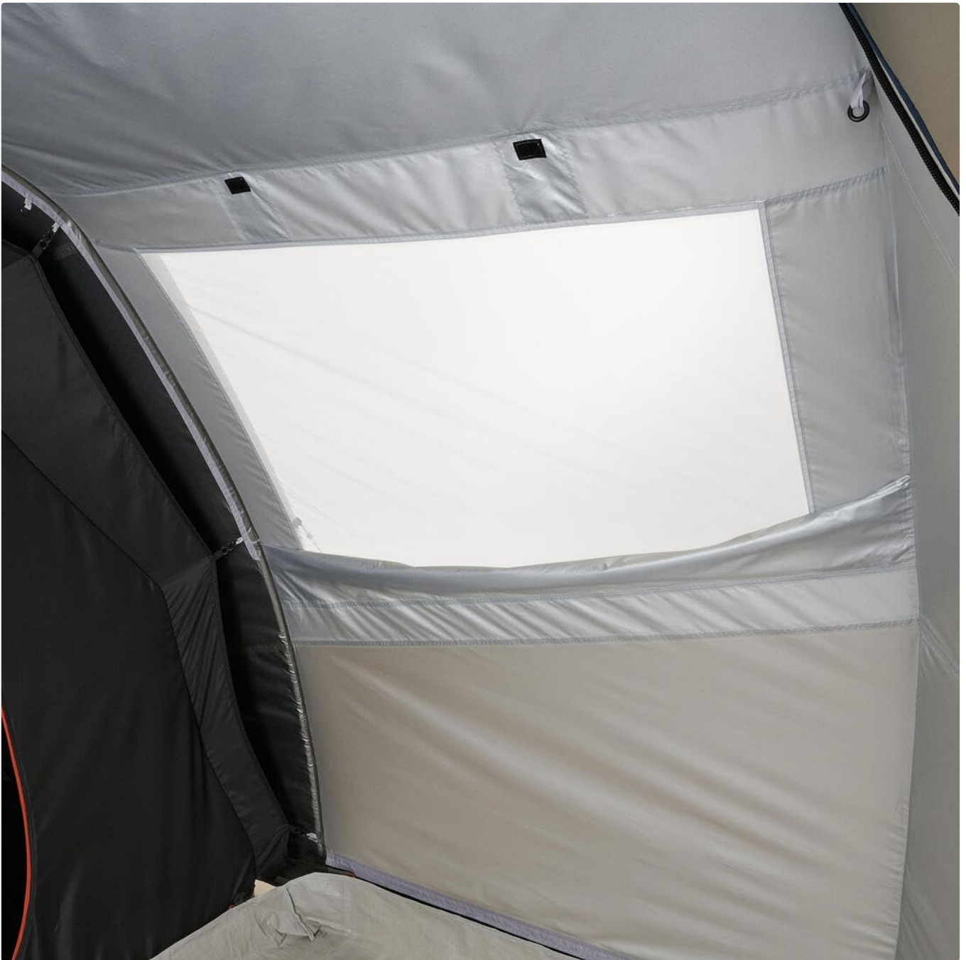
Image: A clear window panel on the tent, providing natural light.