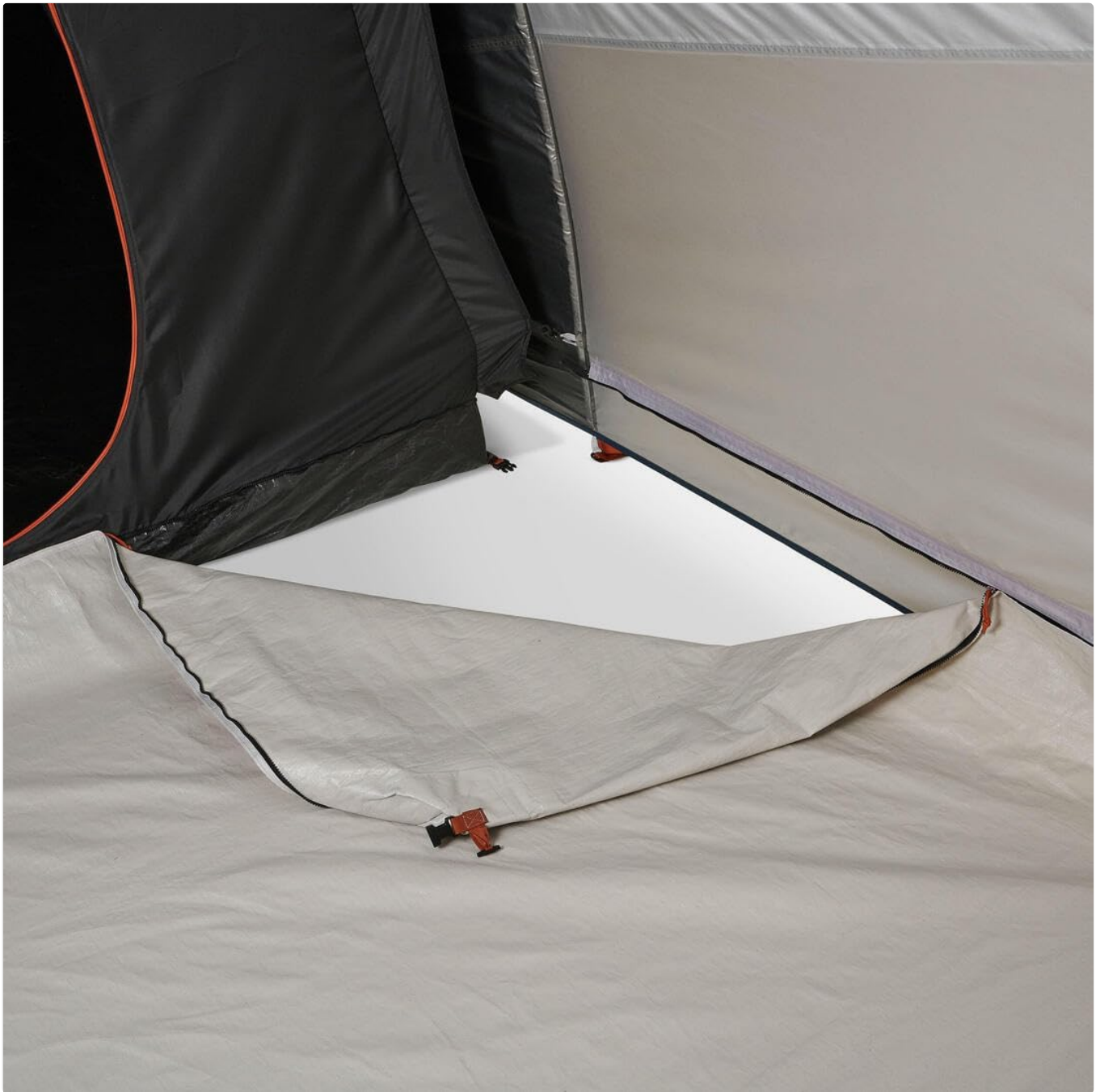
Image: Detail of the tent's integrated groundsheet, showing its robust construction and attachment points.