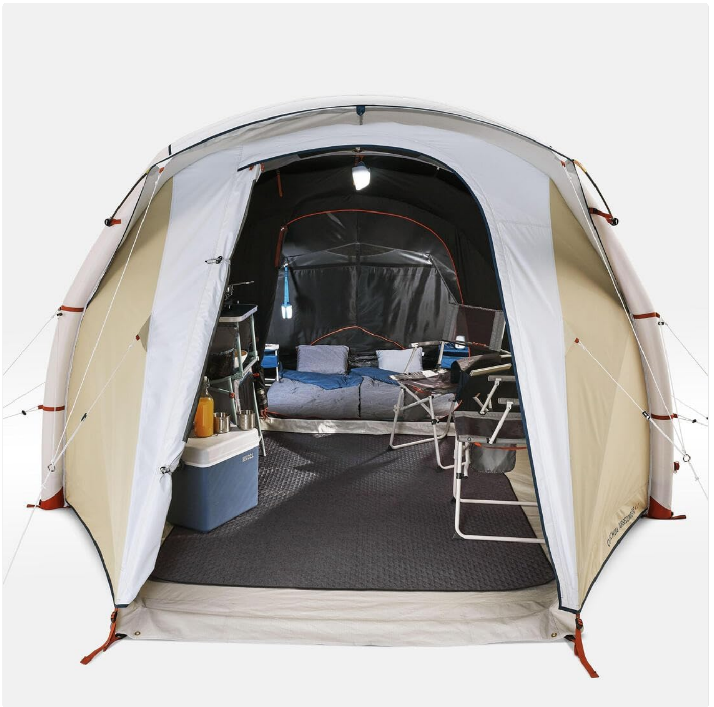
Image: The interior living space of the tent, showing ample room for camping furniture and gear.