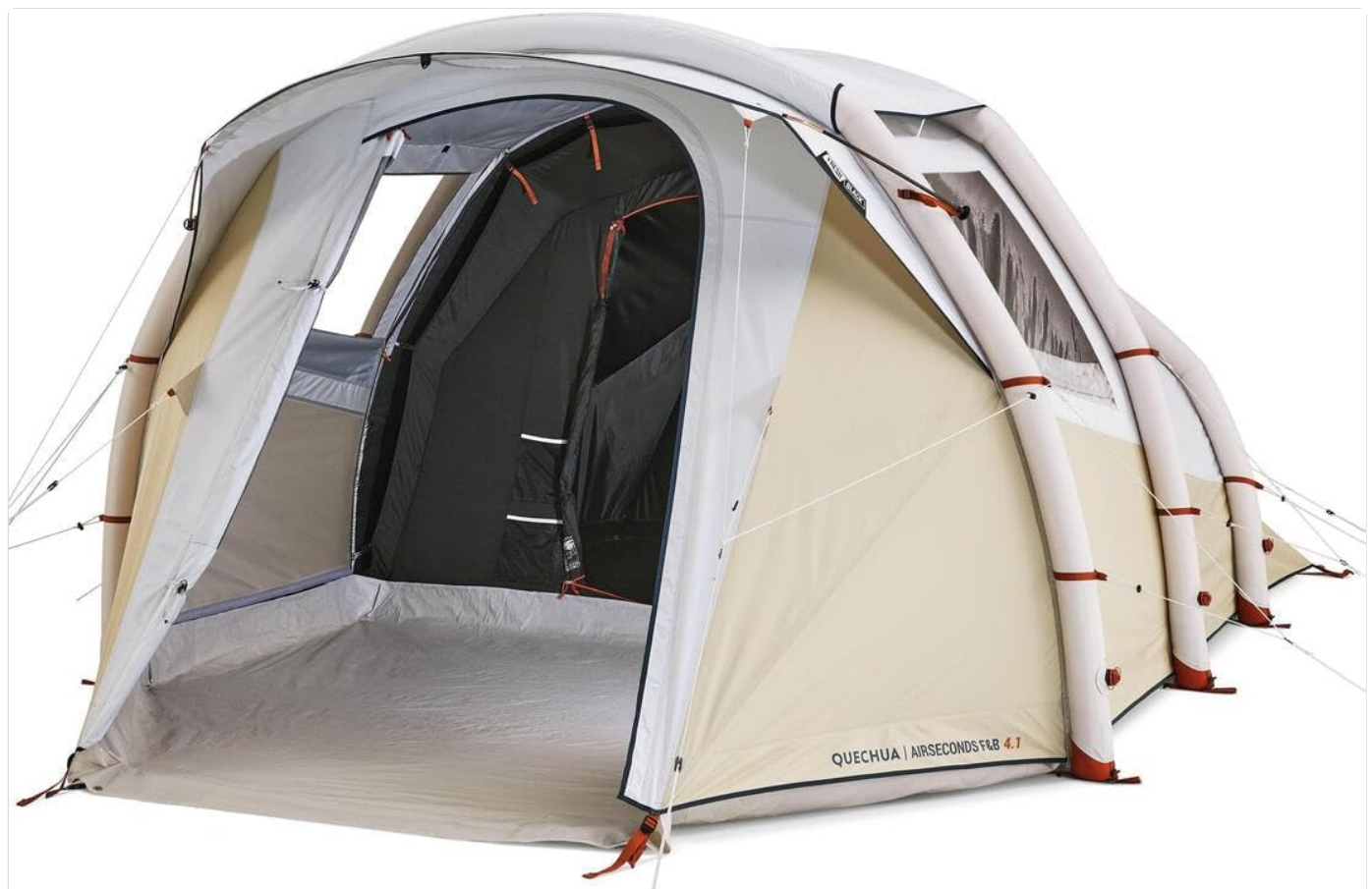
Image: The Decathlon Air Seconds 4.1 tent fully pitched, showcasing its spacious design and integrated bedroom.

This manual provides detailed instructions for the setup, operation, maintenance, and troubleshooting of your Decathlon Air Seconds 4.1 Inflatable Fresh And Black Family Tent. Designed for ease of use and comfort, this 4-person tent features an inflatable structure for quick pitching and a Fresh & Black fabric for improved light and heat management. Please read this manual thoroughly before using your tent to ensure a safe and enjoyable camping experience.