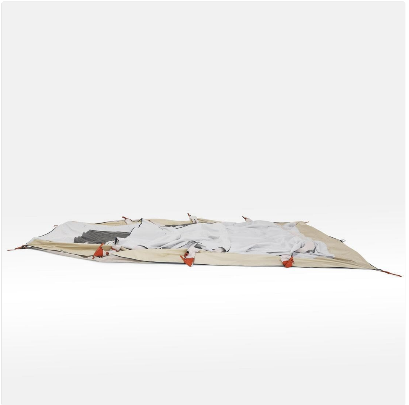
Image: An internal view of a ventilation flap, showing its design for airflow.