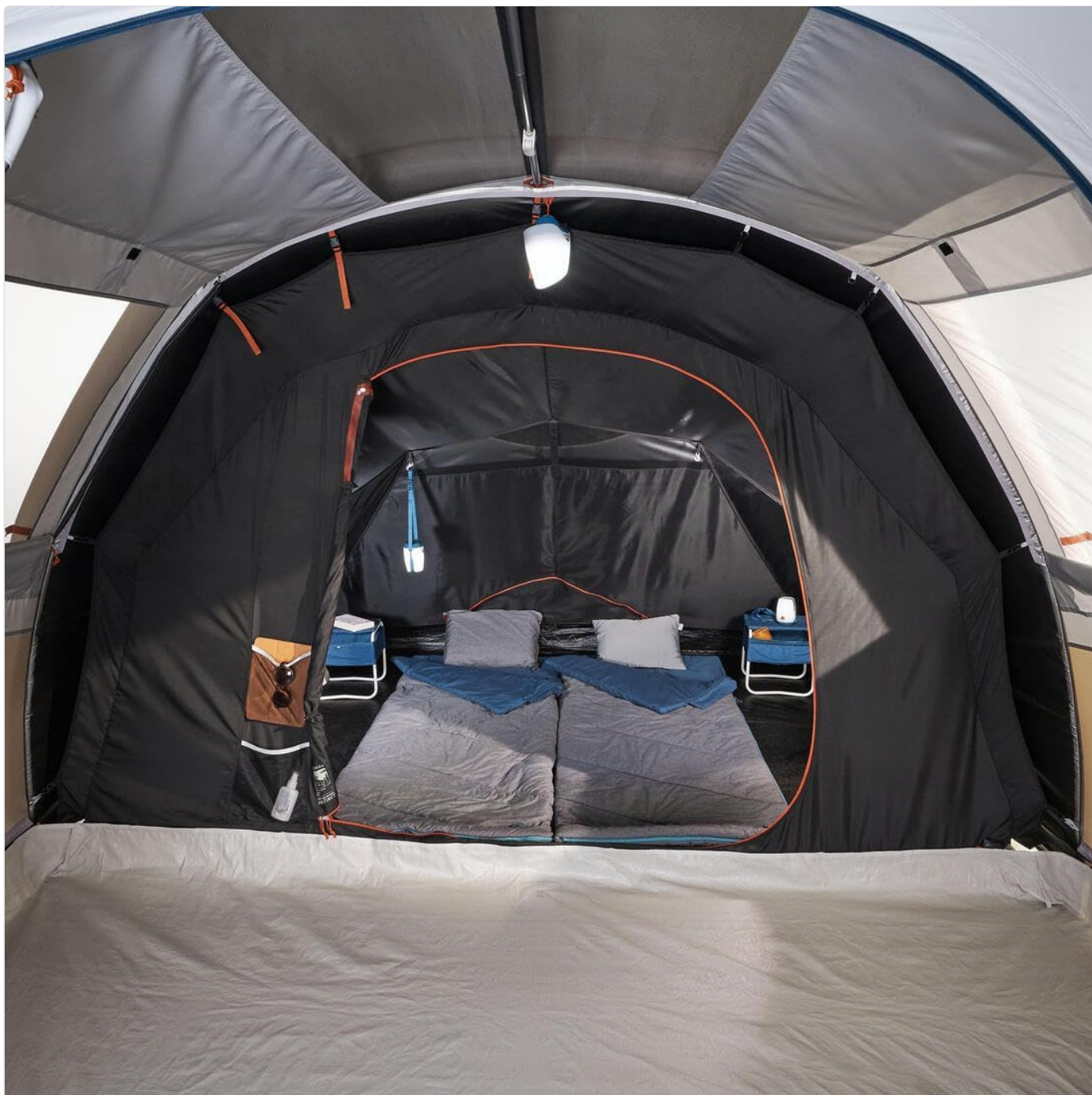
Image: The interior of the Fresh & Black bedroom, showing space for sleeping bags or air mattresses.