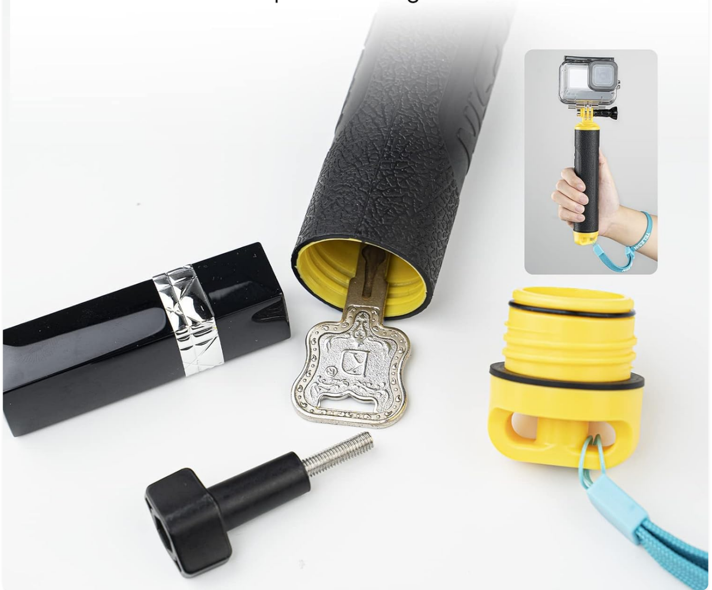
Image: The hand grip's base unscrewed to reveal the internal storage compartment, with a key and lipstick for scale.