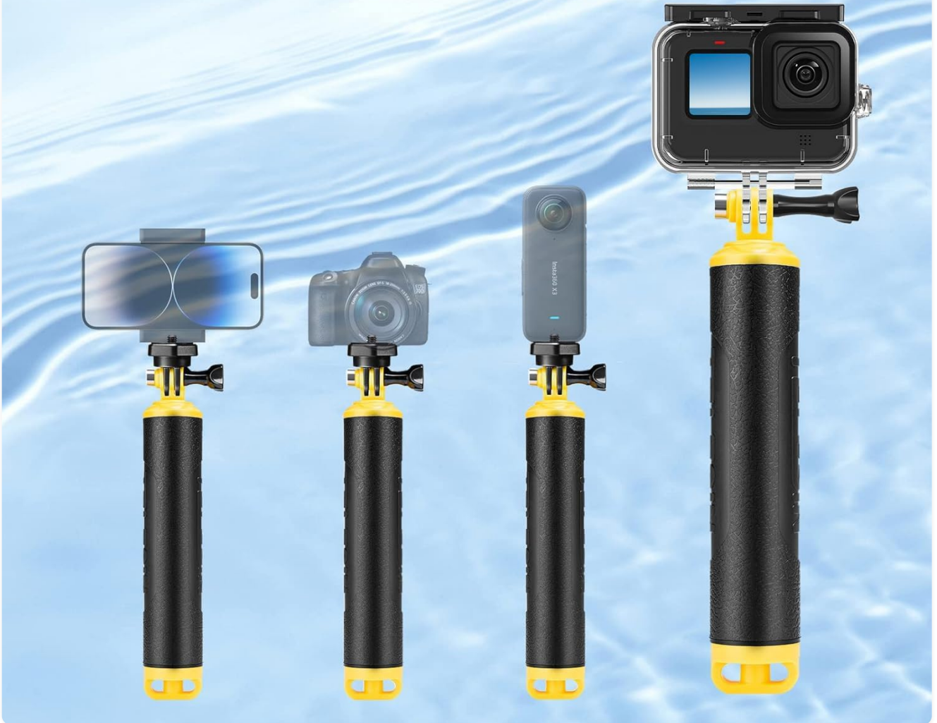
Image: The hand grip demonstrating compatibility with different action cameras and smartphones (with adapter, not included).

Fits all for gopro models and other cameras