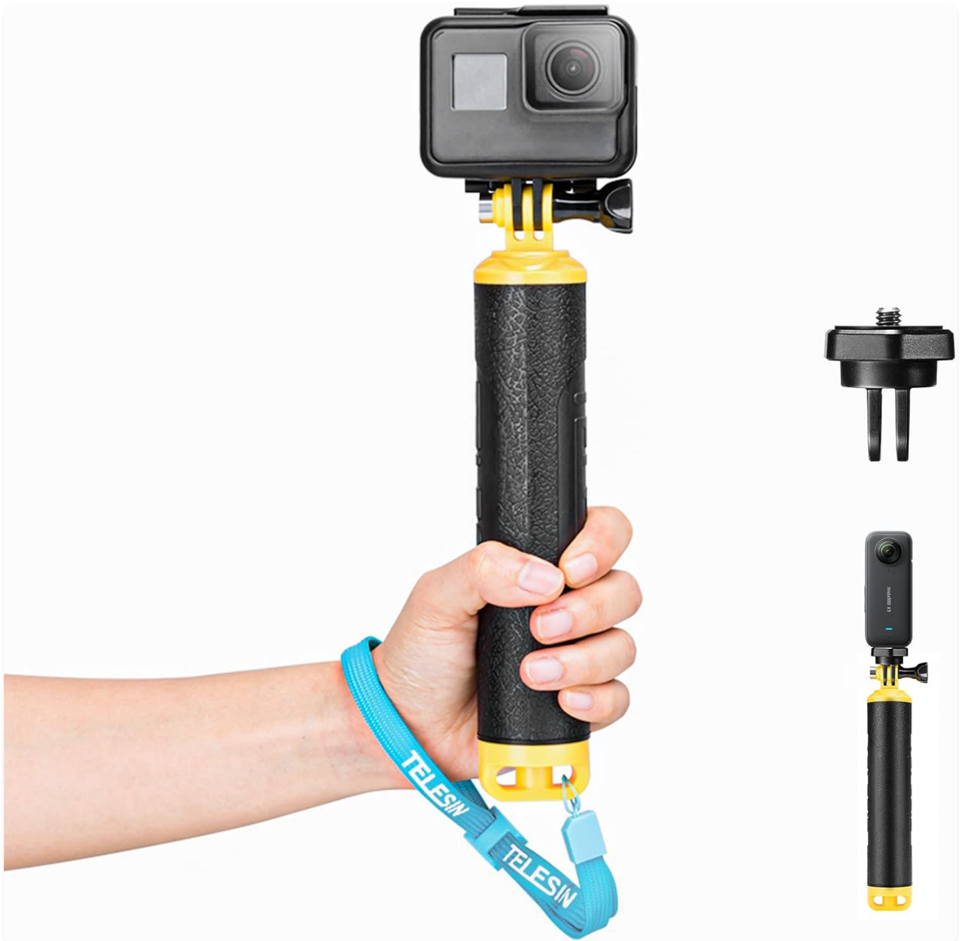
Image: The TELESIN Floating Hand Grip, shown with an action camera mounted, highlighting its ergonomic design and bright yellow accents.