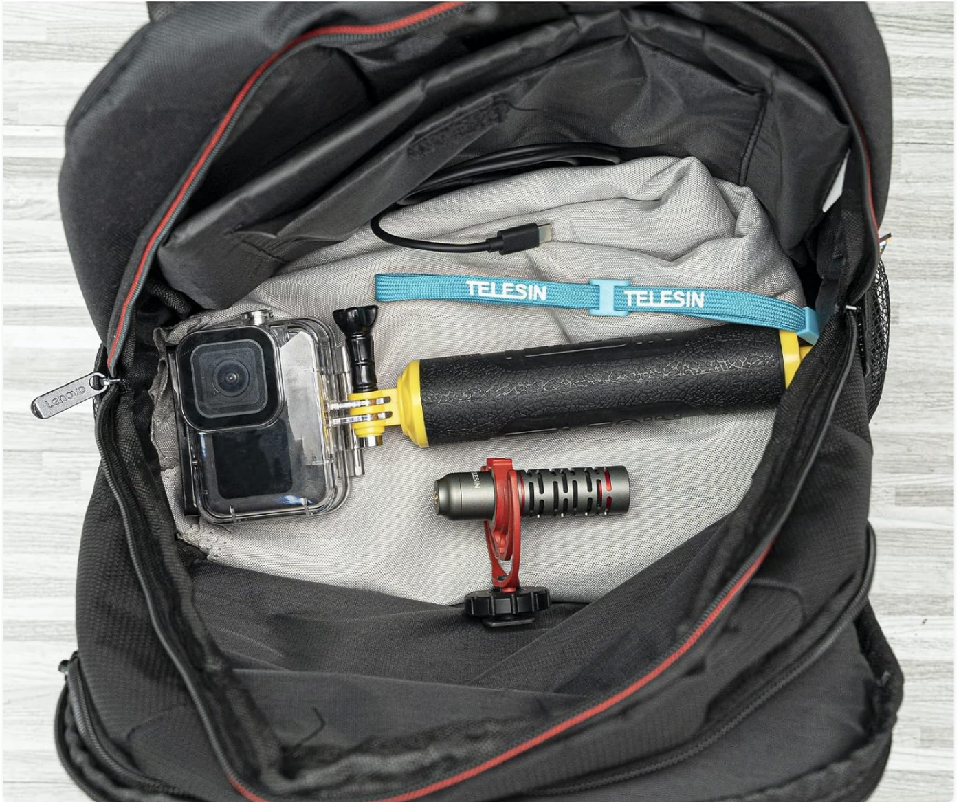
Image: The floating hand grip and accessories neatly packed inside a backpack, demonstrating its portability.