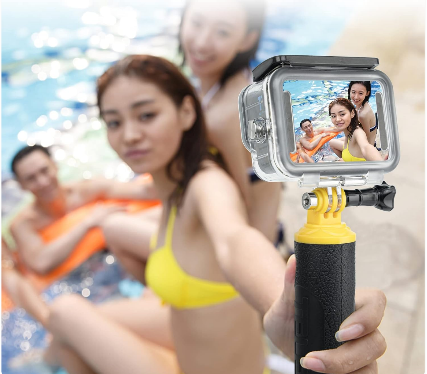
Image: A person holding the TELESIN Floating Hand Grip with an action camera in a swimming pool, capturing moments.