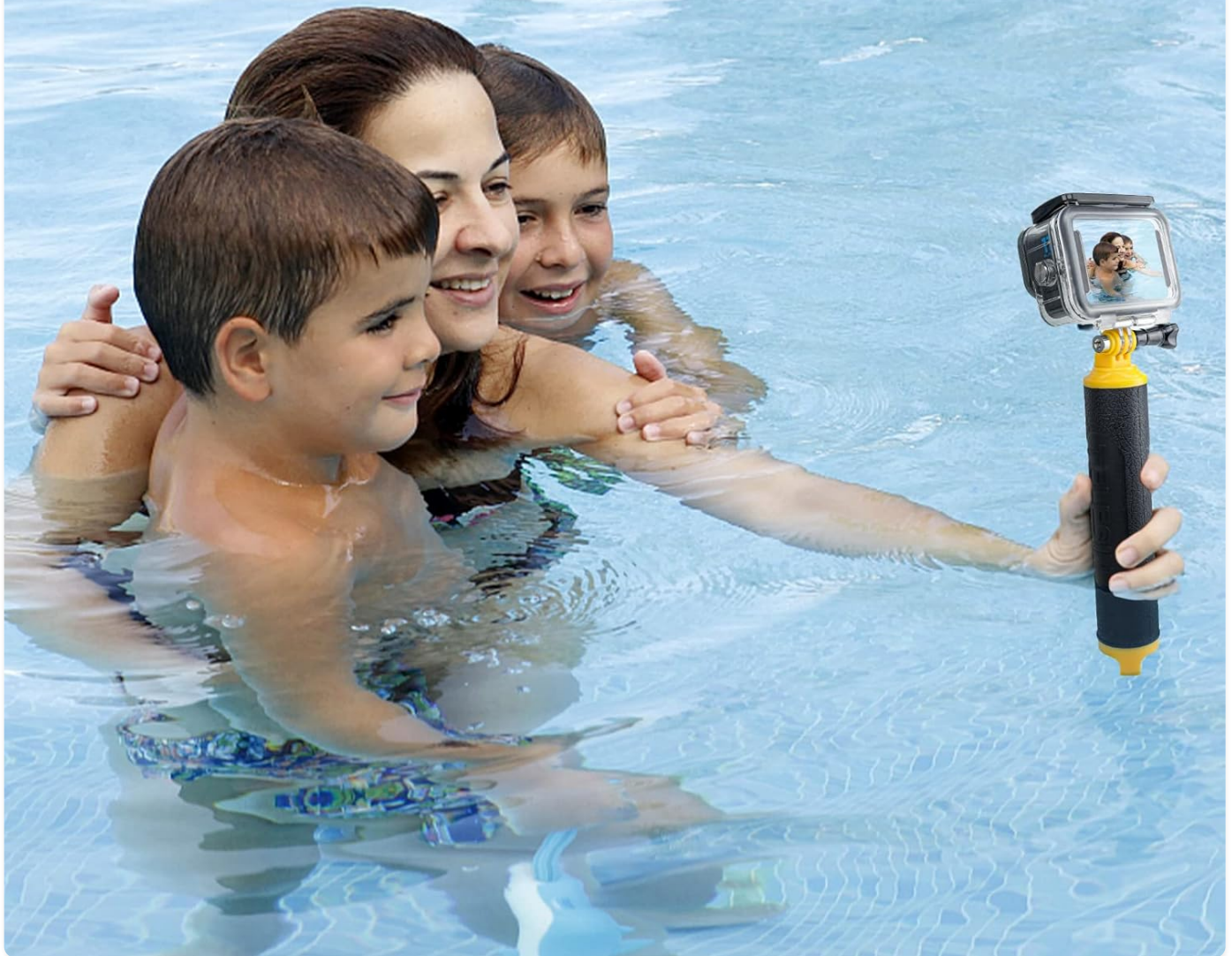
Image: A child in a swimming pool using the TELESIN Floating Hand Grip with a GoPro, illustrating its use in water.