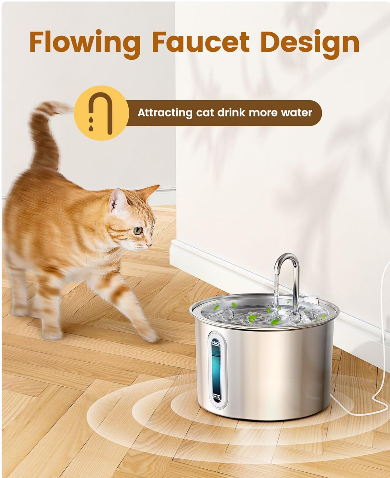
Image: A cat approaching the fountain, highlighting the flowing faucet design that attracts pets to drink.