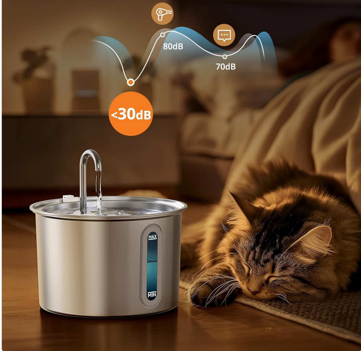
Image: A sleeping cat next to the fountain, demonstrating the ultra-quiet operation of the pump.