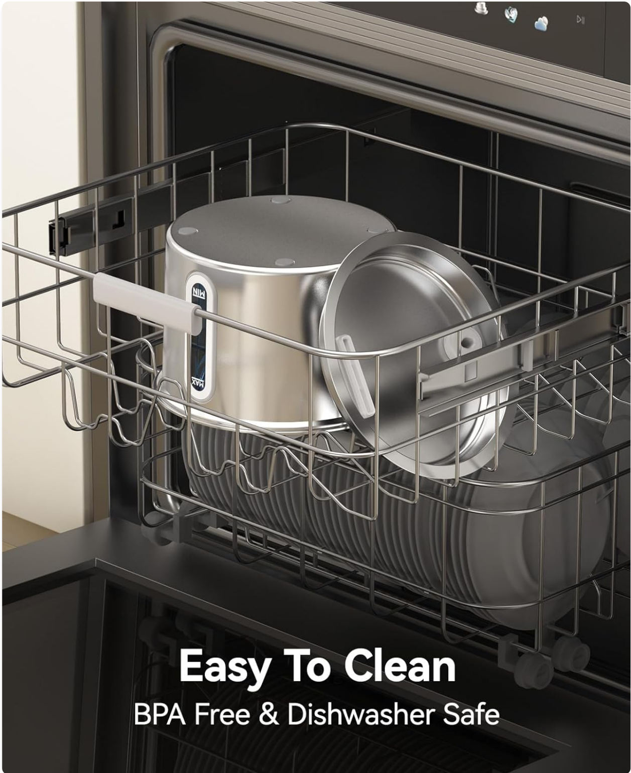
Image: The fountain's stainless steel components placed in a dishwasher, illustrating its ease of cleaning.