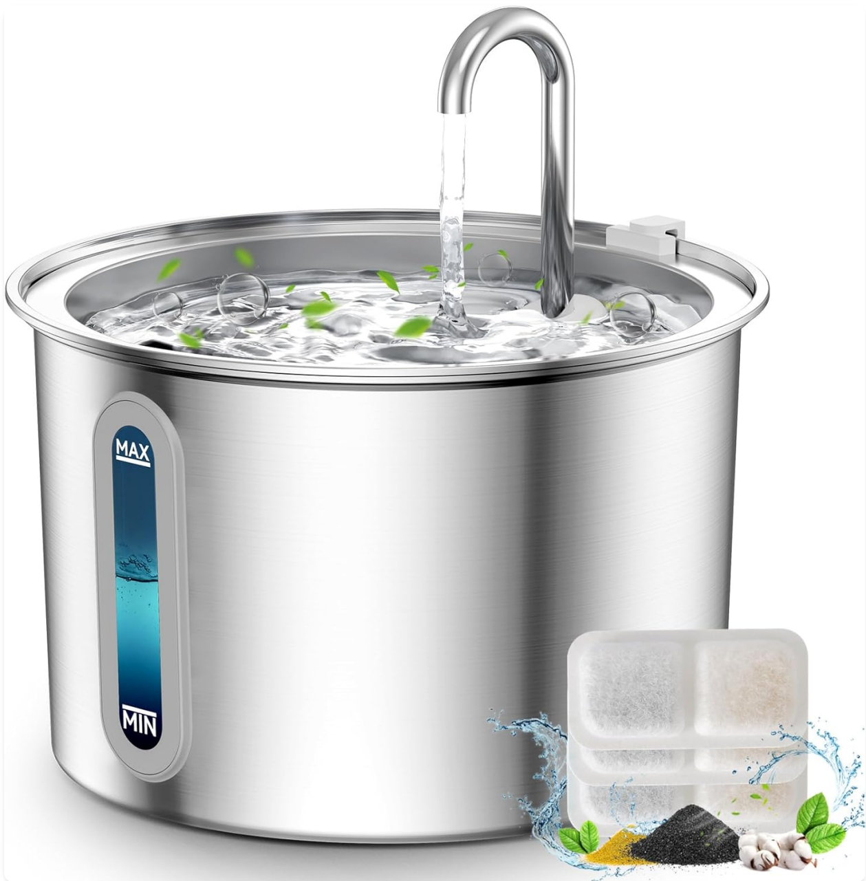
Image: The oneisall Stainless Steel Cat Water Fountain, showcasing its sleek design and included filters.