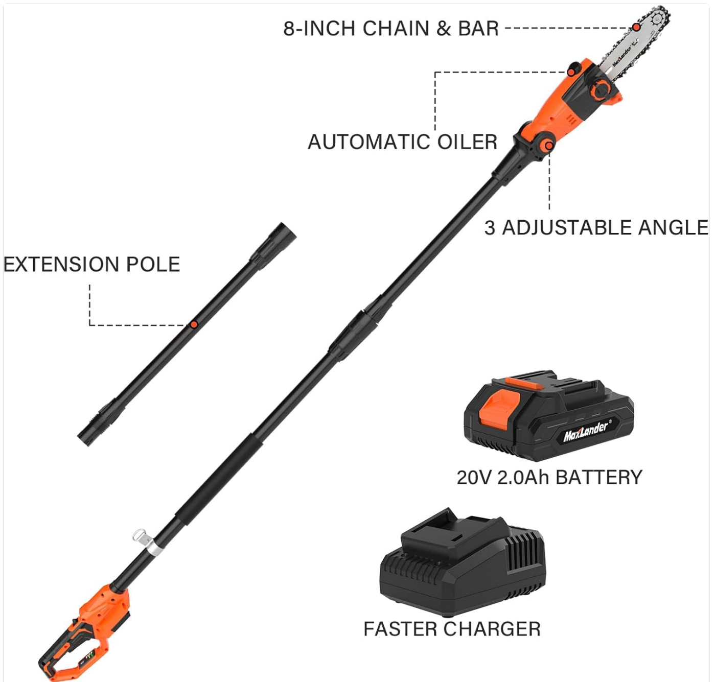
Figure 3.1: Key Components of the Pole Saw