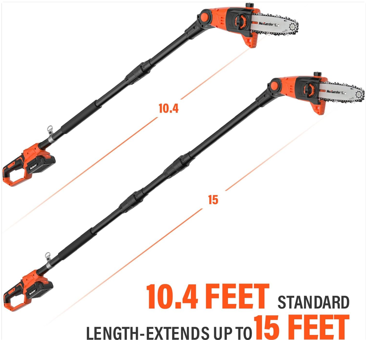
Figure 4.2: Pole Extension for Increased Reach