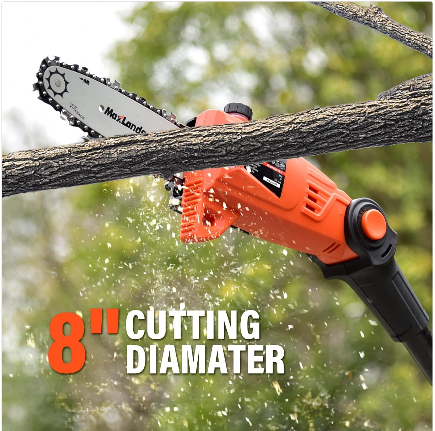
Figure 5.3: Pole Saw in Action, Demonstrating 8-inch Cutting Diameter