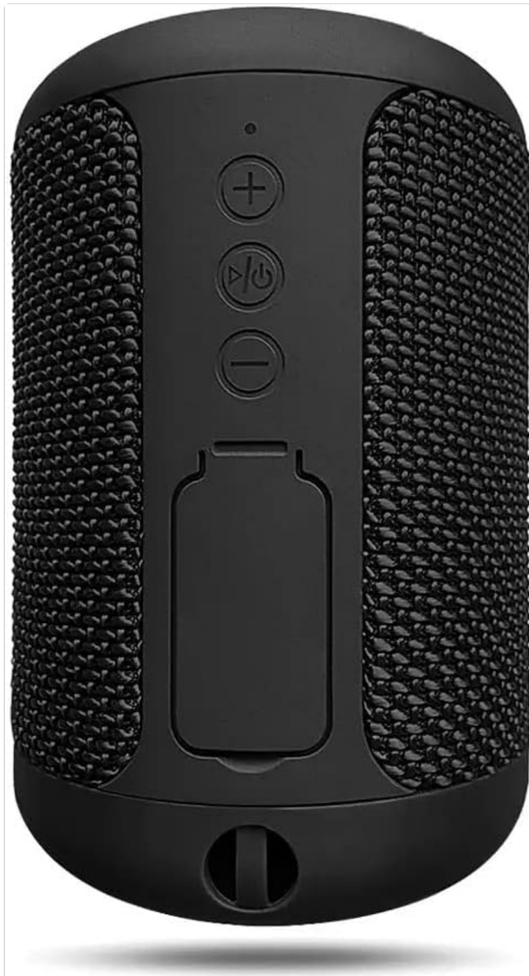
Figure 2: Front view of the speaker showing the control buttons and the sealed port cover. The buttons include Volume Up (+), Play/Pause/Power, and Volume Down (-). Below these, a rubber flap covers the charging and auxiliary ports.