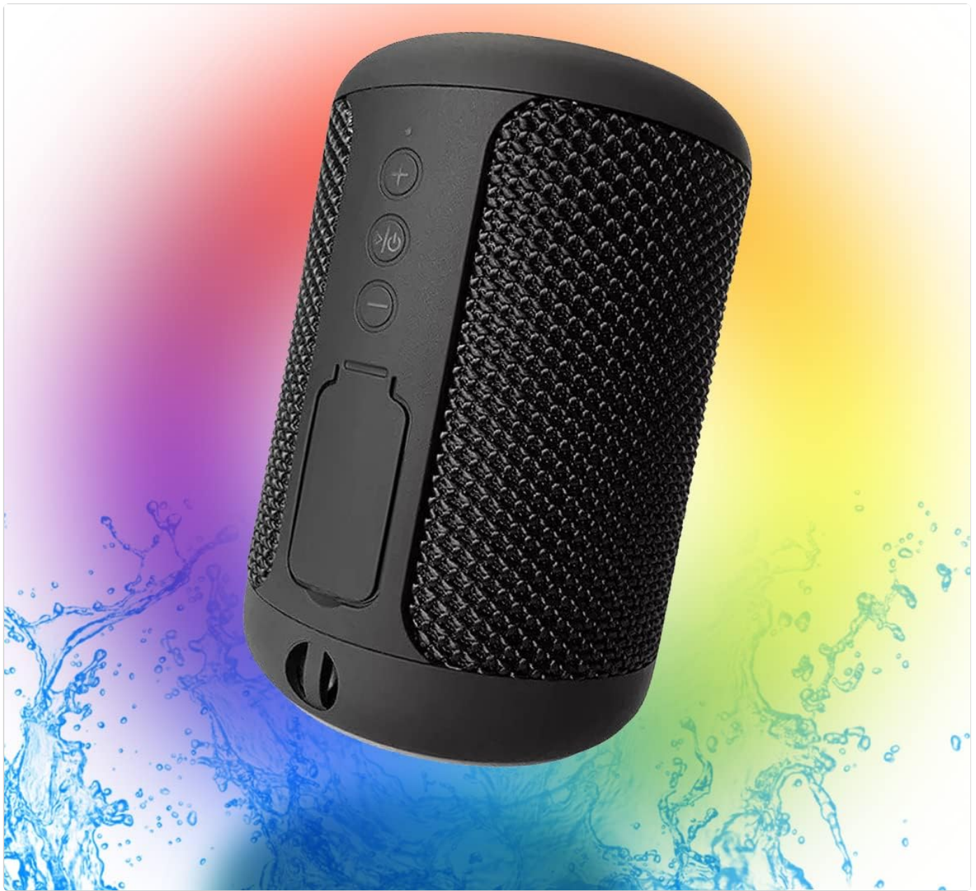
Figure 1: ATSound Wireless Mini Waterproof Bluetooth Speaker. This image shows the speaker from an angled perspective, highlighting its compact size and mesh-like exterior, with a colorful background and water splashes indicating its waterproof nature.