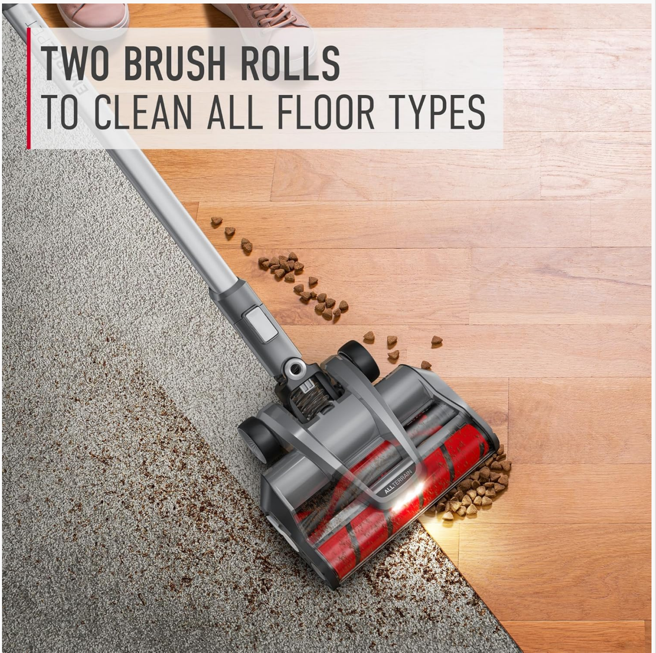
Image: The vacuum head transitioning from a carpeted surface to a hard floor, demonstrating its versatility in picking up debris on both.