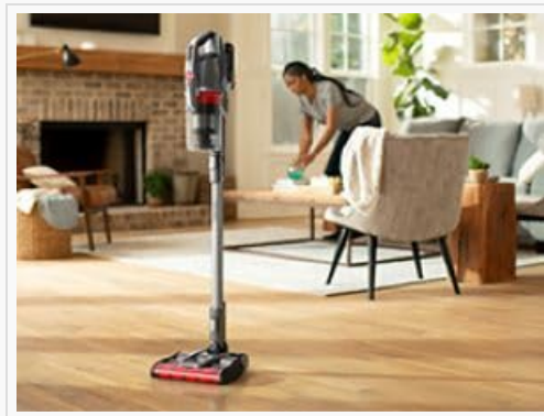
Image: The Hoover ONEPWR Emerge Pet+ vacuum standing upright independently in a living room setting, demonstrating its self-standing capability.

The vacuum is designed to stand upright on its own, allowing you to pause cleaning without needing to lean it against a wall or lay it down.