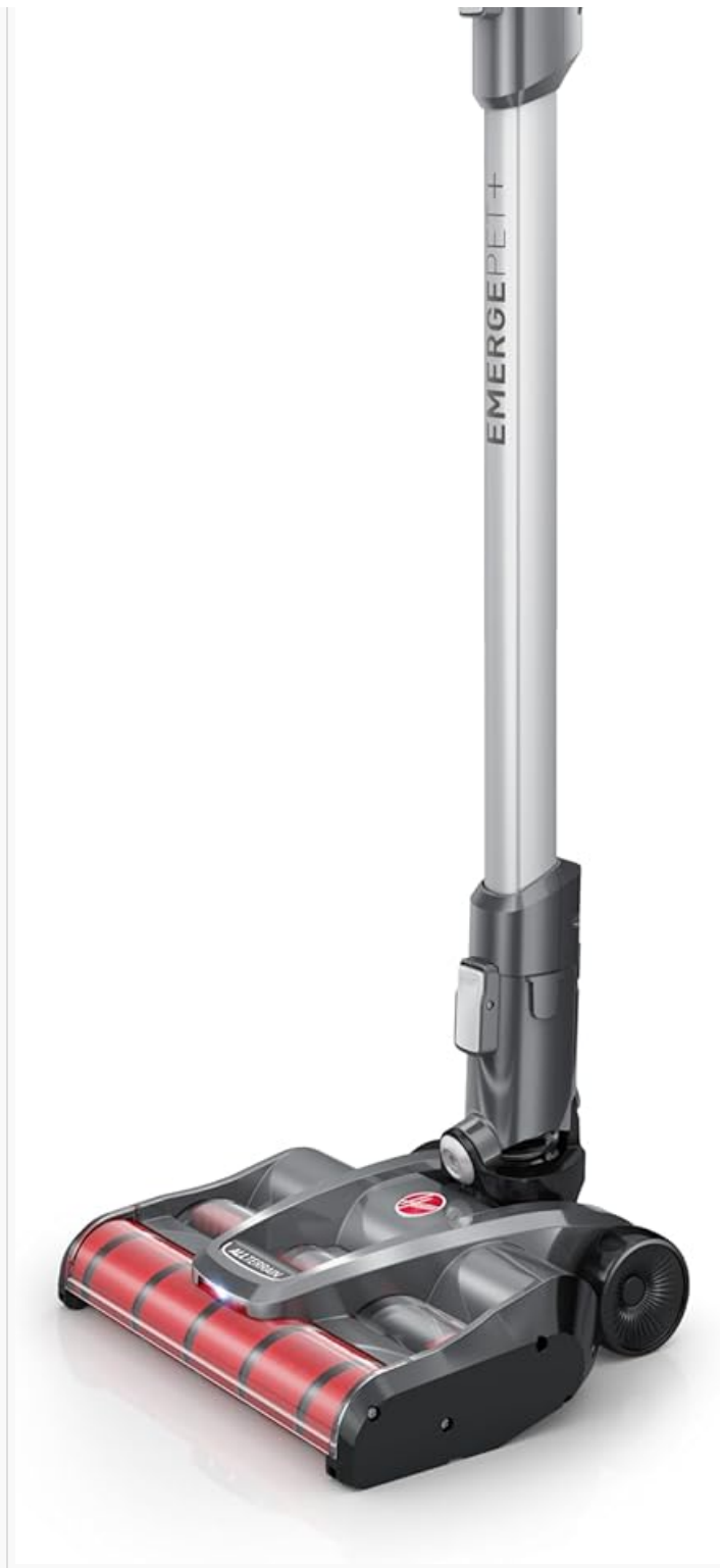
Image: The Hoover ONEPWR WindTunnel Emerge Pet+ Cordless Stick Vacuum Cleaner in its upright position, showcasing its sleek design and integrated battery.