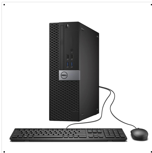
Figure 1: Dell OptiPlex 7040 Desktop Computer with included keyboard and mouse.

This manual provides essential information for the proper setup, operation, maintenance, and troubleshooting of your Dell OptiPlex 7040 Desktop Computer. Please read these instructions carefully to ensure optimal performance and longevity of your device.