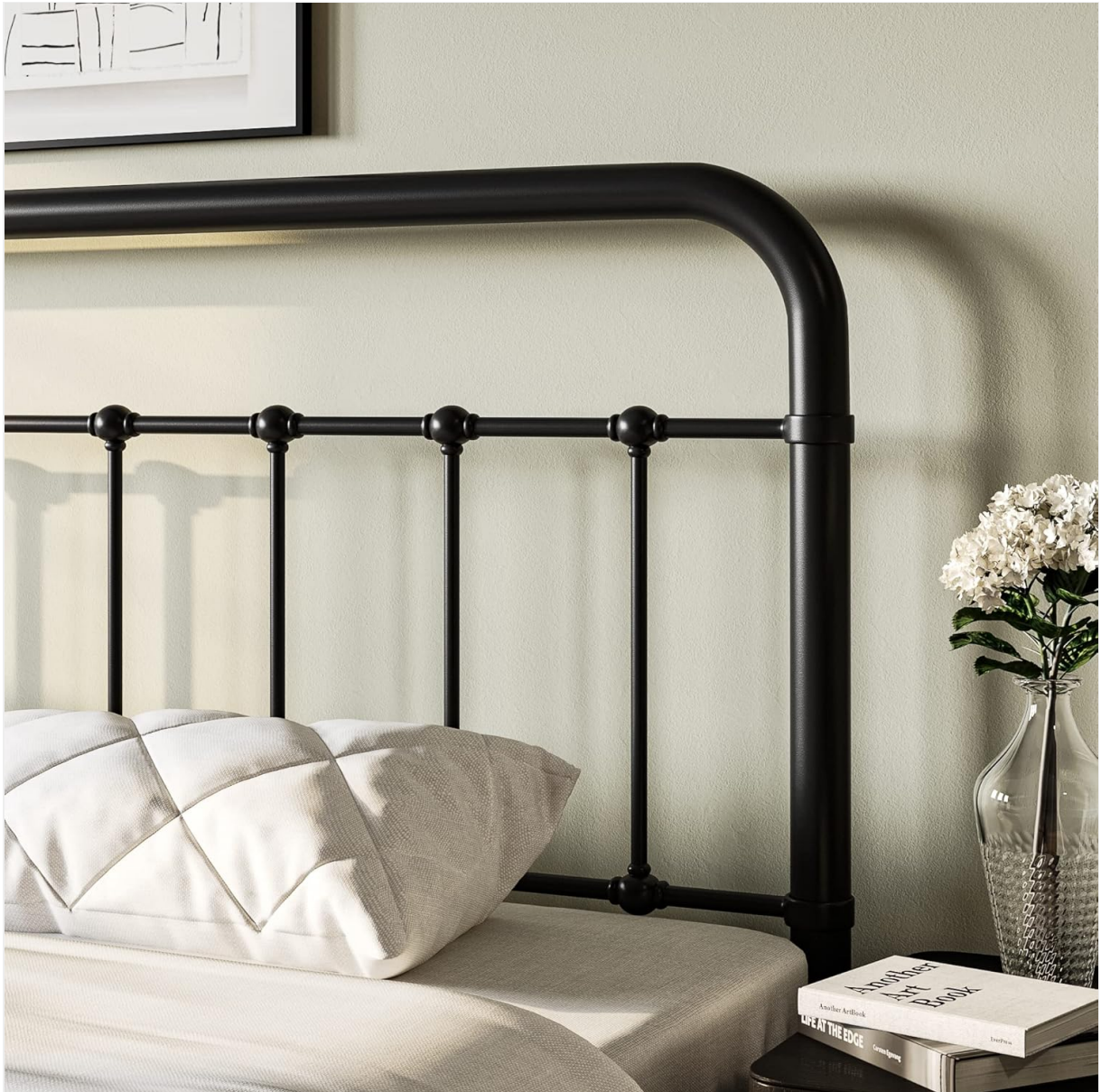
Image: A fully assembled SHA CERLIN metal bed frame, ready for a mattress.