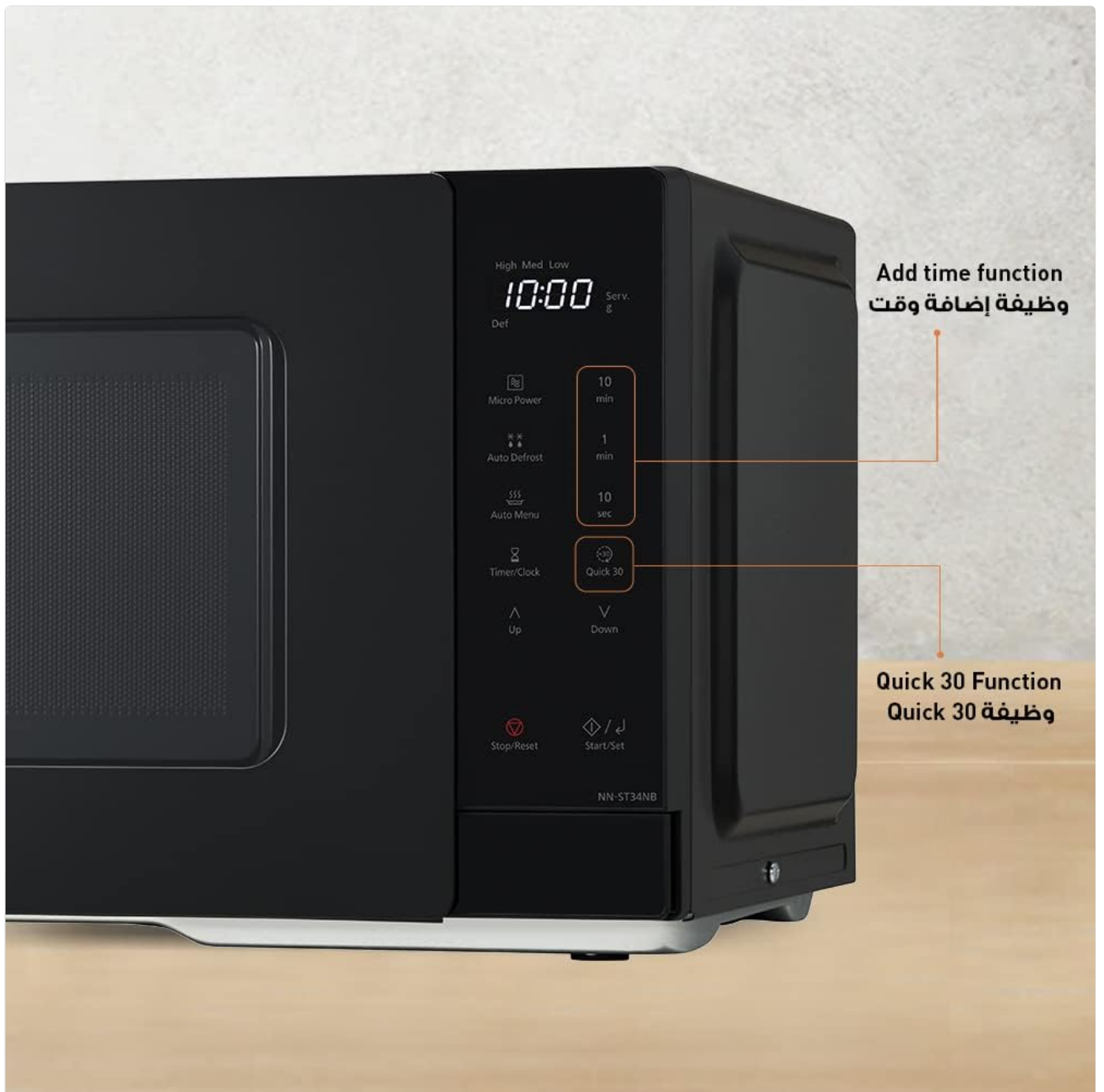
Image: A close-up of the control panel, pointing out the "Quick 30" button and the "Add time" function buttons (10 min, 1 min, 10 sec).