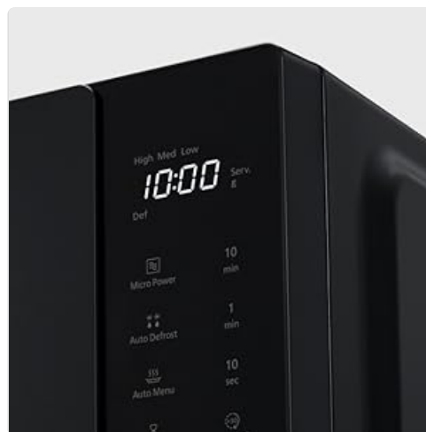
Image: A close-up view of the microwave's control panel, highlighting the white LED display showing "10:00" and various function buttons.