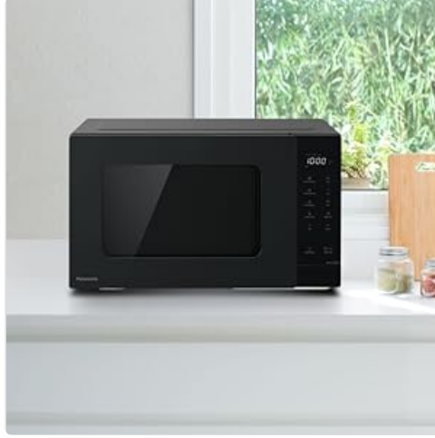
Image: The Panasonic NN-ST34NB microwave oven positioned on a clean kitchen countertop, demonstrating appropriate placement.