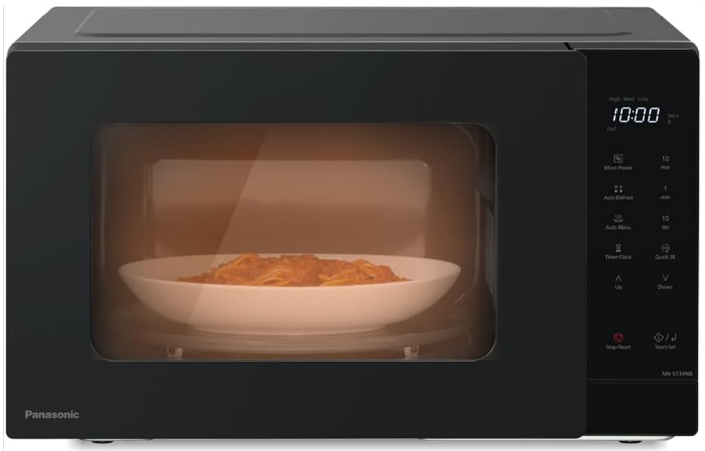
Image: Front view of the Panasonic NN-ST34NB microwave oven with a bowl of pasta heating inside, illustrating its operational state.