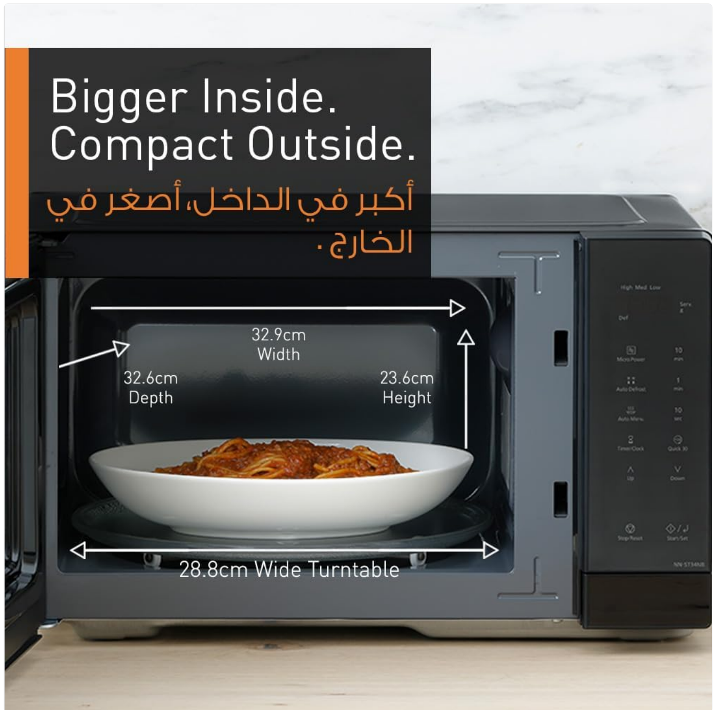
Image: An interior view of the microwave oven, highlighting the dimensions of the cavity (32.9cm width, 32.6cm depth, 23.6cm height) and the 28.8cm wide turntable.