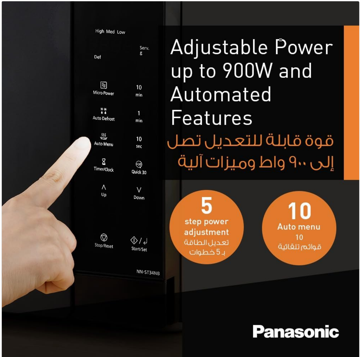
Image: The microwave's control panel, indicating the "Micro Power" button for 5-step power adjustment and the "Auto Menu" button for 10 pre-set menus.