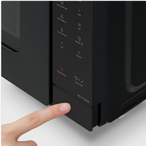
Image: A hand pressing the push-button door release located below the control panel, demonstrating how to open the microwave door.

The oven door opens by pressing the integrated push button located at the bottom right of the control panel.