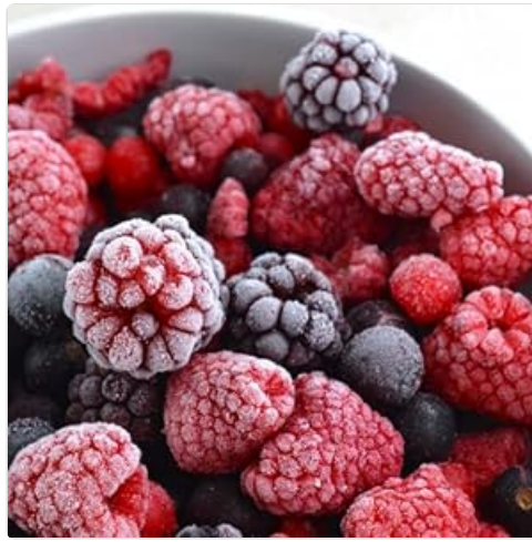
Image: A bowl filled with frozen mixed berries, illustrating food suitable for the Auto Defrost function.