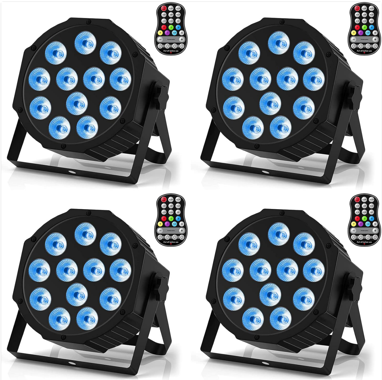
This image displays the four HOLDLAMP Rechargeable Par Lights, showcasing their compact design and the included remote controls.