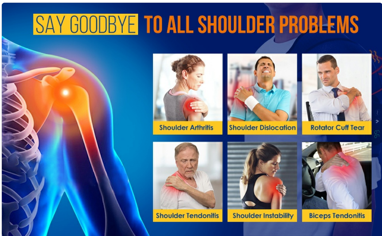
Image: Visual representation of common shoulder discomforts the product aims to alleviate.

Note: This device is not intended to diagnose, treat, cure, or prevent any disease or health condition. Consult a healthcare professional for any medical concerns.