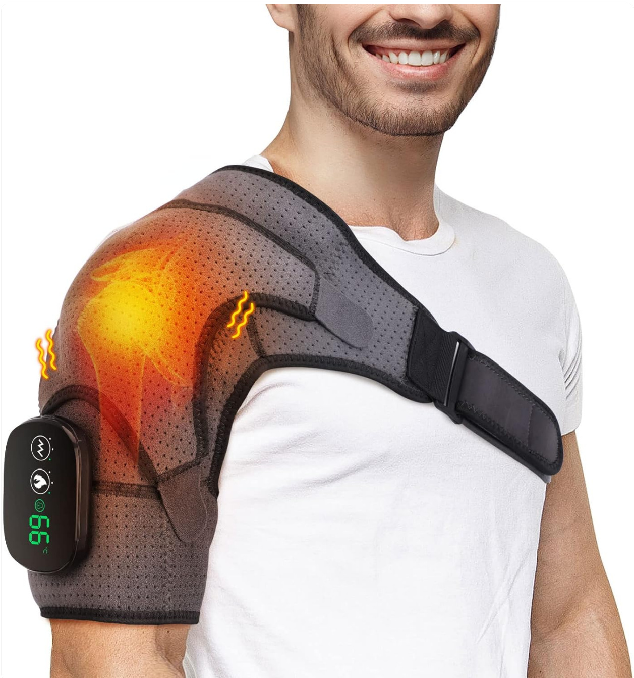
Image: The AFDEAL Cordless Shoulder Heating Pad in use, highlighting its heating function.