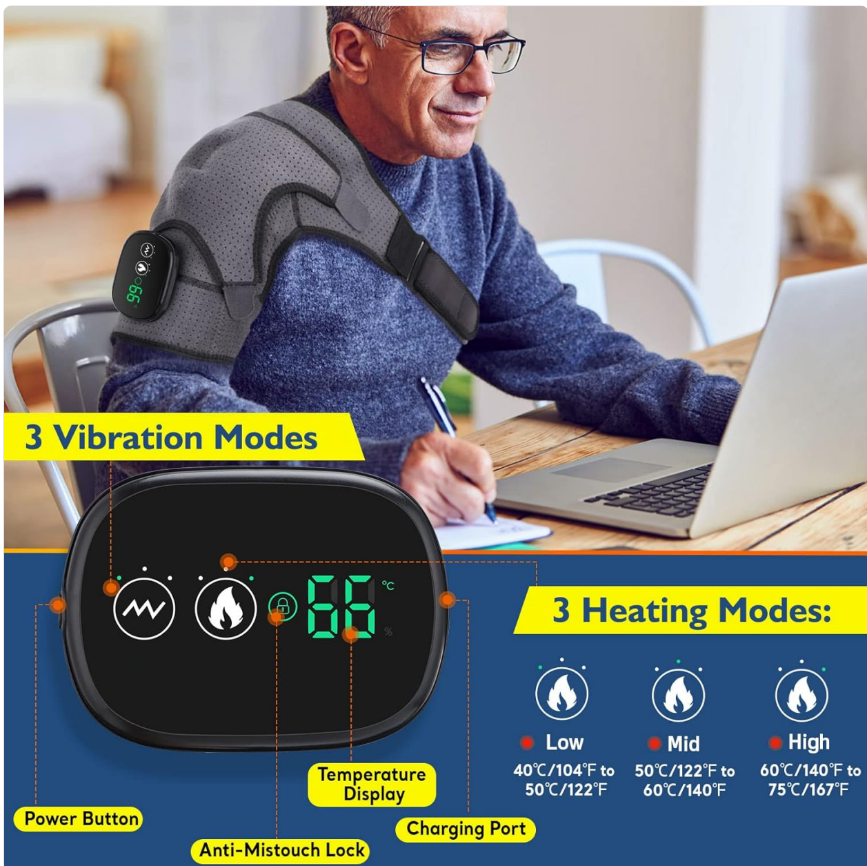
Image: Overview of the control panel and its functions.

If it is difficult to operate the control unit while wearing the pad, it is recommended to use a mirror to view and adjust the settings.