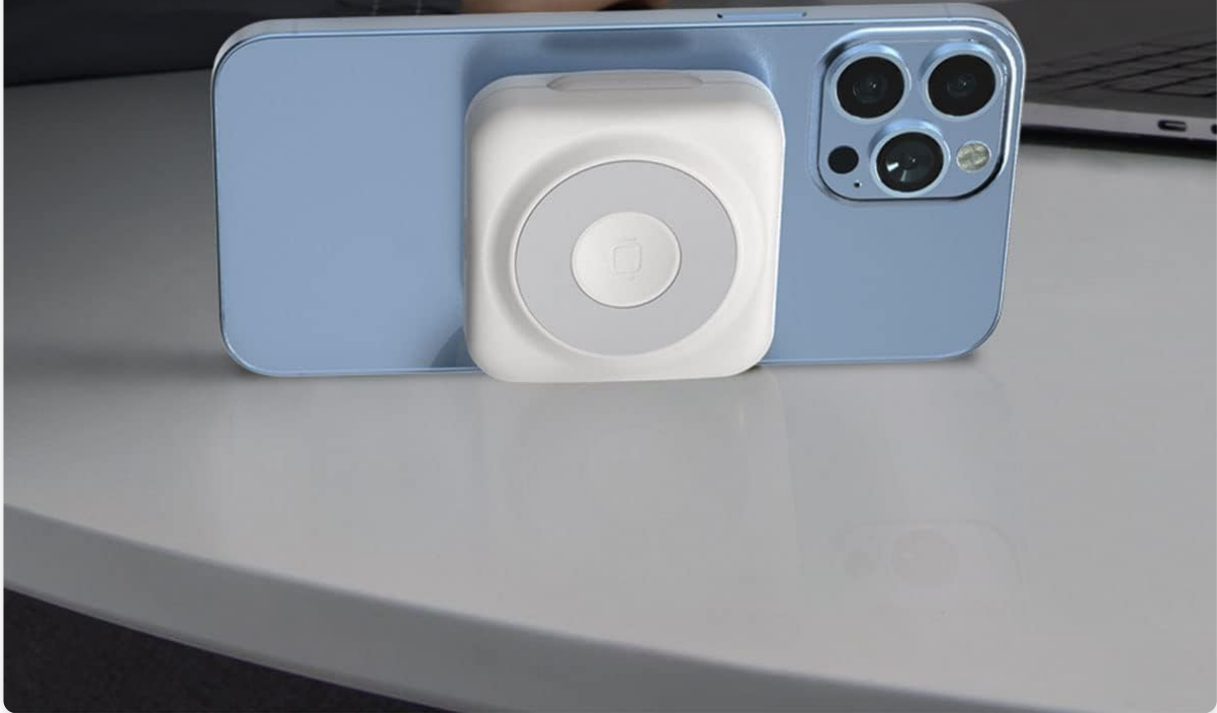
Image 2.3: A person holding a smartphone with the LIMETA EB10 power bank magnetically attached to its back, illustrating that the phone can be used comfortably even while it is being charged wirelessly by the power bank.