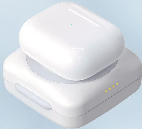
Image 1.2: An illustration highlighting the key features of the LIMETA EB10 power bank, including fast charging capability, APP Linkage for smart control, lightweight design for travel, and its function as a mobile phone holder during charging.