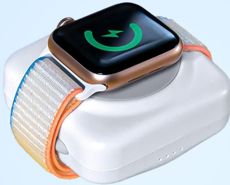
Image 2.4: The LIMETA EB10 power bank with a smartwatch placed on its integrated charging pad, indicating that the smartwatch can be kept fully charged on the go.