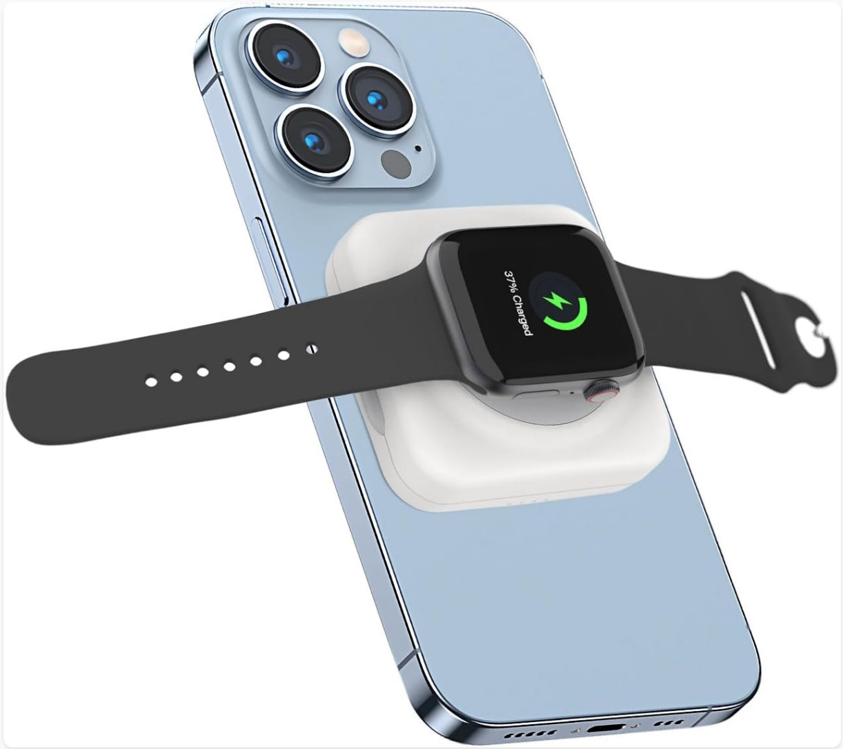
Image 1.1: The LIMETA EB10 power bank simultaneously charging a smartphone and a smartwatch. The power bank is compact and attaches magnetically to the back of the phone, with the smartwatch placed on its dedicated charging pad.