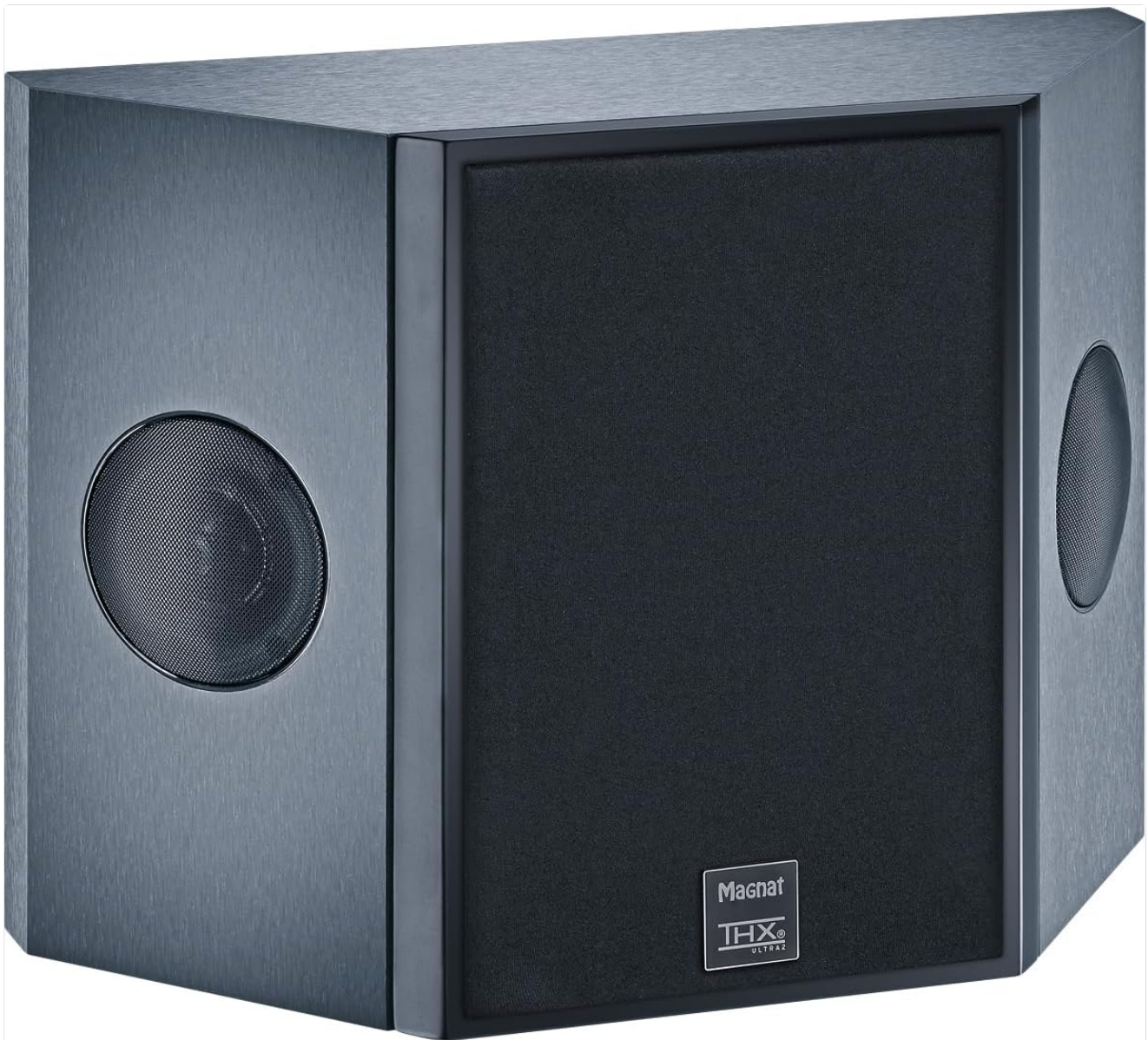
Figure 4: Front view of the Magnat Cinema Ultra RD 200-THX speaker with the protective grille attached. The grille protects the drivers during operation.