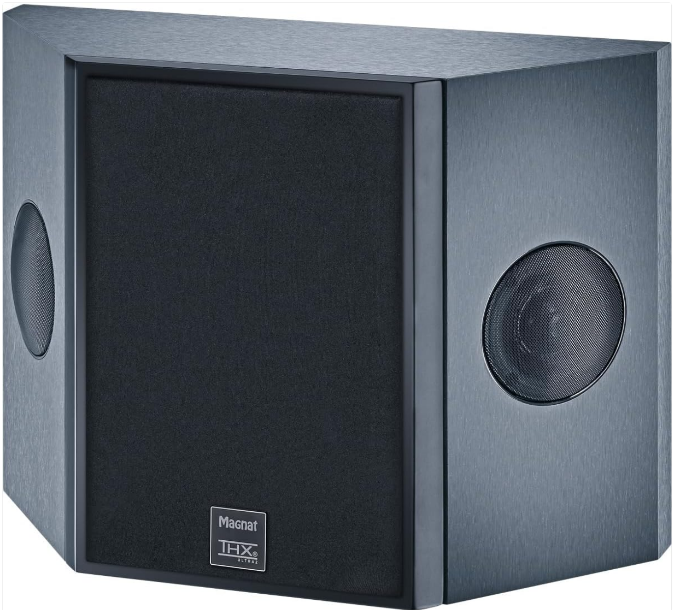
Figure 2: Angled view of the Magnat Cinema Ultra RD 200-THX speaker with the protective grille, highlighting its trapezoidal shape for versatile placement.