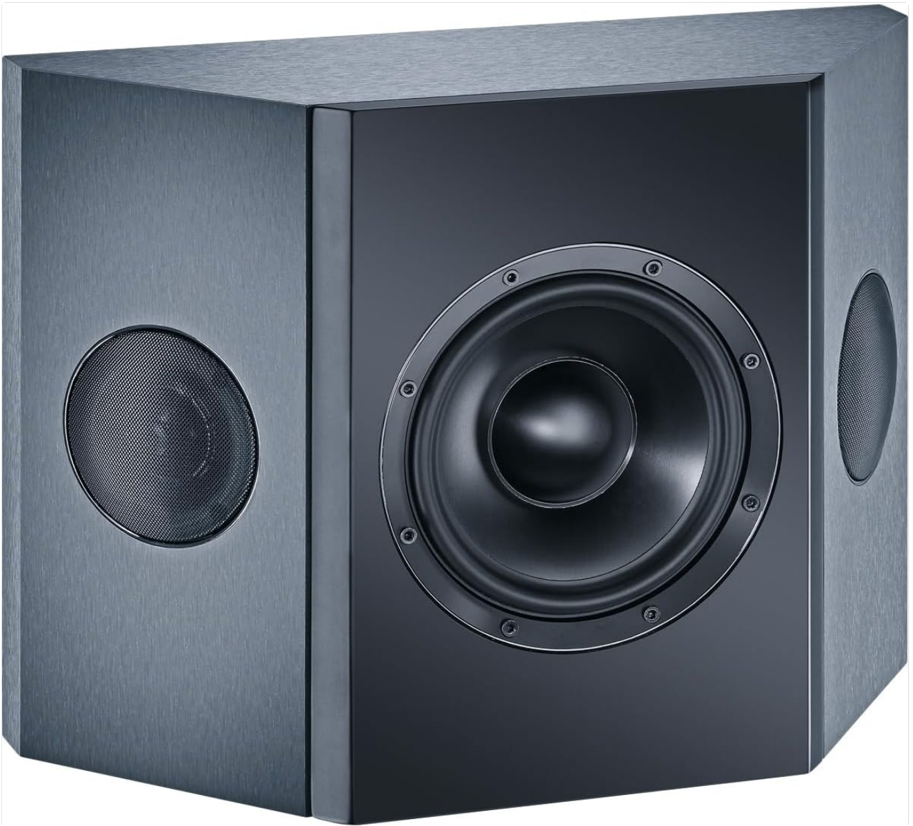
Figure 3: Front view of the Magnat Cinema Ultra RD 200-THX speaker without the grille, showing the woofer and tweeters. Speaker terminals are typically located on the rear panel.