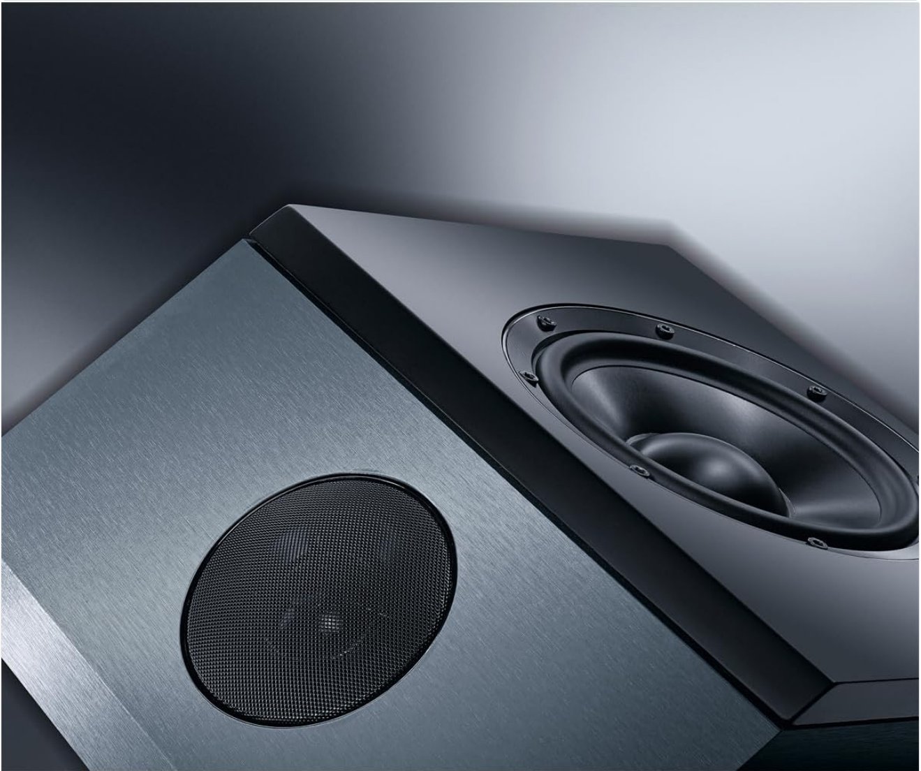
Figure 5: Close-up detail of the woofer and one of the dome tweeters on the Magnat Cinema Ultra RD 200-THX speaker. Handle drivers with care during cleaning.