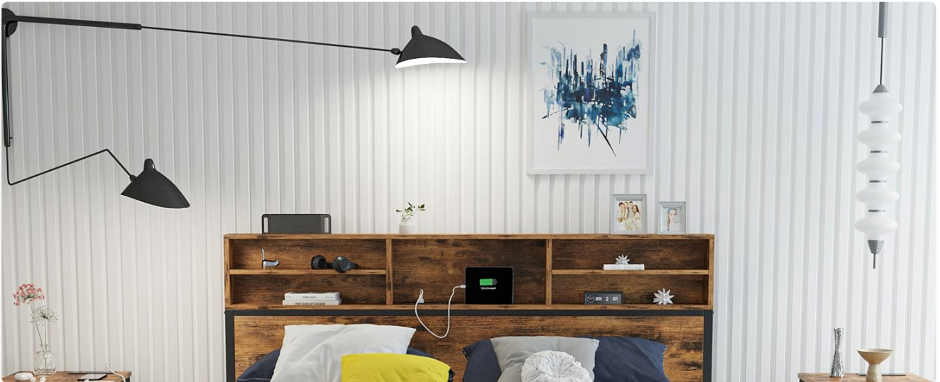
Figure 1: Overall view of the LIKIMIO Queen Bed Frame with dimensions.

The LIKIMIO Queen Bed Frame (Model HK-QBF-012) is designed to provide a sturdy and functional foundation for your mattress without the need for a box spring. It features a tall bookcase headboard with integrated storage cubbies and a convenient charging station. The frame is constructed from engineered wood and metal, ensuring durability and a noise-free experience.