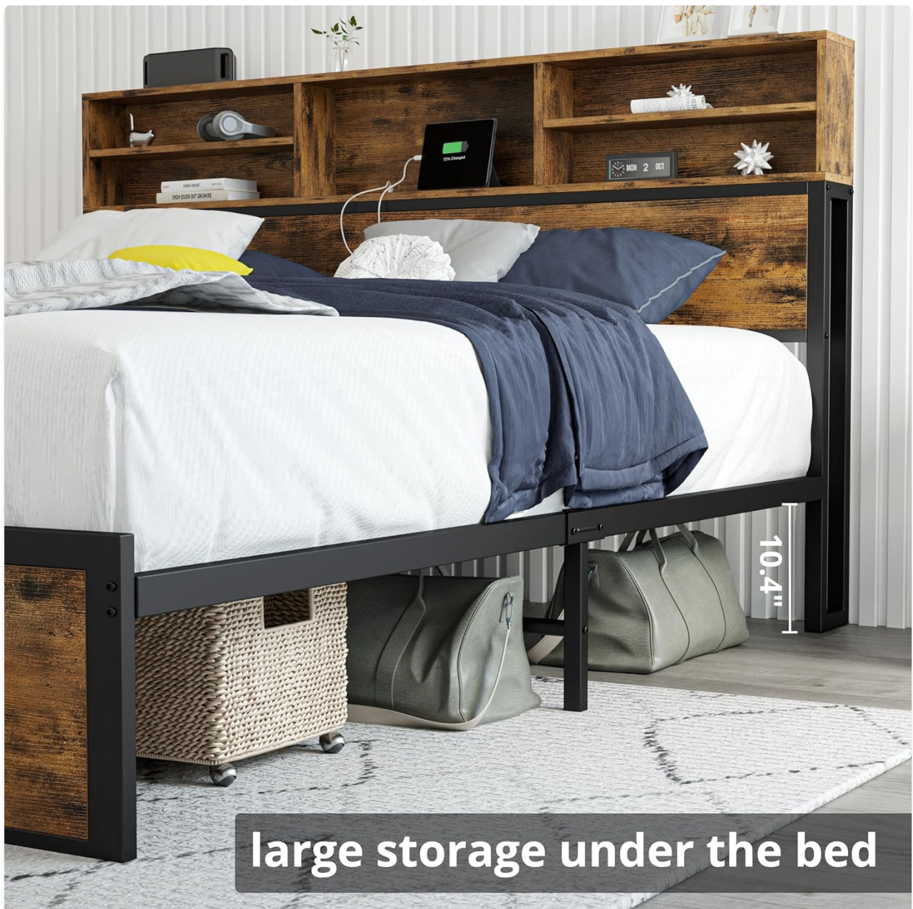
Figure 6: View of the generous under-bed clearance, suitable for storing bags and boxes.